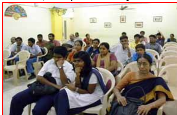
Quiz on Japan – 2010 Section of audience