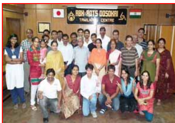
Group photo taken during the interpreters meeting