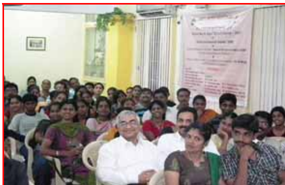
Section of the Audience during the Prize Awarding Ceremony