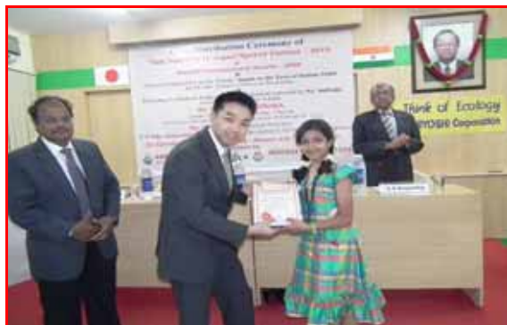
Certificate awarded to the winners of Ajantha Drawing Competition