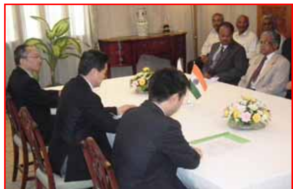
Photographs taken during the certificate of Japanese Foreign Minister's Commendation awarding ceremony at the Consulate General of Japan at Chennai