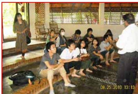
Photographs taken during the JISC Members visit to SOS Village