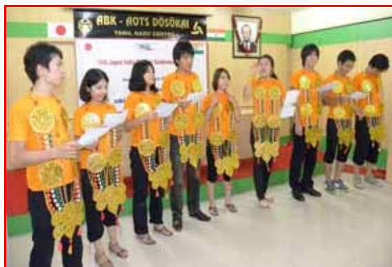
Cultural Program of JISC Members during the Valedictory Ceremony of Japan India Students Conference at Chennai