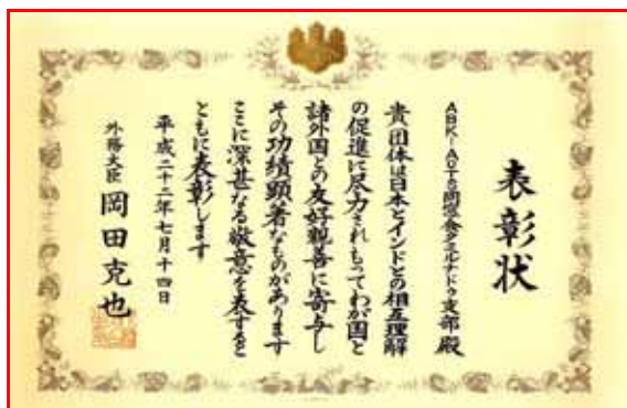
Certificate of Japanese Foreign Minister's Commendation awarded to our Centre