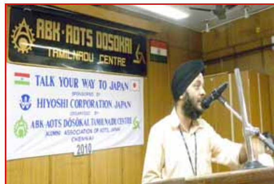
Talk Your Way to Japan – Speech Contest in Progress