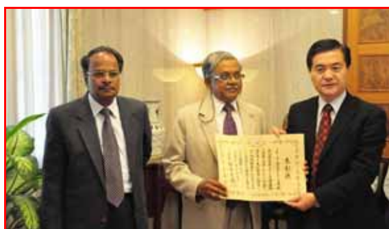
Photographs taken during the certificate of Japanese Foreign Minister's Commendation awarding ceremony at the Consulate General of Japan at Chennai