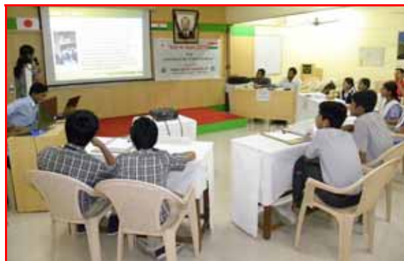
Quiz on Japan – 2010 in Progress