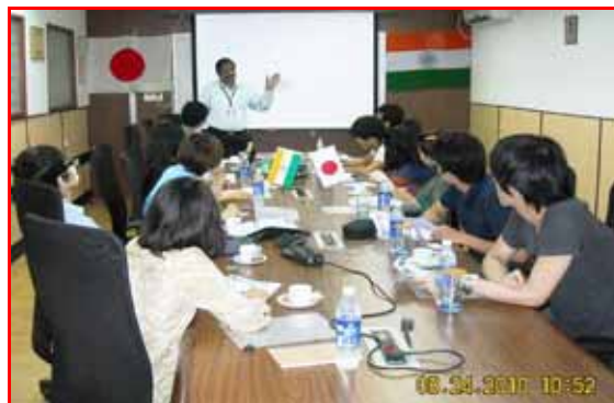
JISC Members visiting Nihon Technologies Pvt. Ltd