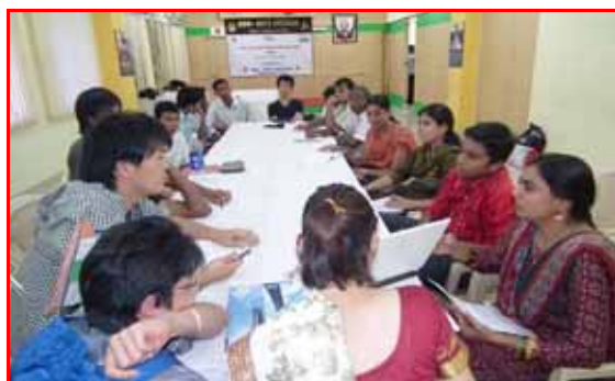
Table discussion with JISC Members & the students of our Nihongo Gakko of our Centre