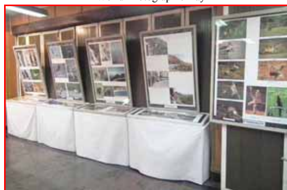
section of exhibits during the World Photographic Day