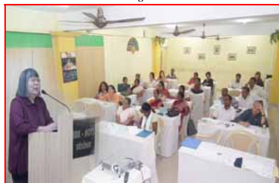
Japanese Language Teaching Seminar – Session in Progress