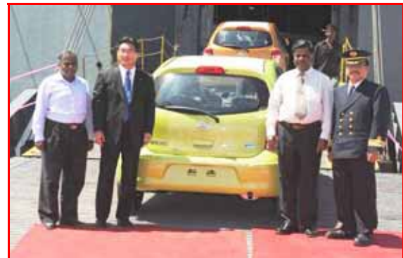
First Batch of Nissan Micro Cars Export to Europe

ABK – AOTS DOSOKAI, Tamilnadu Centre Congratulates Nissan Motor India Pvt. Ltd (NMIPL) & Renault Nissan Automotive India Pvt. Ltd (RNAIPL) for the First Batch of Nissan Micro Cars Export to Europe from it's Tamilnadu Plant. It is a proud moment for all of us in Tamilnadu