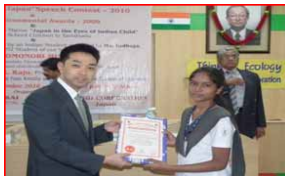
Certificate awarded to the winners of Ajantha Drawing Competition