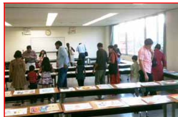
Section of drawing displayed at Ajantha – 2010 at Japan