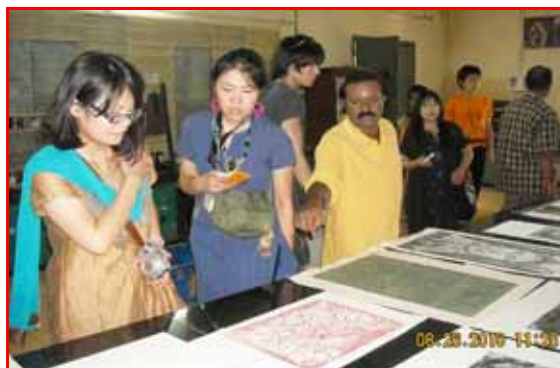
Photographs taken during the JISC Members visit Government Arts & Crafts College