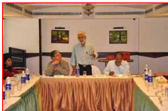
FAAAI - Incoming Office bearers