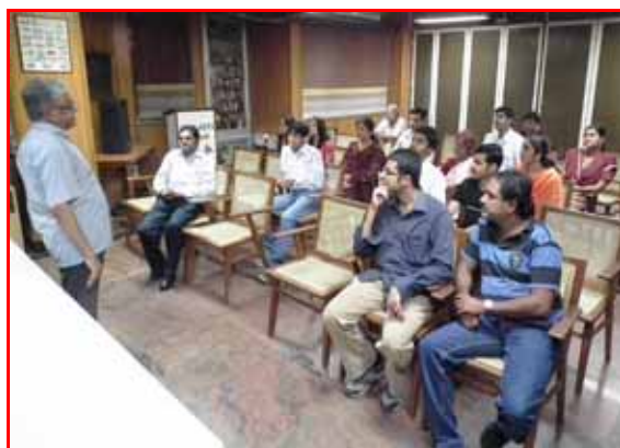
Interpreters Review meeting in progress

Meeting was organized for the interpreters of our centre followed by dinner on 31 July 2010