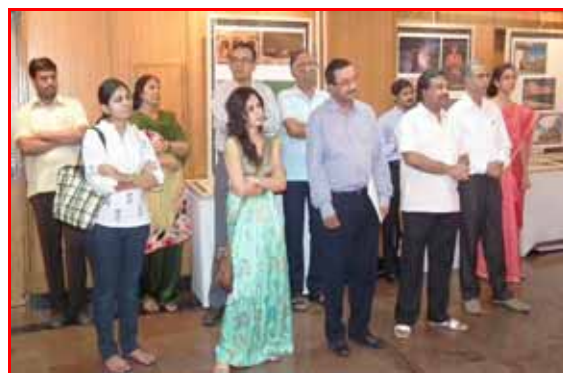
section of visitors audience during the inaugural ceremony of World Photographic Day