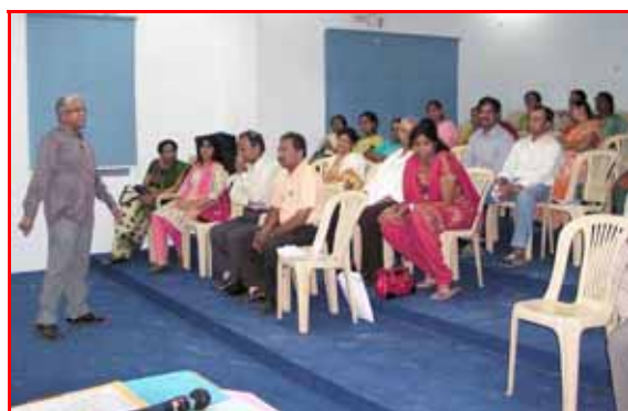
JLPT 2010 (July) – Proctors Meeting in Progress

The New Japanese Language Proficiency Test, (JLPT) will be held twice a year on the first Sunday of July & December Annually. Our centre has been identified for conducting the Japanese Language Proficiency Test for N1, N2 & N3 for entire South India on 4 th July 2010.