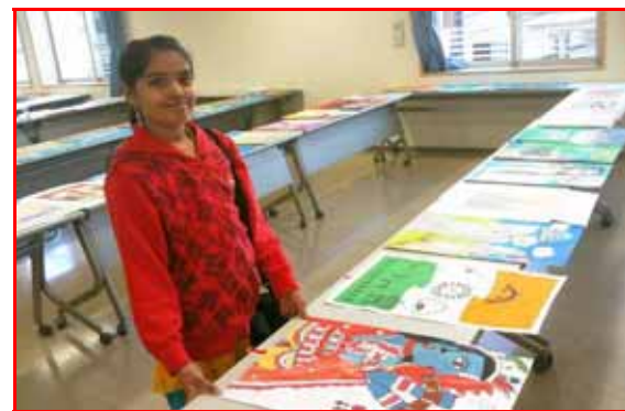
Section of drawing displayed at Ajantha – 2010 at Japan