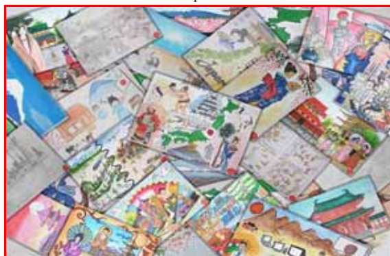
Section of drawing received for the Ajantha Drawing Competition