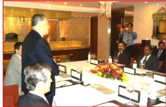
H.E. Mr. Yoshiro Mori, Chairman of JIA and Former Prime Minister of Japan addressing to the participants