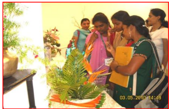
Exhibition of Ikebana by Ohara School , Chennai Chapter.