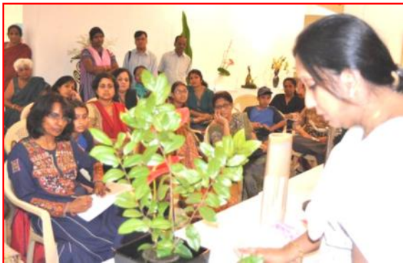
The exhibition and Demonstration being enjoyed by Visitors.

Ohara School Chennai Chapter. (4 th to 6 th March)