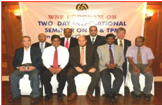
Group Photo taken during the Two Day International Seminar