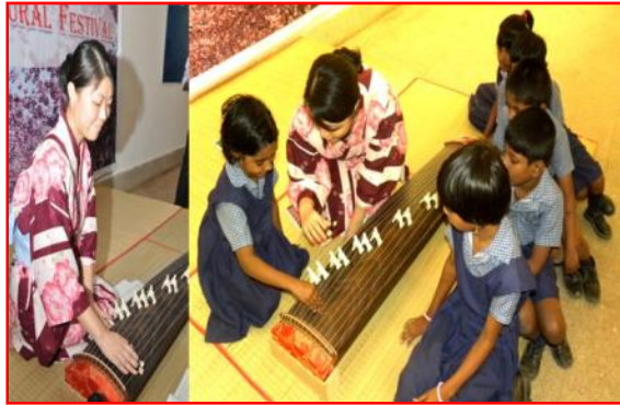
Young Students joyfully attempting to play Koto

Koto is a traditional Japanese stringed musical instrument. It is made from kiri (paulownia) wood having 13 strings over 13 movable bridges.