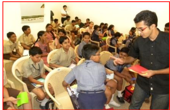
School Children's enthusiastic participation