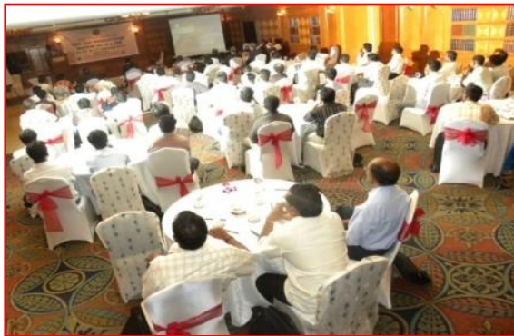
Participants of the Two Day International Seminar