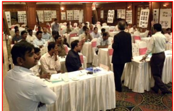
Section of delegates during the Two Day Training Program