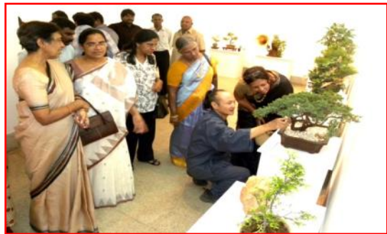
Visitors enjoying the Bonsai Exhibition