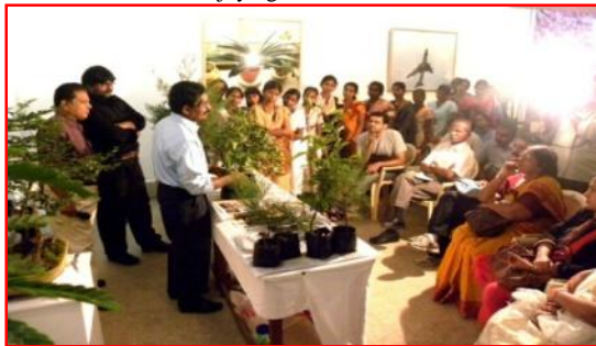
Demonstration of Bonsai by Bodhi Chennai Bonsai Association