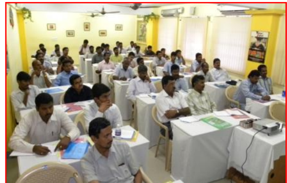
Participants of the Japanese Management Training Program