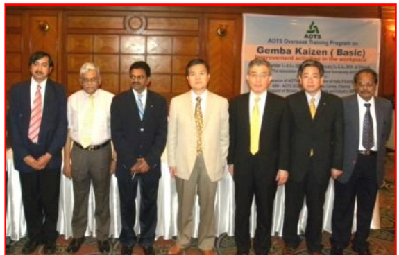
Group Photo taken during the Certificate Awarding Ceremony