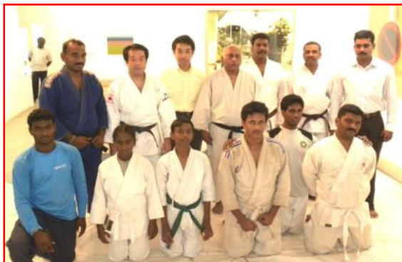
Visitors enjoying the Judo Demonstration and Judo team