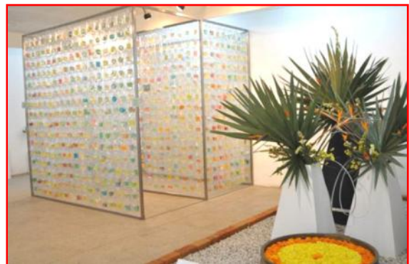
Exhibits from Japan Foundation

The Japanese Art Exhibition “Passage to the Future: Art from New Generation in Japan” was an exhibition that focused on Art being produced in Japan at the beginning of the 21 st century. This exhibition presented paintings, sculptures, installations, photographs and video works by eleven artists.