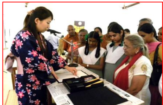
Demonstration of Shodo – Japanese Calligraphy

Shodo, Japanese calligraphy, is the art of writing characters using a brush and Chinese ink. In it, beauty is sought through the shape and position of the characters drawn, the gradation of the ink, and the force of the brushstrokes. Visitors had an opportunity to experience the technique of the art.