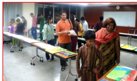
Displays our drawing in the 3 rd Ajantha – The Drawing Competition was held on 26 September 2009 at Japan