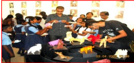
School Children's enthusiastic Participation