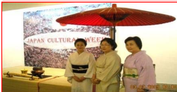
Tea Masters - Sponsored by Japan Foundation.