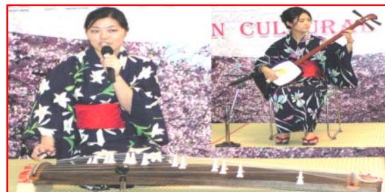
Koto and Shamisen Demonstration