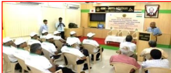
WNF Program on Study Tour to Chennai, India