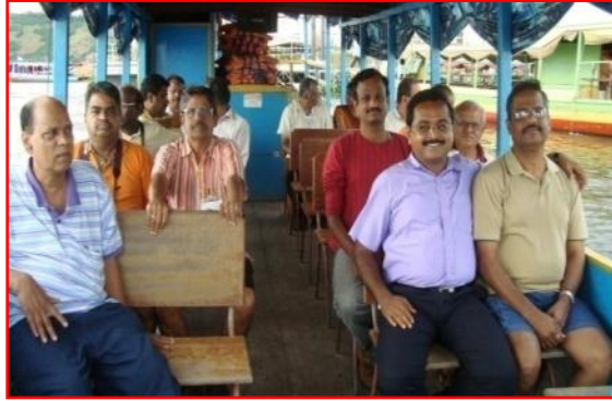
13 th JISC visit to Chennai