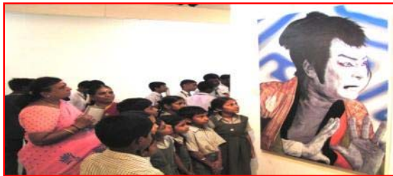
Sharaku Interpreted by Japan's contemporary artists

Exhibition organized in collaboration with Consulate General of Japan at Chennai and Japan Foundation.