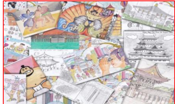
Some of the Drawing

We received 664 drawings from schools in Tamilnadu. These 664 drawings received were sent to Japan to be exhibited in Tokyo along with live-in-japan.com during the 3rd Ajantha – The Drawing competition that was held on Sep 26, 2009. From each category the top three were selected for the I, II and III prizes.