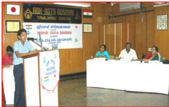
Some of the participants in action during the speech Contest.