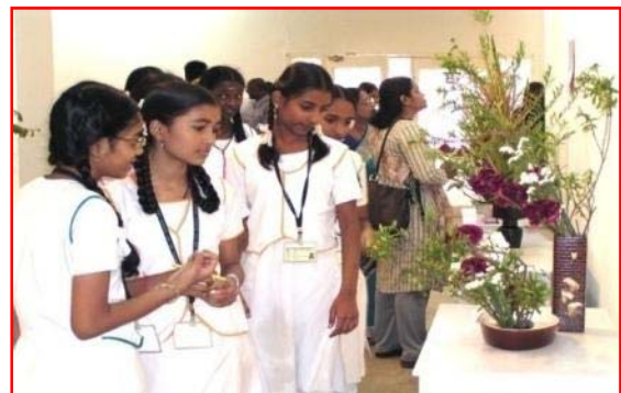
Visitors enjoying the Ikebana Exhibition

Colleges, universities and students please contact us for Hiyoshi 2 months Summer Internship at Hiyoshi Corporation, Japan for students of 3 rd Bachelor,s degree in Bio Tech, Chemical, Environmental Engineering or 1 st year Master's Degree in the above areas – 044 2374 0318 rangaots@eth.net or rangaots@gmail.com . Also kindly contact us for details for Hiyoshi Environmental awards