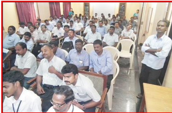
Kaizen Competition in Progress