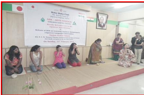
Japanese Tea Ceremony hands on experience by Nihongo Gakko (Japanese Language School) Students of our centre