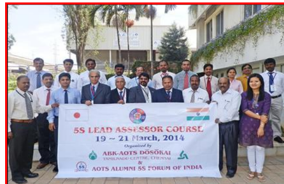
Group photo taken during the 5S Lead Assessor Course

This is jointly conducted by ABK – AOTS DOSOKAI, Tamilnadu Centre and AOTS ALUMNI 5S Forum of India. It is a certificate course to develop skills and expertise needed to audit as well to manage work place management system audits effectively. The objective of this course is to build the required skills, capabilities and competencies for carrying out audits