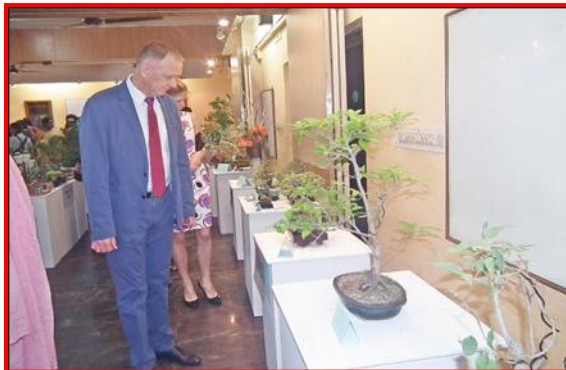
Section of the visitors going around the exhibition of Bonsai

Bonsai (literally, “tray planting”) is the art of growing miniature trees or plants in tray-like containers as if they were in the natural scenery. A “Bon” is a traylike pot usually used in bonsai culture. “Sai” means trees and plants grown in the “bon”. Various techniques including leaf trimming, pruning and wiring are used to create unique aesthetics of “bonsai”.