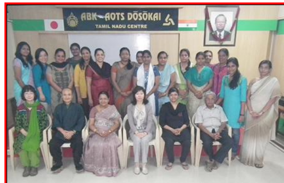
Group Photo taken during the Kyouan Competition