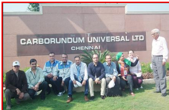
Group photo taken during factory visit to Carborundum Universal Ltd by WNF Program on Concepts & Practices of Total Productive Maintenance (TPM)

This program under WNF activity gave a unique opportunity to the participants from the developing countries to come close to gain knowledge from each other and promote friendship and cooperation for mutual benefit to each other.