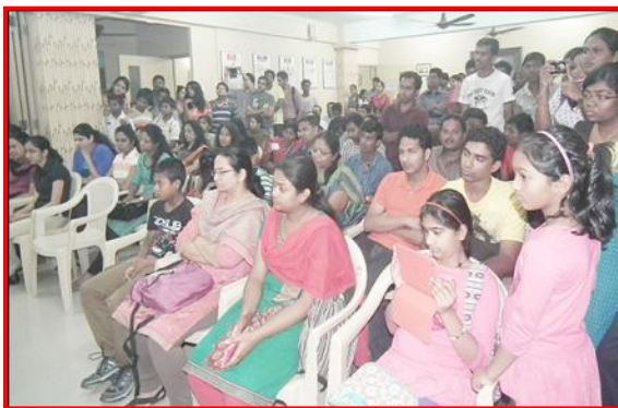
Japanese Tea Ceremony – section of participants