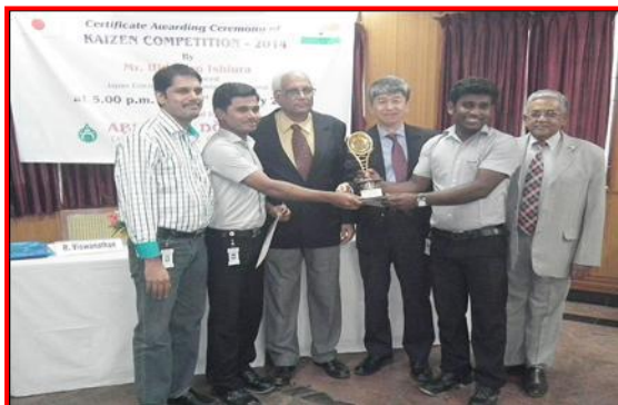
Winners of Kaizen Competition