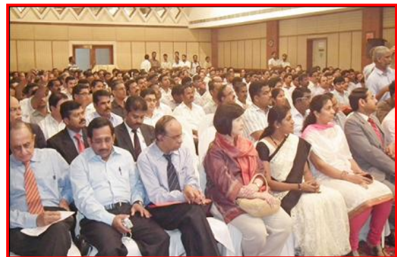
Section of delegates during the One Day Seminar on TPM & 5S Practices

Award Giving Ceremony of 12 th ABK AOTS – CUMI 5S Competition, 10 th ABK – AOTS CDISSIA 5S Competition, 7 th ABK – AOTS PSK 5S Competition for Textile Related Industry & 10 th Annual Award for Good TPM Practices was held on 11 January 2014 between 4.30pm ~5.30 p.m.