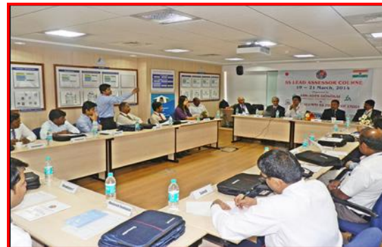
5S Lead Assessor Course in progress