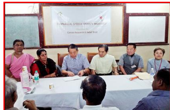
5 th Esophageal speech Therapy Workshop in progress

As part of our Social Responsibility we provided voluntary Japanese Language support services to the Laryngectomy Patients who attended the 5 th Esophageal speech Therapy Workshop organized by Cancer Research & Relief Trust (CRRT) that was held at the ICSA Program Centre, Egmore from 2 to 7 February 2014