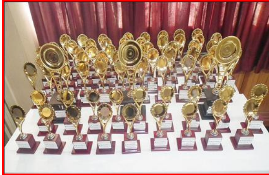
Awards of the Kaizen Competition