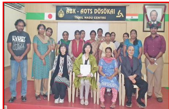
Group photo taken during the Japanese Language Teachers training program