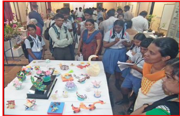
Section of the visitors going around the exhibition of Origami

Origami is a traditional Japanese art of paper folding (“Ori” means to fold and “gami” paper). The goal of this art is to create a figure of an object such as birds and animals by folding only one piece of paper. Visitors will have an opportunity to learn the art of Origami.