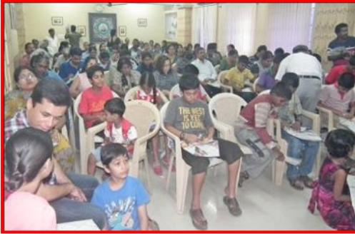
Origami demonstration during the Japan Cultural Festival