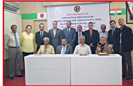
Group photo taken during the WNF Program on Concepts & Practices of Total Productive Maintenance (TPM)