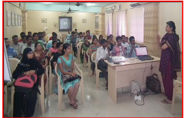
Waku Waku Club - orientation and Japanese Rhymes in progress