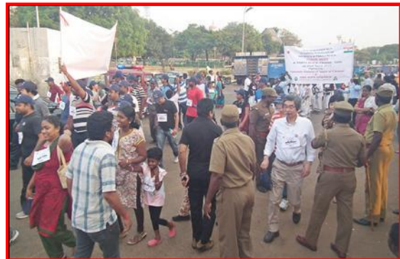
Section of participants of Mini Marathon