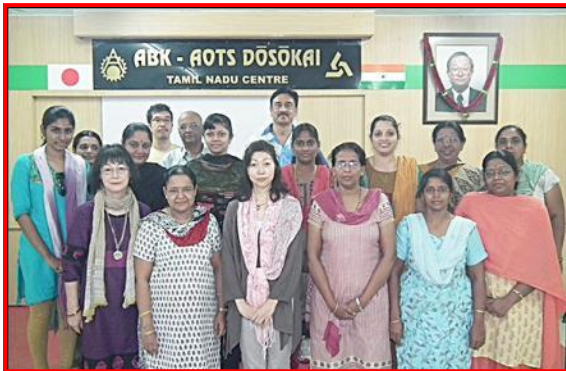
Group photo taken during the Japanese Language Teachers training program