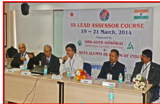
Dignitaries on the Dias during the 5S Lead Assessor Course

The training program will also provide both technical knowledge and practical skills essential to become a competent LEAD ASSESSOR OF 5S PRACTICE by carrying out live audits in a few companies i.e. M/s. Volvo India Pvt. Ltd, Bangalore & M/s. ACE Designers, Limited Bangalore 16 participants from 7 companies participated in this program.