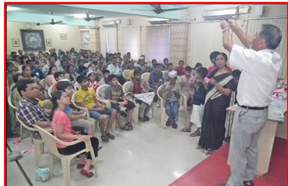
Origami demonstration during the Japan Cultural Festival