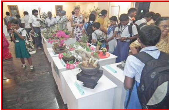
Section of the visitors going around the exhibition of Ikebana

Ikebana is a Japanese art of flower arrangement. It is more than simply putting flowers in a container. It is a disciplined art form in which the arrangement is a living thing where nature and humanity are brought together. Ikebana is a creative expression with certain rules of arrangements. Most of its materials are live branches, leaves, grasses and flowers. Its heart is the beauty resulting from color combinations, natural shapes, graceful lines, and the meaning latent in the total form of the arrangement.