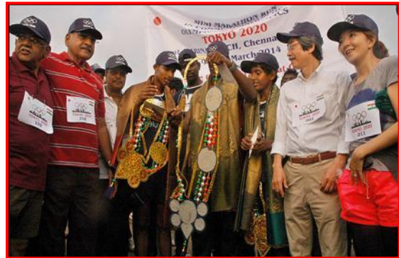
Winners of the Mini Marathon are being felicitated