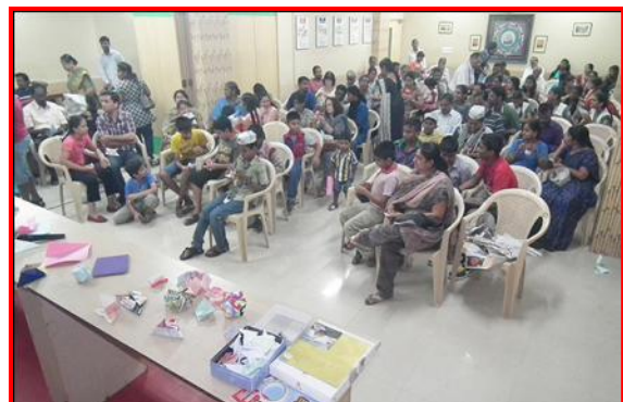
Origami demonstration during the Japan Cultural Festival