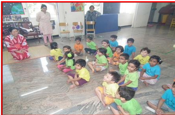
Session in progress