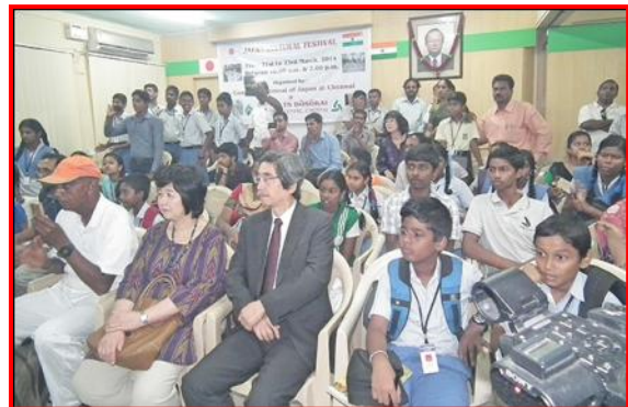
Section of the audience