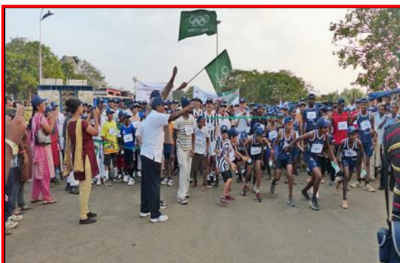
Section of participants of Mini Marathon