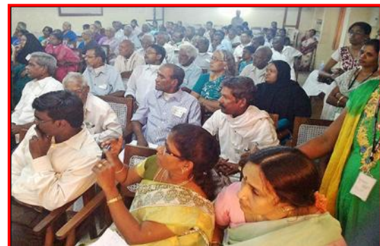
5 th Esophageal speech Therapy Workshop – section of participants