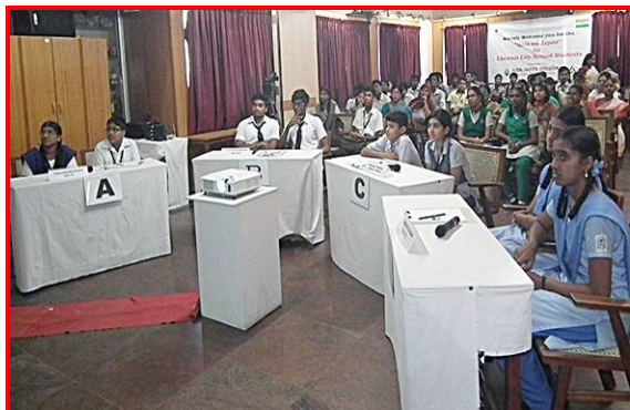
Quiz on Japan – 2013 in Progress