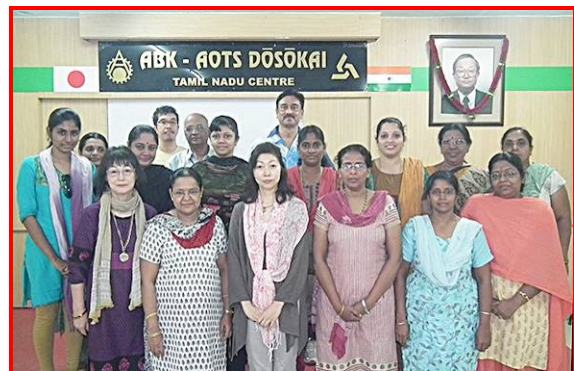
Group photo taken during the Japanese Language Teachers training program