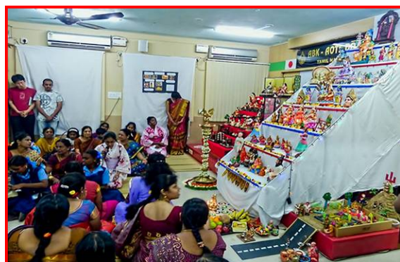
Section of the participants during the Navarathiri Celebrations