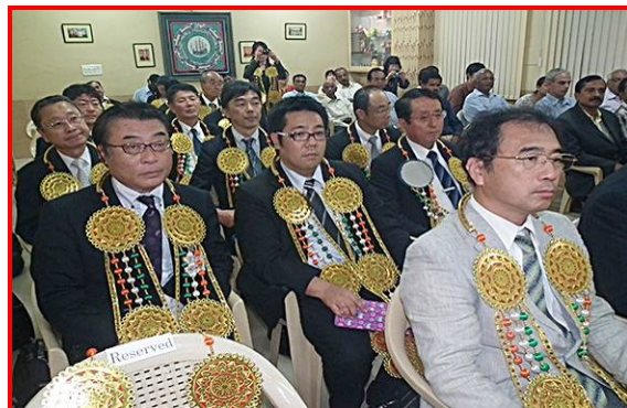
Section of delegates from Sanin India Association, Japan