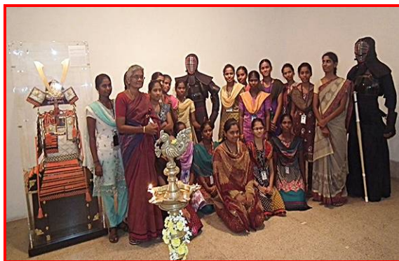
Section of visitors during the exhibits