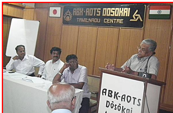
Our chairman speak during the Annual General Body Meeting