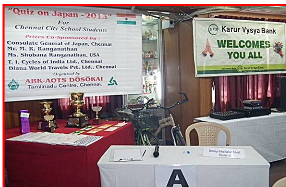
Quiz on Japan 2013 – Prizes for the winners