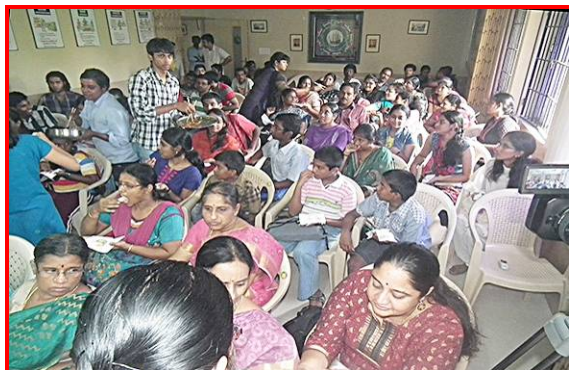
Section of participants tasting the Japanese foods during the live cooking Demonstration on Japanese Food