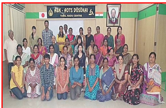
Group photo taken during the Japanese Language Teachers training program