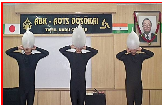
3 GAGA Heads one of the comedy show performance in progress

The following were the winners of the above Speech Contest out of 3 participants in Senior Category.