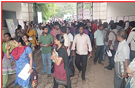
JLPT 2013 (December) – section of examinees entering the venue