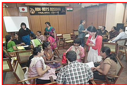
Japanese Language Teachers workshop in progress