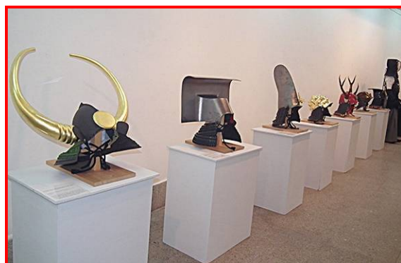
Section of the exhibits