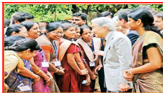
Members, Students, and Teachers of our centre met their Majesties The Emperor and Empress of Japan at Children Park, Guindy during their visit to Chennai - India on 5th December 2013