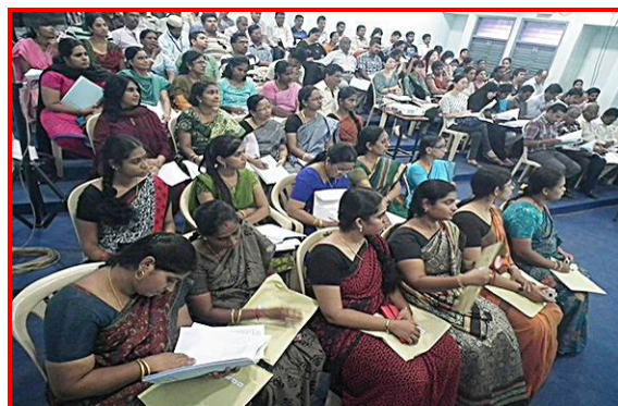
JLPT 2013 (December) – Proctors Meeting in Progress