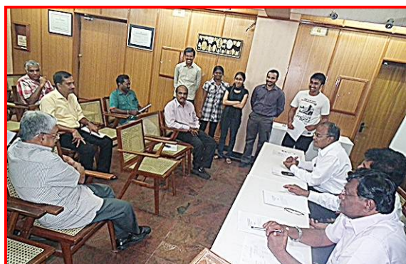
Young members being introduced to the Governing Council during the Annual General Body Meeting