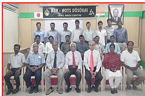
Group photo taken during the Two Day Training Program on “Train the Trainers”