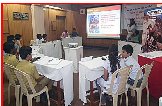
Quiz on Japan – 2013 in Progress