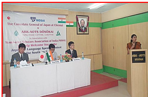
MOSAI Japanese Language Speech Contest for Southern Region in progress