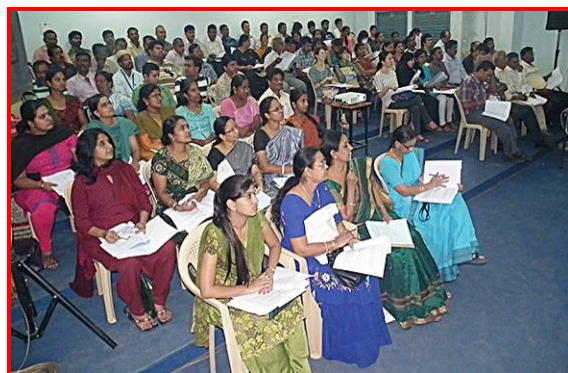
JLPT 2013 (December) – Proctors Meeting in Progress