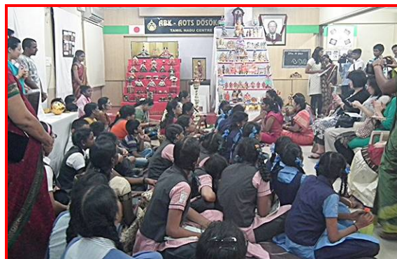
Section of the participants during the Navarathiri Celebrations