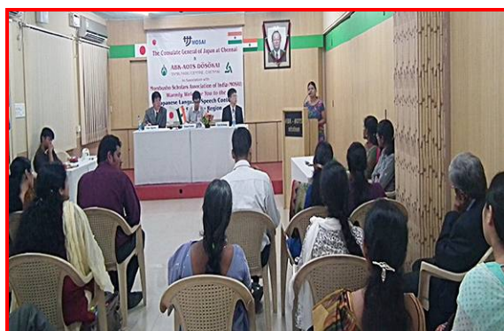
MOSAI Japanese Language Speech Contest for Southern Region in progress