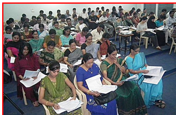
JLPT 2013 (December) – Proctors Meeting in Progress

The Japanese Language Proficiency Test, (JLPT) is being held twice a year on the first Sunday of July & December Annually. ABK – AOTS DOSOKAI Tamilnadu Centre has been identified for conducting the Japanese Language Proficiency Test for N1, N2, N3, N4 & N5 for Kerala, Andhra Pradesh, Tamilnadu & Pondicherry on 1 December 2013.