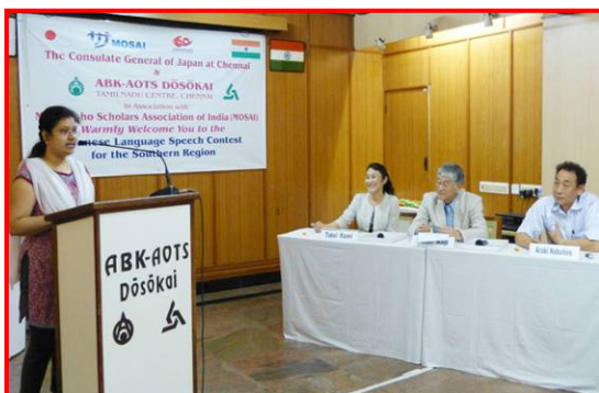
MOSAI Japanese Language Speech Contest for Southern Region in progress