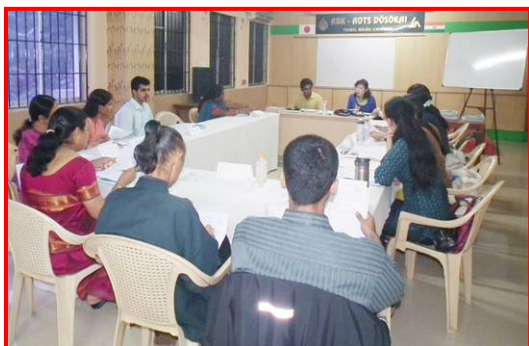
Japanese Language Teachers training program in progress