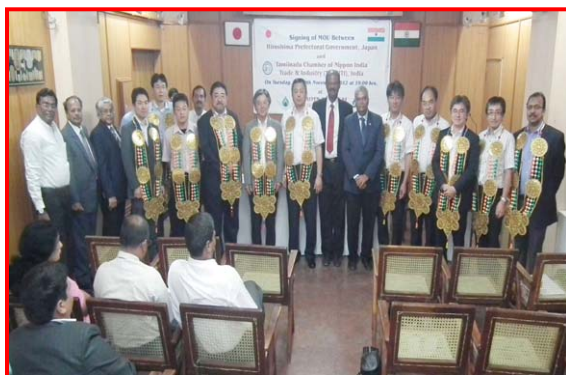
Group photo taken during Signing of MOU between Hiroshima Prefectural Government and TACNITI