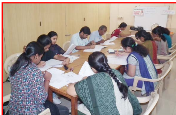
Section of the students taking the JLPT mock test