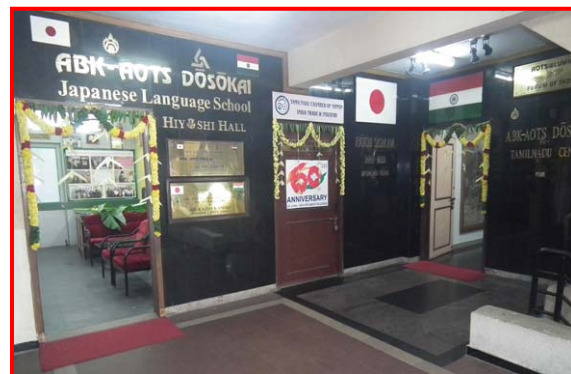
Ayudha Pooja Celebrated at our centre