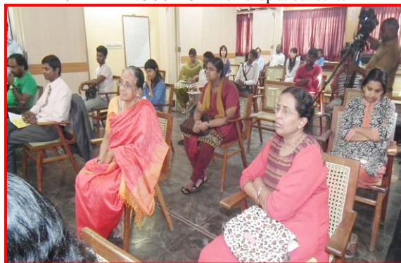
Audience enjoying the OPERA PINOCCHIO workshop and demo