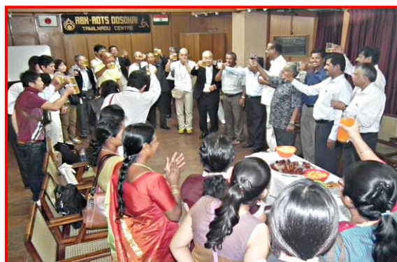
Photographs taken during the welcome dinner for the Team of Iwami Kagura on 5 December 2012 at our center