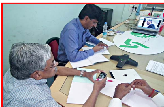
Skype meeting with Kanagawa SME Association and Yokohama India center.