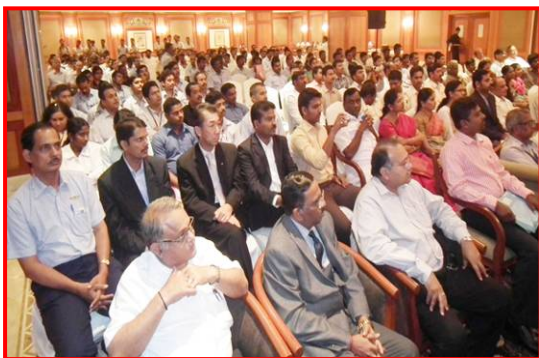
Section of delegates during the One Day Seminar on TPM & 5S Practices