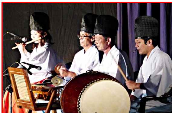
Iwami Kagura Dance Performance in Progress