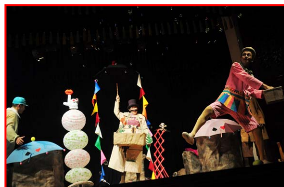
"OPERA PINOCCHIO" in progress