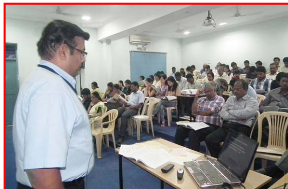
JLPT 2012 (December) – Proctors Meeting in Progress