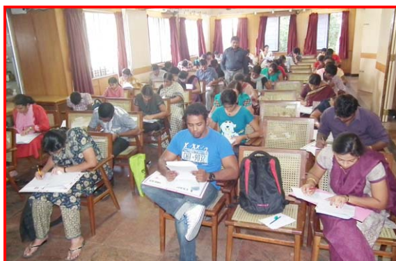
Section of the students taking the JLPT mock test