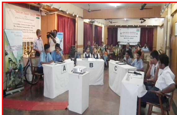
Quiz on Japan – 2012 in Progress