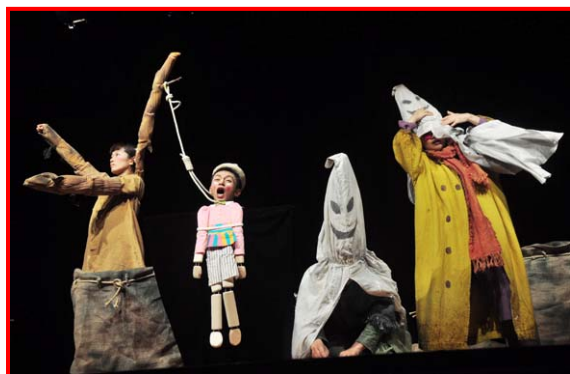
"OPERA PINOCCHIO" in progress

Pinocchio, who has overcome many difficulties throughout his adventures says, "That I am Pinocchio, a wooden puppet! Even a wooden puppet can become strong." and "More strapping and more kind. Even though I can't become a real human boy, I can be happy now!"