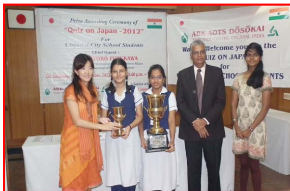
Prize winners of 'Quiz on Japan'