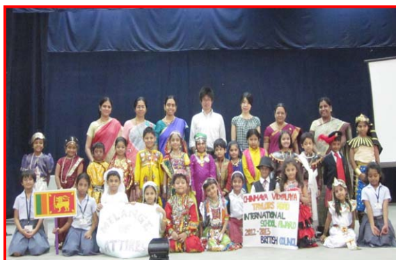
Group photo taken during the "Melange of Attires" at Chinmaya Vidyalaya

The programme, attended by Students, Teachers and Parents, was a visual treat and the good work done by the students was appreciated by all.