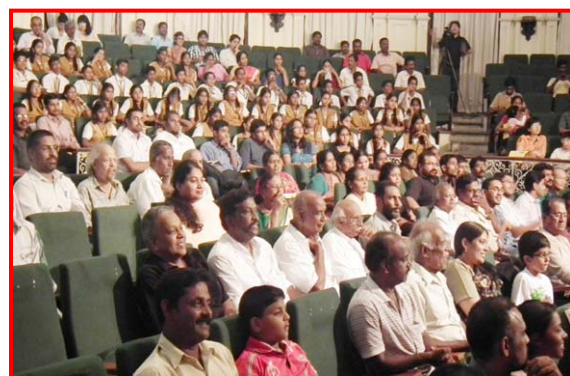
Section of the audience enjoying the OPERA PINOCCHIO