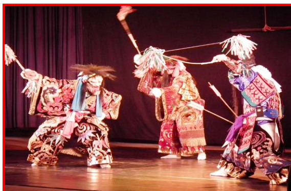
Iwami Kagura Dance Performance in Progress