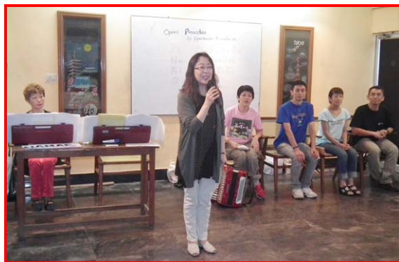
"OPERA PINOCCHIO" Workshop at our center

The Workshop of Opera Pinocchio was conducted at our centre on 8 th October 2012