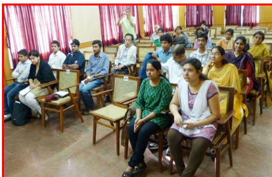
Section of the participants of MOSAI Japanese Language Speech Contest for Southern Region