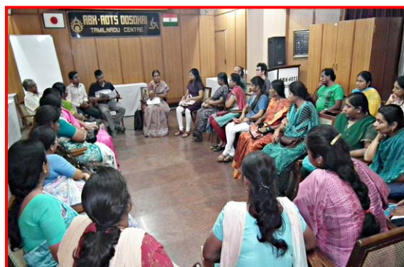
Interactive Session during of the Japanese Language Teachers Meeting

The Japanese Language Teachers Meeting of our centre was held on 22.12.2012 (Saturday) at 5.00pm. at our centre to discuss about the Fresh Classes for Level N5 ~ N1. More than 32 teachers were present and they expressed their suggestions and ideas for improving the teaching methodology to make the classes more informative & interesting.