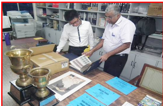
HIDA Interns taken around the centre during the pre orientation meeting