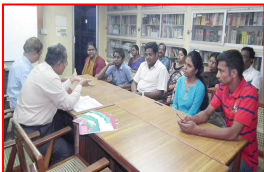
Pre Departure Meeting for Talk Your way to Japan - Speech Contest Winners 2012 - Session in Progress