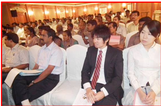
Section of delegates during the One Day Seminar on TPM & 5S Practices