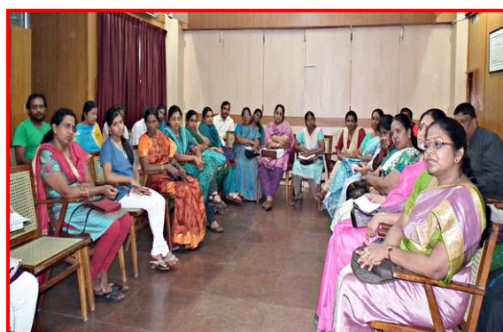
Interactive Session during of the Japanese Language Teachers Meeting