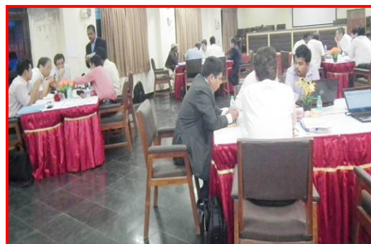
B2B meeting between Japanese SME's from Hiroshima Prefecture with SME's in Chennai in Progress