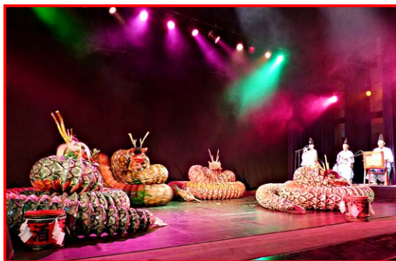
Iwami Kagura Dance Performance in Progress