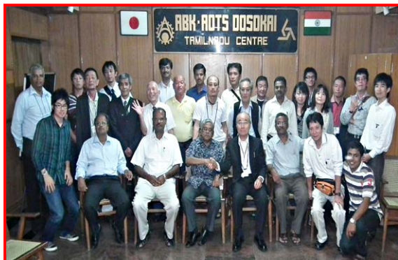
Group photo taken during the welcome dinner for the Team of Iwami Kagura on 5 December 2012 at our center