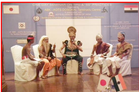
Case study presentation by K. K. P. Fine Linen Pvt. Ltd, ,Namakkal during the ABK-AOTS 5S Trophy for Textile related industries during the Seminar