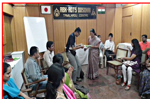
Interactive Session during of the Japanese Language Teachers Meeting