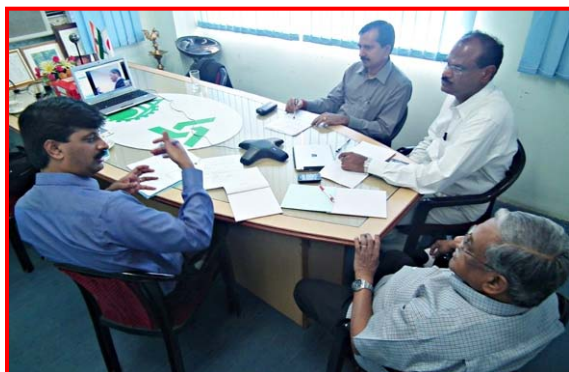
Skype meeting with Kanagawa SME Association and Yokohama India center.