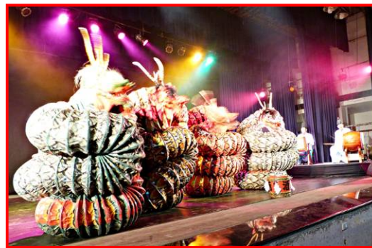
Iwami Kagura Dance Performance in Progress