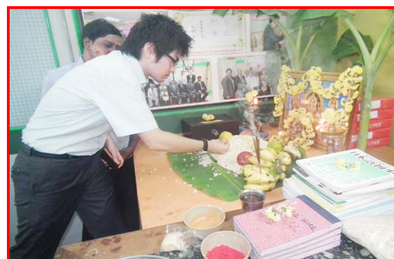
Ayudha Pooja Celebrated at our centre