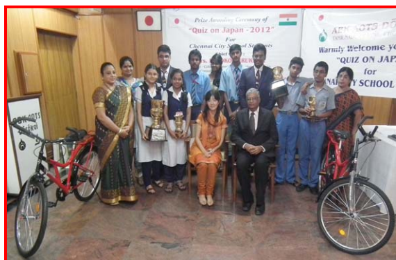
Prize winners of 'Quiz on Japan'