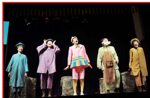
"OPERA PINOCCHIO" in progress