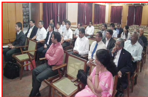
Section of delegates Signing of MOU between Hiroshima Prefectural Government & TACNITI