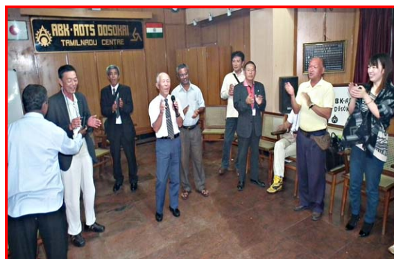
Photographs taken during the welcome dinner for the Team of Iwami Kagura on 5 December 2012 at our center