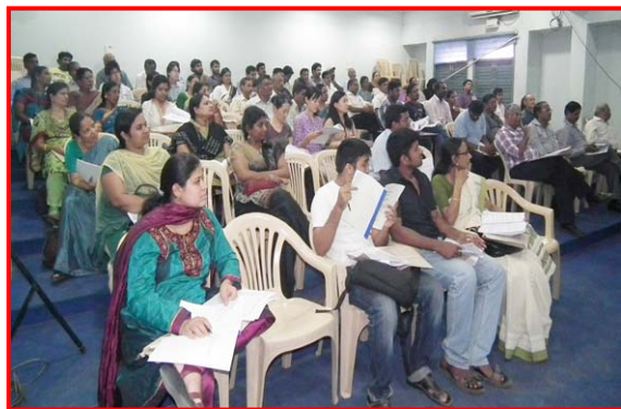
JLPT 2012 (December) – Proctors Meeting in Progress

The Japanese Language Proficiency Test, (JLPT) is being held twice a year on the first Sunday of July & December Annually. ABK – AOTS DOSOKAI Tamilnadu Centre has been identified for conducting the Japanese Language Proficiency Test for N1, N2, N3, N4 & N5 for Kerala, Andhra Pradesh, Tamilnadu & Pondicherry on 2 nd December 2012.