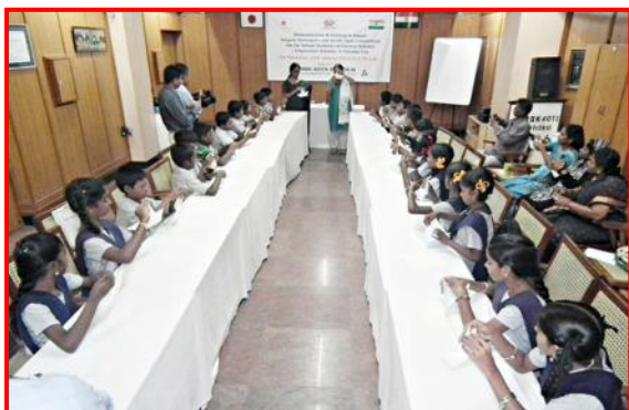
Demonstration and Training in simple Origami Techniques Section in participants