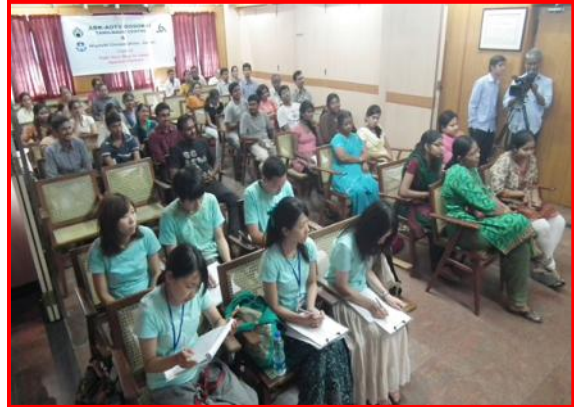
Section of the Audience during the Talk Your Way to Japan Speech Contest in Japanese