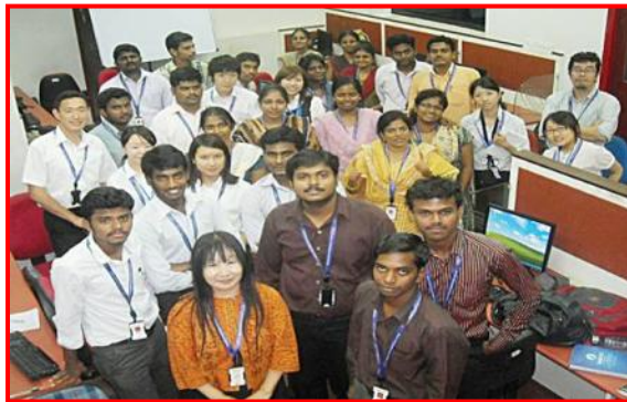
JISC Student group discussion at Nihon Technology Pvt. Ltd,