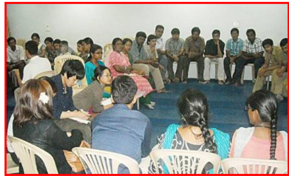
JISC Student group discussion at Meenakshi Sundararajan Engineering College