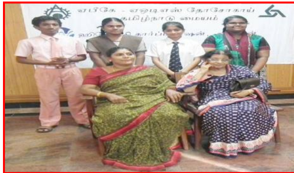
Winners of Talk your way to Japan Speech Contest in Tamil for students of Hr. Sec. Schools in Tamilnadu