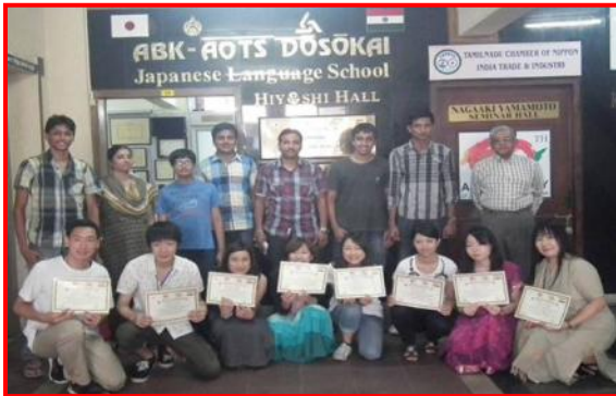
Group photo taken during JISC Student certificate awarding ceremony