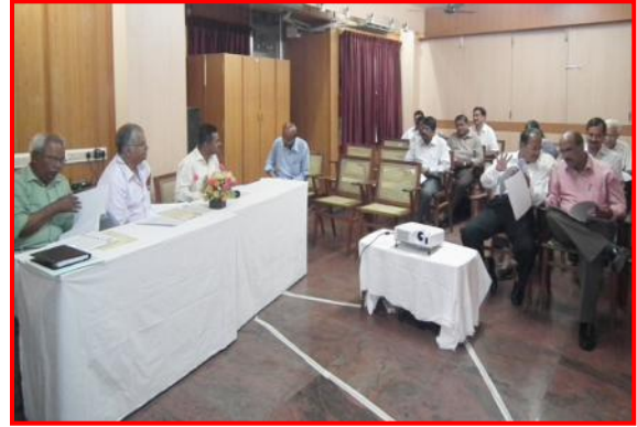
Section of the Annual General Body Meeting