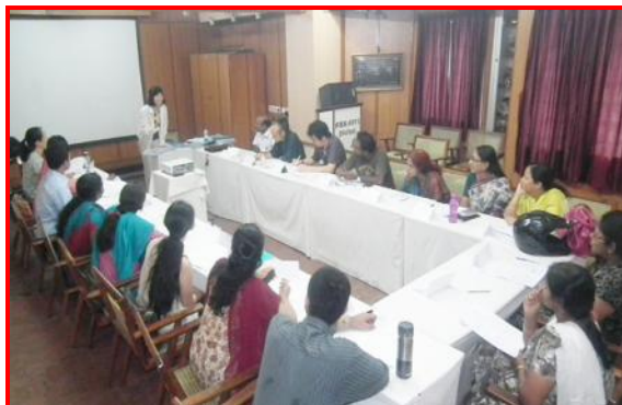
One Day Seminar for Japanese Language Teachers in South India section of the participants