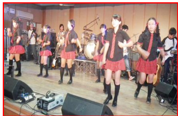
CKB Band performance during the Japan Night – Vol 2