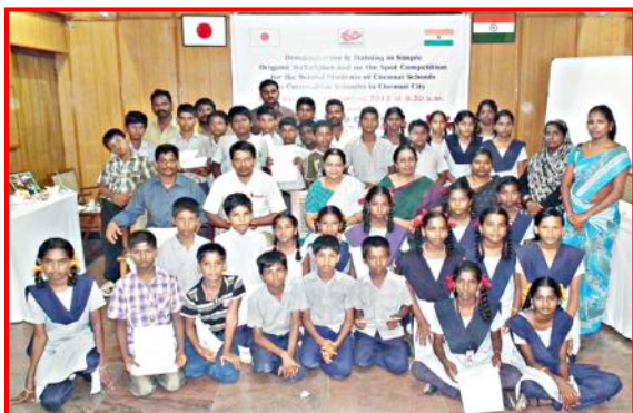
Group photo taken during Demonstration and Training in simple Origami Techniques

India Student Conference in Chennai / India from the year 2009 onwards to discuss and exchange views / opinions on varied topics as detailed below