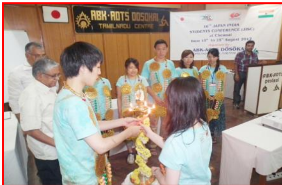
JISC Student lighting of Kuthuvilaku during the Inaugural Ceremony of 16 th Japan India Student Conference.