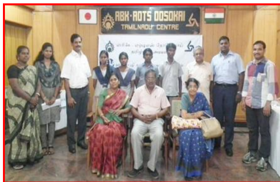
Winners of Talk Your Way to Japan Speech Contest in Tamil