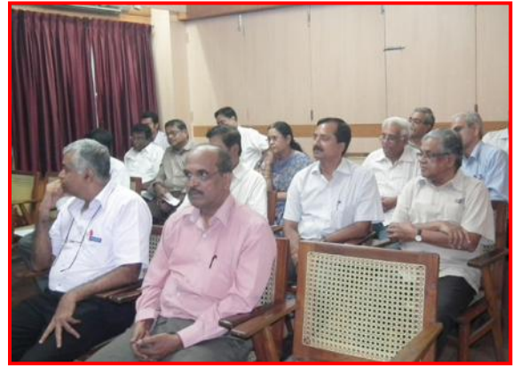
Section of the Annual General Body Meeting