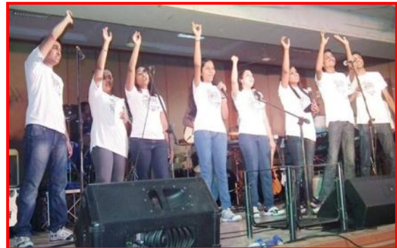
Student of our Nihongo Gakko( Japanese Language School ) performance during the Japanese Night – Vol 2 in progress