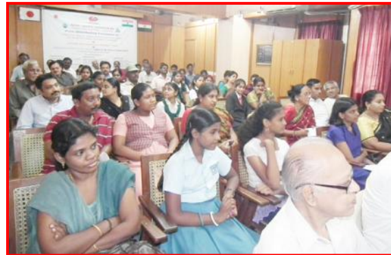
Section of the Audience during the Prize Awarding Ceremony