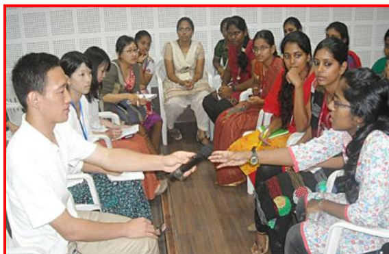
JISC Student group discussion at Shri Shankarlal Sundarbai Shasun Jain College for Women