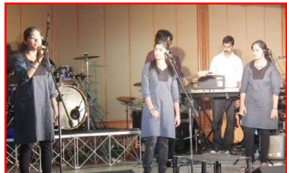
Student of our Nihongo Gakko( Japanese Language School ) performance during the Japanese Night – Vol 2 in progress