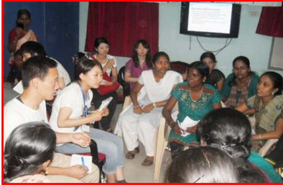
JISC Student group discussion at Quaid-E-Millath Government College for Women (Autonomous)