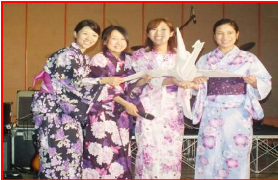
JISC Students' cultural show during the Japanese Night – Vol 2