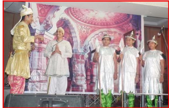
Student of our Nihongo Gakko (Japanese Language School) performance during the Japanese Night – Vol 2 in progress

The event was cosponsored by M/s. Nihon Technology Pvt. Ltd, Chennai, Japan & Germany.