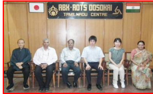
Group photo during the pre orientation of HIDA Interns