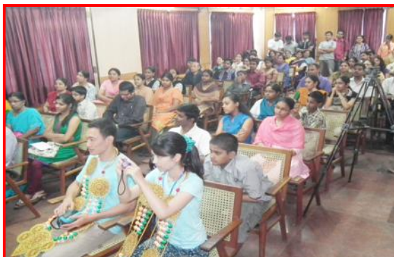
The Inaugural Ceremony of 16 th Japan India Student Conference –