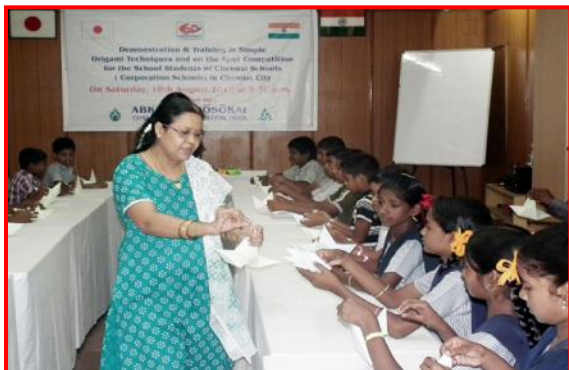
Demonstration and Training in simple Origami Techniques Section in progress