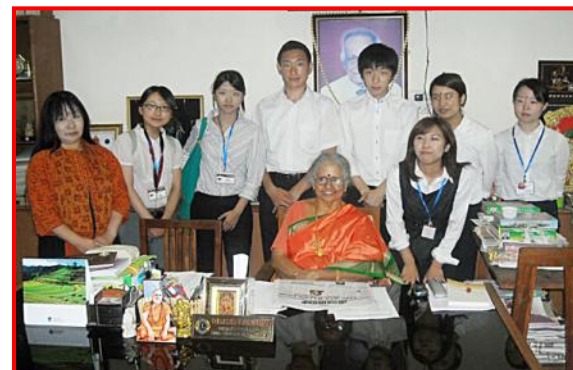
JISC Student group discussion with Meenakshi College for Women, Chennai