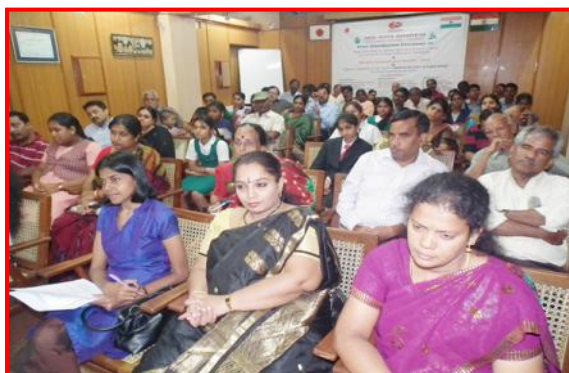
Section of the Audience during the Prize Awarding Ceremony