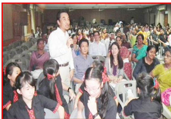
Japanese Night – Vol 2 – Section of the audience