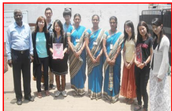
JISC Student Factory visit at Classic Moulds & Dies Pvt. Ltd