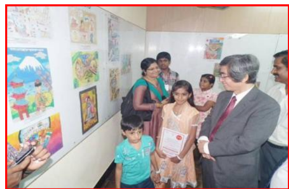
Drawings of the winners of the Ajantha Drawing Competition displayed during the Prize awarding ceremony

From the year 2009 onwards ABK – AOTS DOSOKAI, Tamilnadu Centre in coordination with live-in-japan.com is conducting a Drawing competition among the school students studying between 6 th and 12 th Standard in Tamilnadu on the Theme “ JAPAN from the eyes of Indian Child ”. For the current year out of 405 drawings received from 28 Schools, 22 drawings were selected as prize winners.