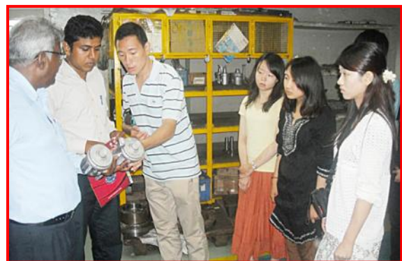
JISC Student Factory visit at Classic Moulds & Dies Pvt. Ltd