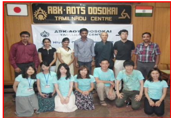
Winners of Talk your way to Japan Speech Contest in Japanese