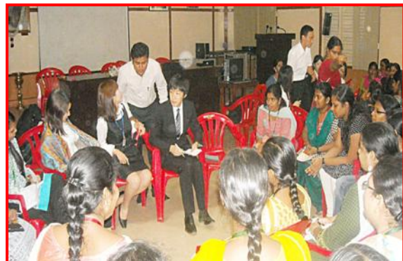
JISC Student group discussion with Meenakshi College for Women, Chennai