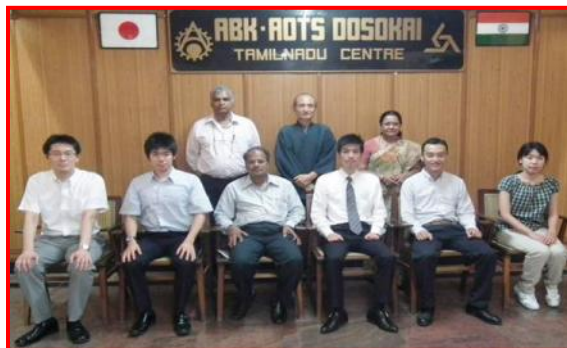
Group photo during the pre orientation of HIDA Interns