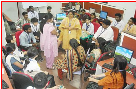
JISC Student group discussion with the Nihon Technology Pvt. Ltd