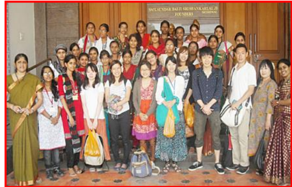
JISC Student group discussion at Shri Shankarlal Sundarbai Shasun Jain College for Women