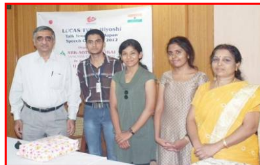
Winners of Talk your way to Japan Speech Contest in English for College students in Tamilnadu