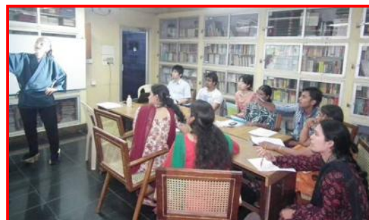
HIDA Interns and our students during the Japanese Language Class