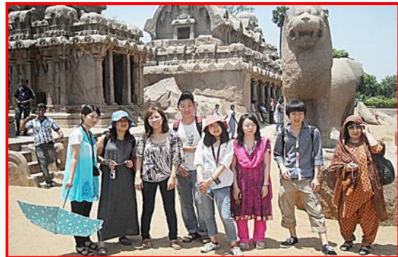
JISC Student site seeing work at Mahabalipuram