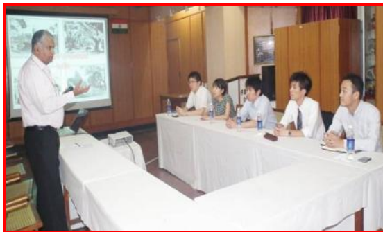
Pre orientation of HIDA Interns – Section in progress