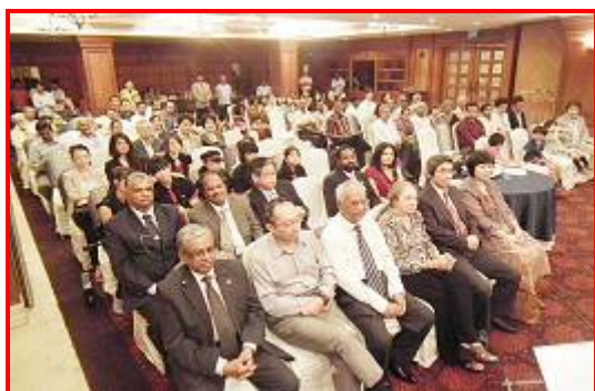
Section of audience during Japan Cultural Festival – Inaugural Ceremony on 16 th March 2012