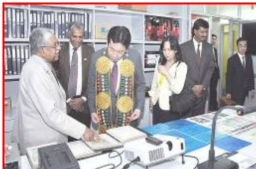
His Excellency Mr. Yudio Edano, Honourable Minister, Minister of Economy Trade & Industry (METI), Government of Japan, during his visit to our centre on 10 th January 2012