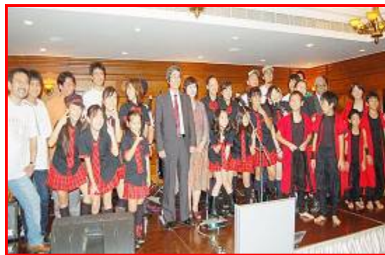
Group photo taken during the Japan Cultural Festival – Inaugural Ceremony on 16 March 2012