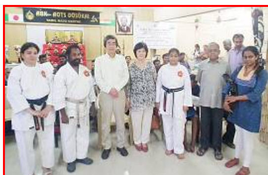
Group photo taken along with the Karate Demonstrators during the Japan Cultural Festival