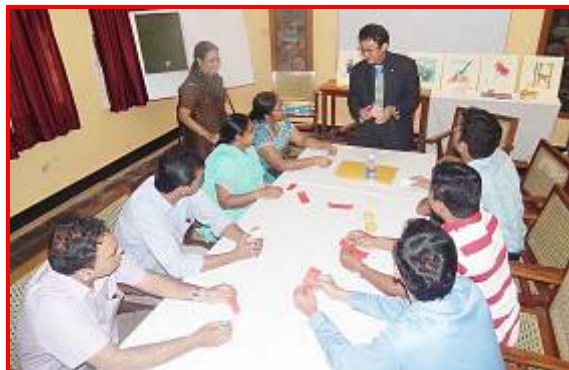
Demonstration and Practice on Origami in progress