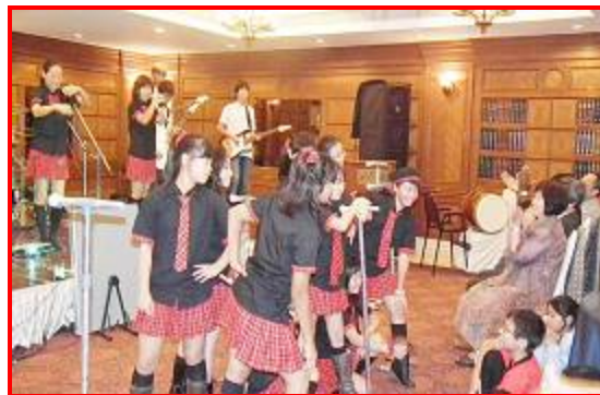
CKB Band performance during the Japan Cultural Festival – Inaugural Ceremony on 16 March 2012