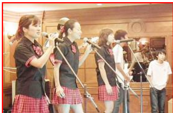
CKB Band performance during the Japan Cultural Festival – Inaugural Ceremony on 16 th March 2012