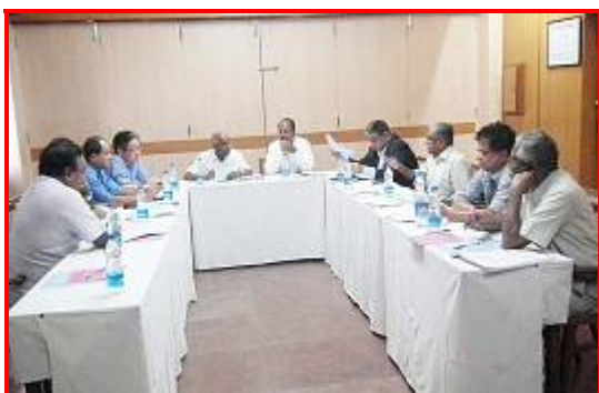
Executive Committee Meeting of FAAA held at our centre