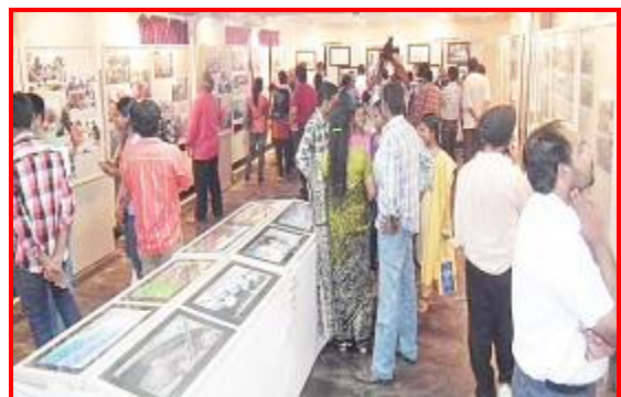
Visitors going around The Photo Exhibition of "Triple Disaster First Year Memorial Day & Japan Resilience Day"