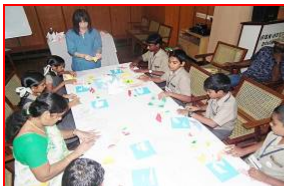
Demonstration and Practice on Origami in progress