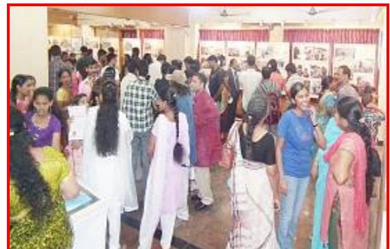
Visitors going around The Photo Exhibition of "Triple Disaster First Year Memorial Day & Japan Resilience Day"