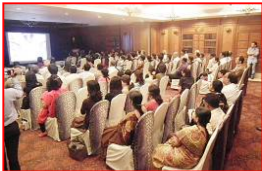
Group photo taken during the Japan Cultural Festival – Inaugural Ceremony on 16 th March 2012