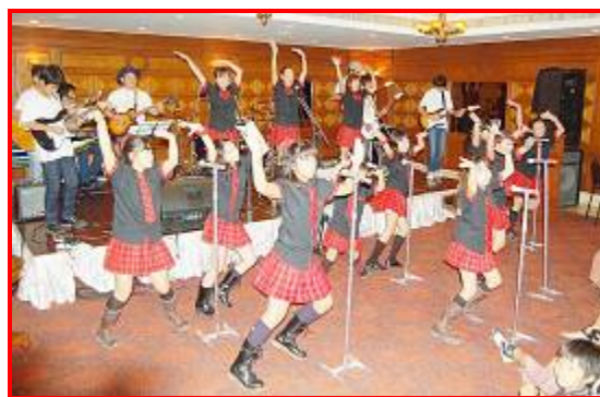
CKB Band performance during the Japan Cultural Festival – Inaugural Ceremony on 16 March 2012