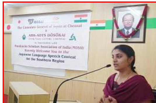
MOSAI Japanese Language Speech Contest in progress