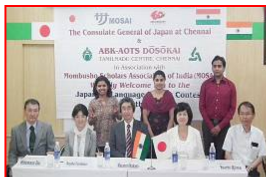
MOSAI Japanese Language Speech Contest Senior Category winners