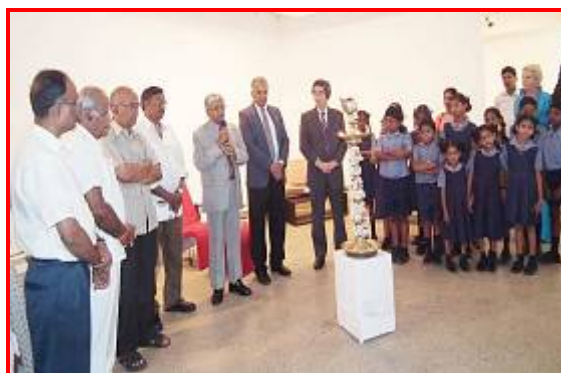
Inaugural ceremony of "Japanese Design Today 100" at Lalit Kala Akademi on 19 th January 2012