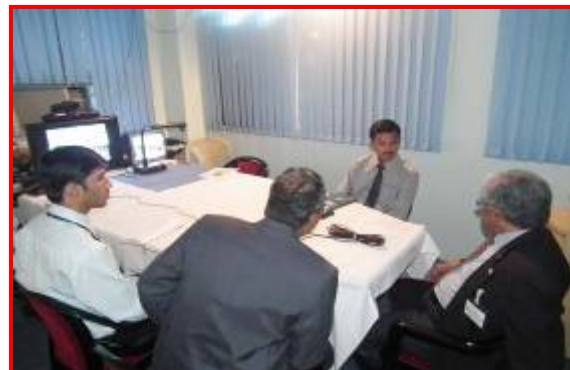
Video Conference with JEMCO Consultants, Japan in progress