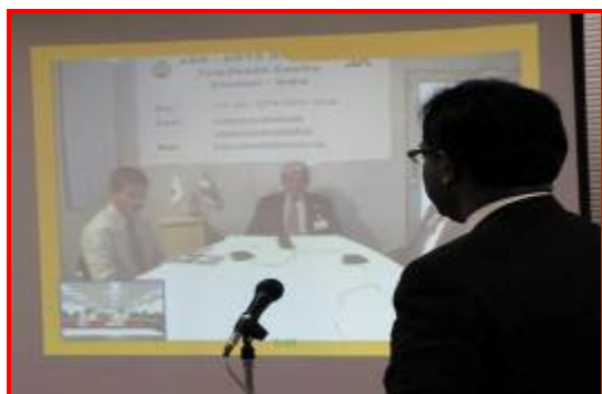
Video Conference with JEMCO Consultants, Japan in progress