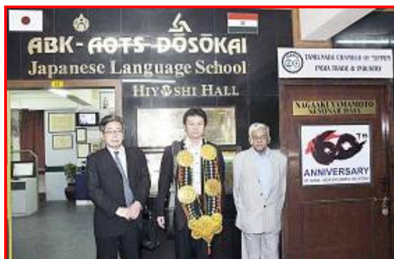
Photograph taken during the visit of Mr. Shirai , Deputy Minister, Minister of Economy Trade & Industry to our centre on 18 th January 2012