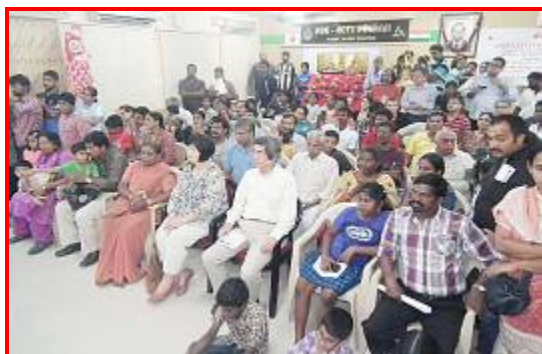
Section of the audience during Judo Demonstration the Japan Cultural Festival