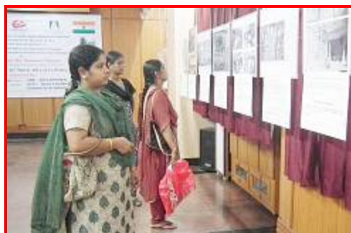
Visitors going around the Photo Exhibition The History of India – Japan Exchanges