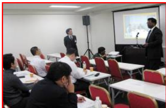
Video Conference with JEMCO Consultants, Japan in progress