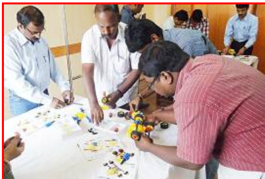
Section of the participants of Lean Practices using Simulation Game