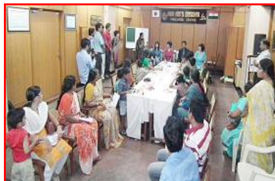
Demonstration and Practice on Origami in progress