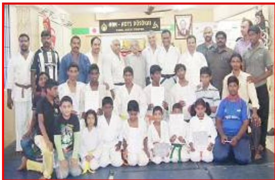
Group photo taken along with the Judo Demonstrators during the Japan Cultural Festival