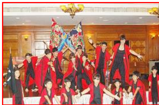
CKB Band performance during the Japan Cultural Festival – Inaugural Ceremony on 16 March 2012