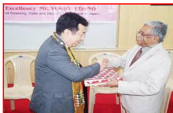
We value your Presence and Present