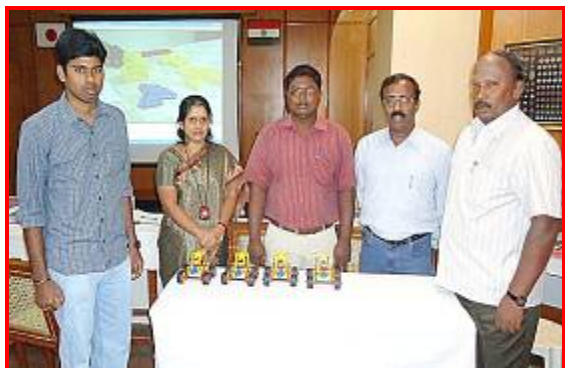
Section of the participants of Lean Practices using Simulation Game