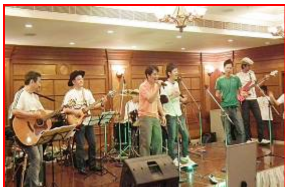
Japan Cultural Festival – Inaugural Ceremony on 16 th March 2012