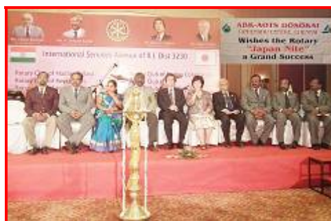
Dignitaries on the Dias during the Japan Nite organized by Rotary