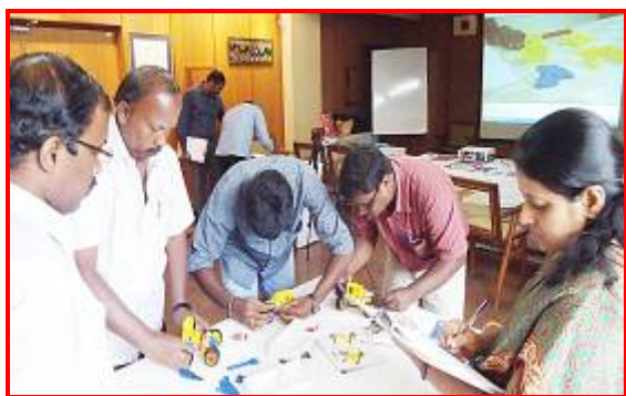
Section of the participants of Lean Practices using Simulation Game