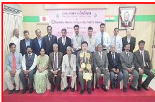
Group photo taken during the visit of His Excellency Mr. Yukio Edano, Honorable Minister, of Economy Trade & Industry (METI), Government of Japan, to our centre on 10 th Jan 2012