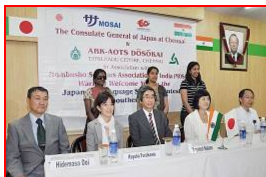
MOSAI Japanese Language Speech Contest Junior Category winners

The Prizes for the Winners were sponsored by Consulate General of Japan at Chennai and ABK AOTS DOSOKAI Tamilnadu Centre, Chennai