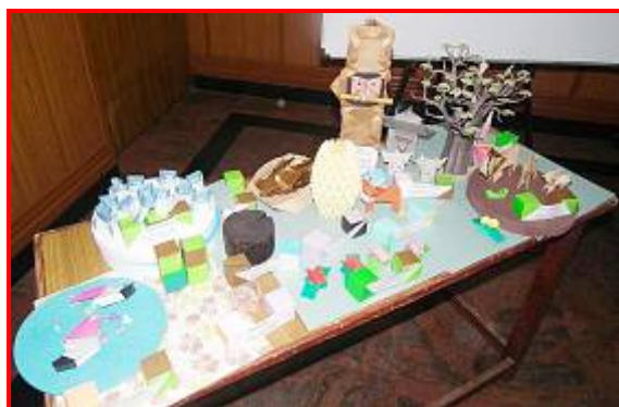
Demonstration and Practice on Origami in progress