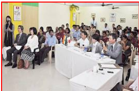
Section of the participants during the MOSAI Japanese Language Speech Contest held at our centre on 19 th January 2012