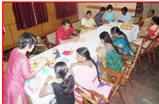
Demonstration and Practice on Origami in progress