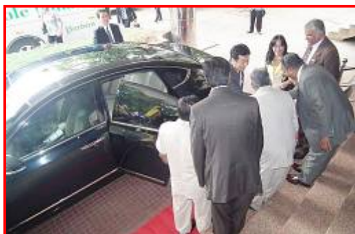
His Excellency Mr. Yukio Edano, Honourable Minister, Minister of Economy Trade & Industry (METI), Government of Japan, during his visit to our centre on 10 th January 2012