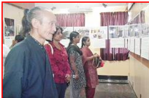
Visitors going around the Photo Exhibition The History of India – Japan Exchanges