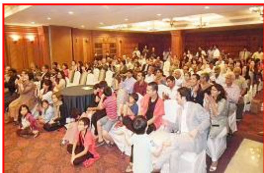
Section of audience during Japan Cultural Festival – Inaugural Ceremony on 16 th March 2012