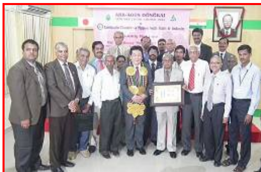
Group photo taken during the visit of His Excellency Mr. Yukio Edano, Honorable Minister, of Economy Trade & Industry (METI), Government of Japan, to our centre on 10 th January 2012