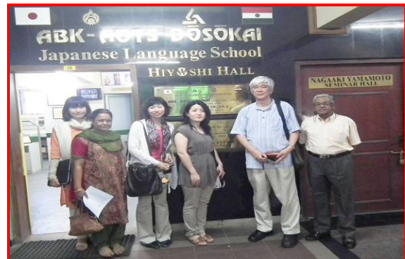
Delegates from Japan Foundation visited our centre on 24.04.2011