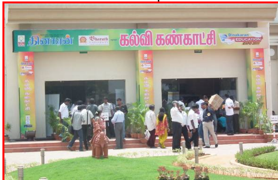
Our participation in the Dinakaran Education Expo 2011 at Chennai Trade Centre on 16 & 17 July 2011