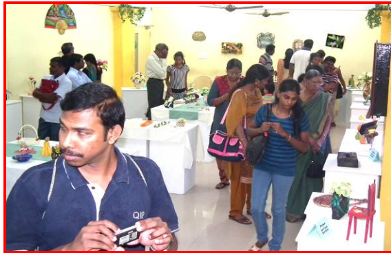
Section of the visitors for the Nendo No Tetsukuri (Clay Handicraft) Exhibition