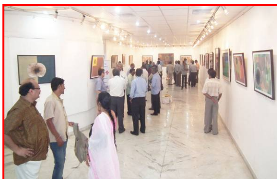
Section of the visitors for "Asuno Apa Painting" Exhibition