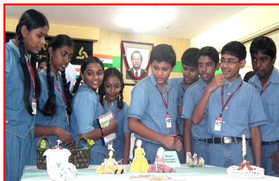
Section of the visitors for Nendo No Tetsukuri (Clay & Handicraft) Exhibition