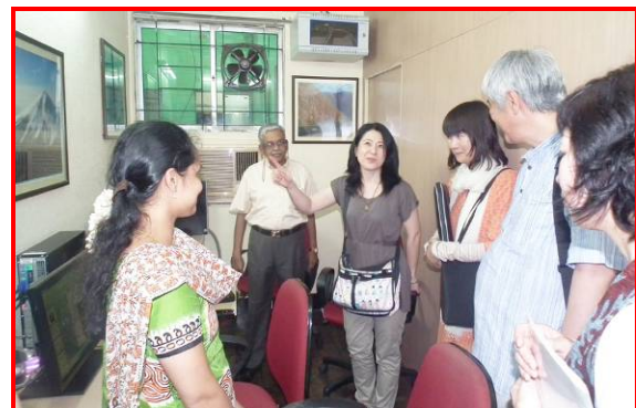
Delegates from Japan Foundation visited our centre on 24.04.2011