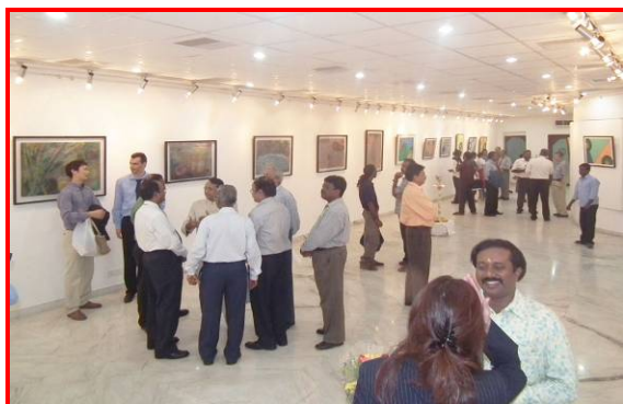
Section of the visitors for "Asuno Apa Painting" Exhibition