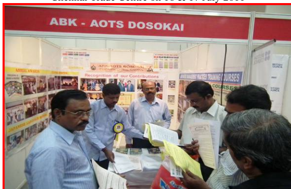
Visitors at Our stall in the Dinakaran Education Expo 2011 at Chennai Trade Centre on 16 & 17 July 2011