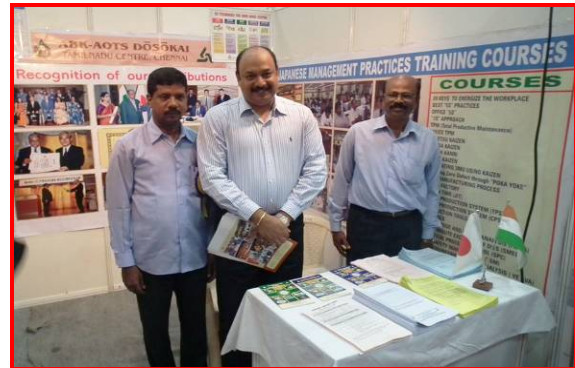
Managing Director of Dinakaran visiting Our stall in the Dinakaran Education Expo 2011 at Chennai Trade Centre on 16 & 17 July 2011