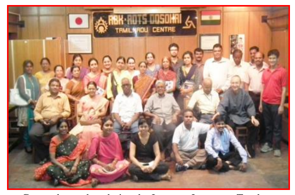
Group photo taken during the Japanese Language Teachers Meeting.