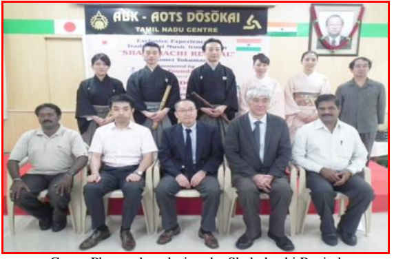
Group Photo taken during the Shakuhachi Recital