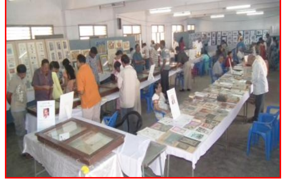
Our exhibits during the dignity passionate collection exhibition

--- 12<sup>th</sup> & 13<sup>th</sup> February 2011---