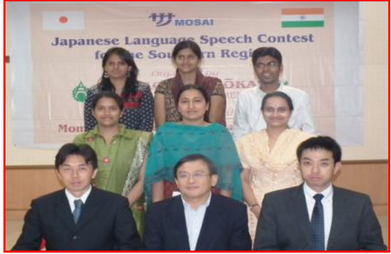
MOSAI Japanese Language Speech Contest for Southern Region winners along with the Judges