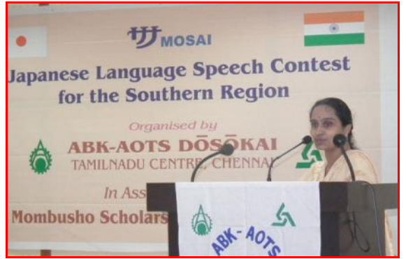
MOSAI Japanese Language Speech Contest for Southern Region in progress