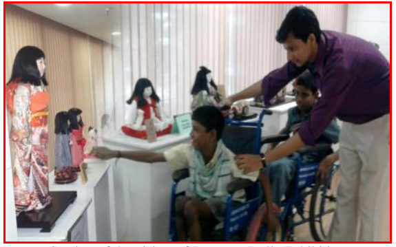
Section of the visitor of Japanese Dolls Exhibition