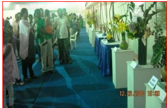
Section of the visitors thronging to view the exhibits in the Japan Pavilion at Dinamalar Smart Shoppers Expo 2010