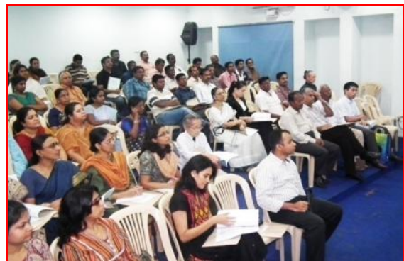
JLPT 2010 (December) – Proctors Meeting in Progress