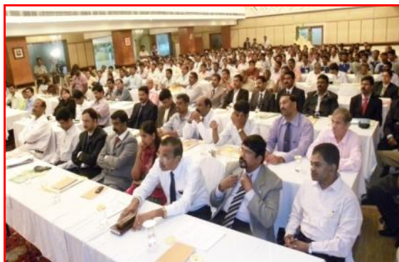
Section of delegates during the Seminar