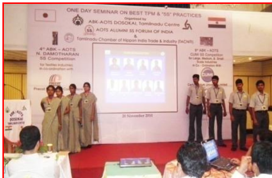
Case study presentation by the Award winners during the Seminar