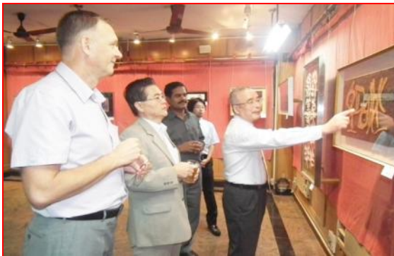
Dignitaries from various Consulates in Chennai viewing the Kokuji Art exhibits displayed at our centre