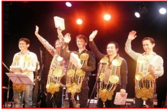
The five musicians of Unit Asia – JAZZ Concert 2010