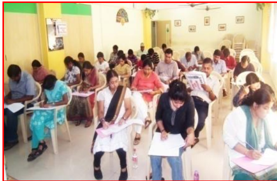
Section of the students taking the JLPT mock test