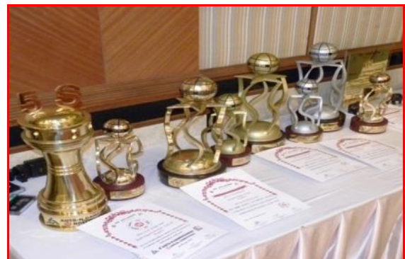
Display of 5s Awards & Certificates