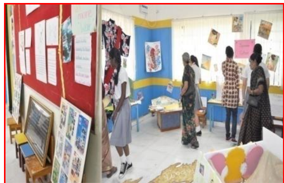
Section of exhibits during the Japan day celebrations at the Gateway the Complete School supported by ABK - AOTS DOSOKAI