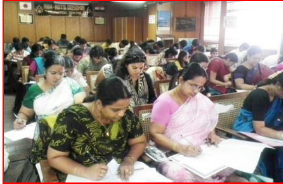
Section of the students taking the JLPT mock test