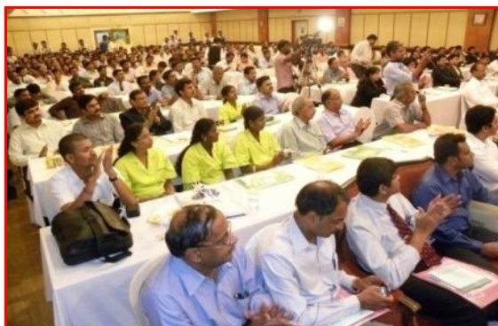
Section of delegates during the Seminar