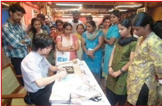
Demonstration of Kokuji Art being enjoyed by Visitors