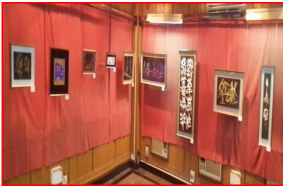
Section of exhibits during the Kokuji Art Exhibition