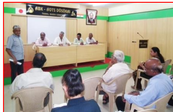
Section of the Annual General Body Meeting