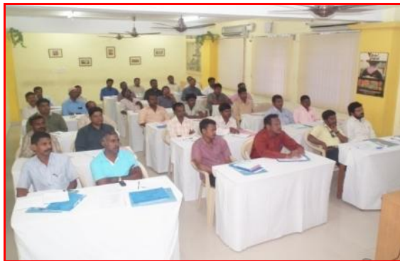
Participants of the Japanese Management Training Program