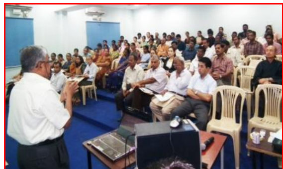
JLPT 2010 (December) – Proctors Meeting in Progress

The New Japanese Language Proficiency Test, (JLPT) will be held twice a year on the first Sunday of July & December Annually. Our centre has been identified for conducting the Japanese Language Proficiency Test for N1, N2 , N3, N4 & N5 for entire South India on 5 th December 2010.