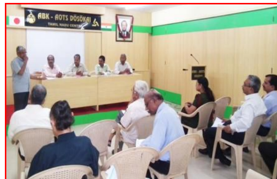
Section of the Annual General Body Meeting