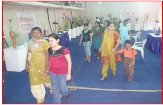
Section of the visitors thronging to view the exhibits in the Japan Pavilion at Dinamalar Smart Shoppers Expo 2010