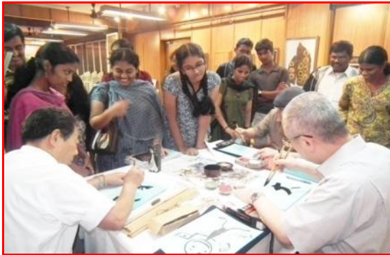
Demonstration of Kokuji Art being enjoyed by Visitors