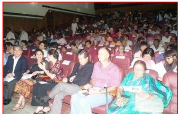
Visitors enjoying the Unit Asia – JAZZ Concert 2010