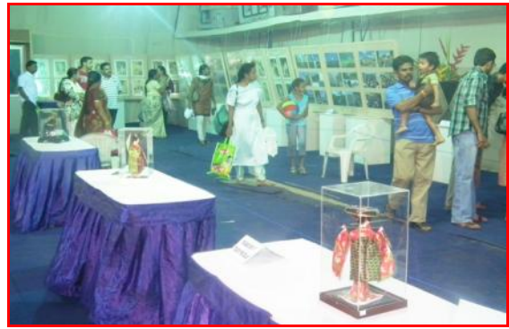
Section of the exhibits in the Japan Pavilion at Dinamalar Smart Shoppers Expo 2010

In association with Dinamalar, the organizers of the Smart Shoppers Expo - 2010 we have displayed Ikebana by Sogetsu Study Circle of Chennai alongwith the Japanese Dolls, Japanese Stamps & Japanese Woodblock prints ( Ukiyo-e) of our centre at the "Japan Pavillion" of the Smart Shoppers Expo-2010 at YMCA , Royapettah from 23 rd to 27 th December 2010.