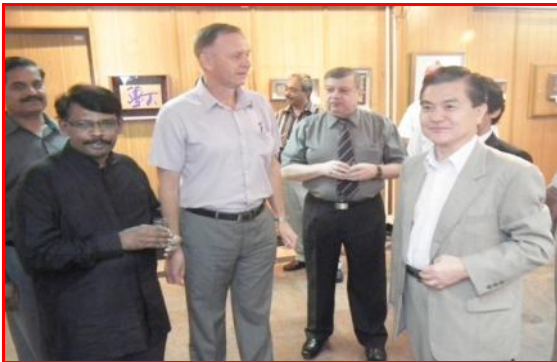
Dignitaries from various Consulates in Chennai gracing the occasion during the Reception Dinner hosted in honour of the Members of the Japan Kokuji Art Association ,Japan