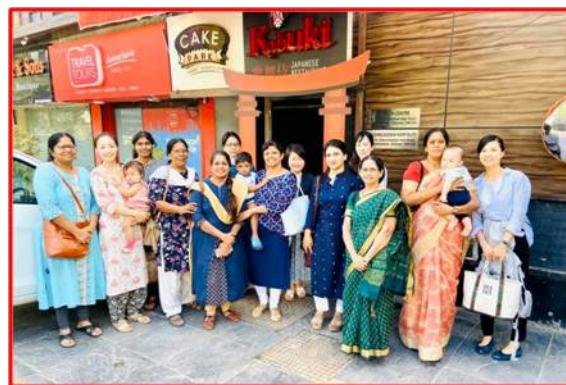
Coffee Meet in progress

This year of lots and lots of fun filled cultural exchange activities that were completely educational in terms of culture and the language comes to an end with Bounenkai.