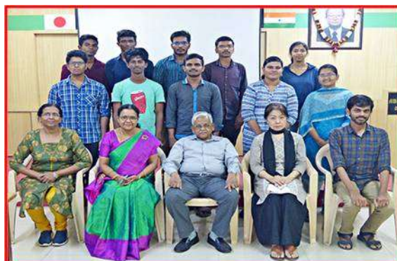
Group photo taken during Basic Business Japanese workshop