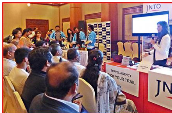
Chennai Japan Expo – product explaining session in progress

We are glad to inform that two more mail IDs of our centre are