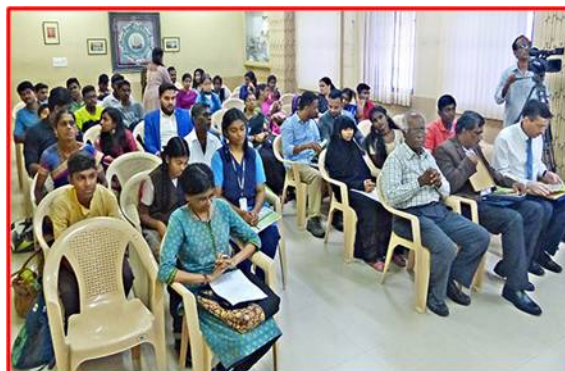
Session of audience during the Prize Awarding ceremony