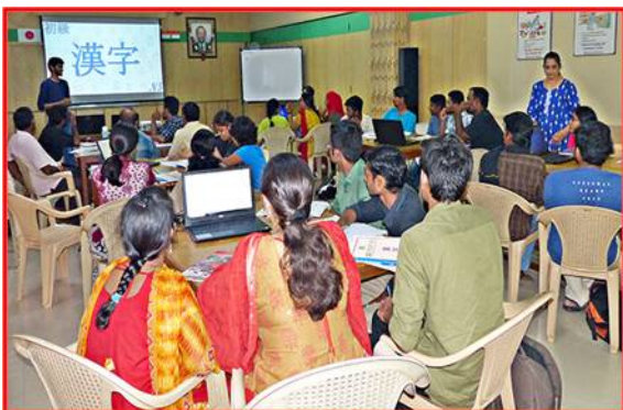
Kanji Workshop in progress

We conduct the kanji workshop again for N5 and N4 students all free for ABK AOTS Japanese School students. This workshop seemed very effective and had helped us improve our results last July. Kanji Workshop for N5 & N4 conducted on 10 th November 2019.