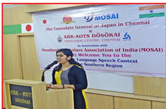
MOSAI – Japanese Language Speech Contest For Southern Region in Progress