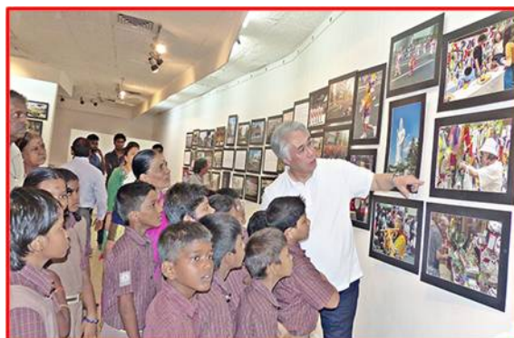
Exhibition on “Contemporary Wood – Curved Netsuke”- session of audience