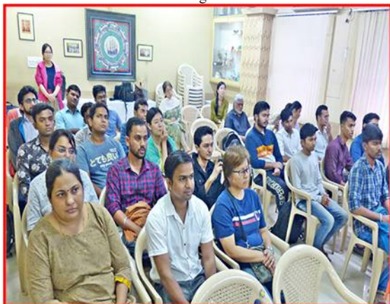
Section of audience