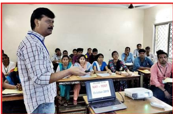
Japanese Language NAT TEST in progress

The Japanese Language NAT-TEST is an examination that measures the Japanese language ability of students who are not native Japanese speakers. The tests are separated by difficulty (five levels) and general ability is measured in three categories: Grammar /Vocabulary, Listening and Reading Comprehension. NAT Test is being held six times a year. ABK – AOTS DOSOKAI, Tamilnadu Centre in association with Senmon Kyouiku Publishing Pvt. Ltd Japan have been conducted the NAT TEST in Chennai. On 20 th October 2019 the NAT TEST was conducted for 1Q to 5Q.