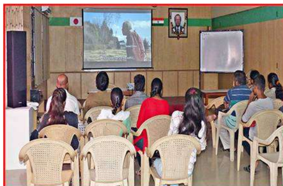
Screening Japanese NHK World Japan TV in Progress

on 10.11.2019 – "Symbol of Revival" screened on 17.11.2019 – "10 Years with Hayao Miyazaki" on 24.11.2019 – "Home Sweet Tokyo Season 2" on 15.12.2019 – Eiheiiji – Inside Dogen's Zen Monastery on 22.12.2019– Japan from Above – Land of Prayers