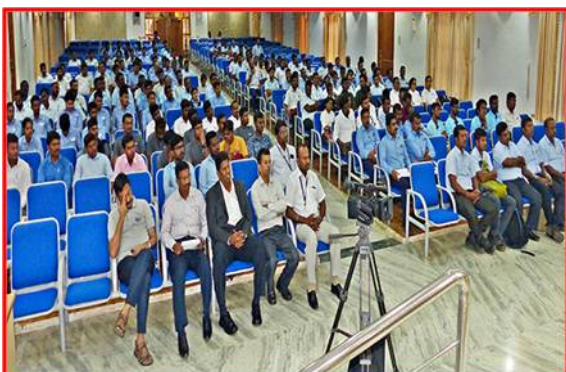
4 th Innovative QC Competition in progress section of participants