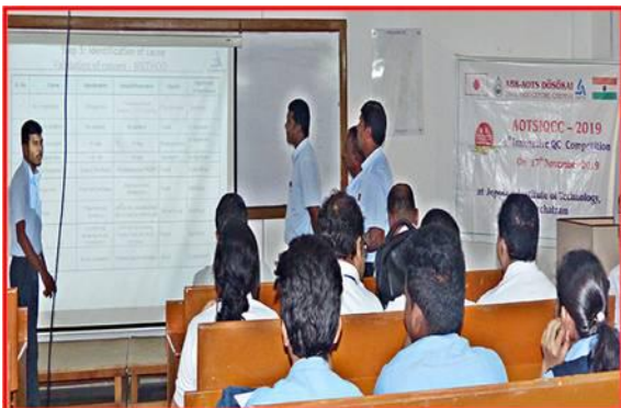
4 th Innovative QC Competition in progress