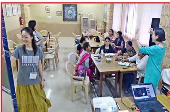
Coffee Meet in progress

Session on Japan 's Emperor Enthronement ceremony and the procedures followed