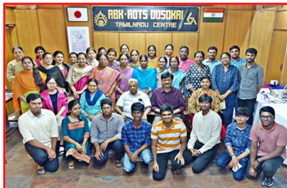
Group photo taken during the Japanese Language Teachers Meeting