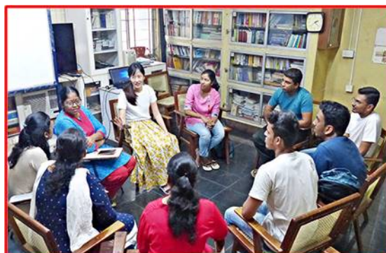
Speech Club Activity in progress

We conducted the Speech club activity for Students of our Japanese Language school at ABK – AOTS DOSOKAI, Tamilnadu Centre on 15 th & 29 th Oct 2019.