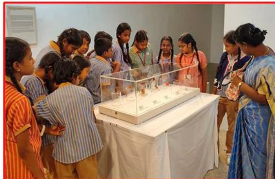
Exhibition on “Contemporary Wood – Curved Netsuke”- session of audience