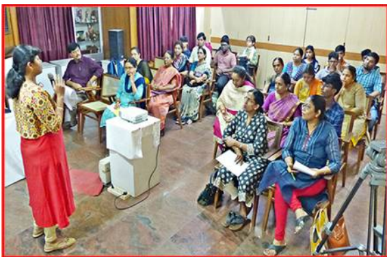
Japanese Language Teachers Meeting in Progress