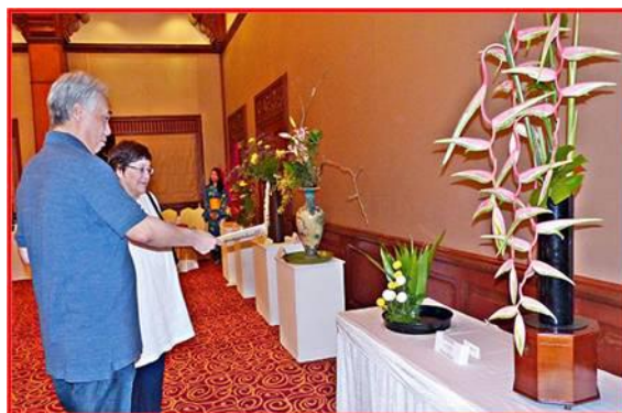
Chennai Japan Expo – section of audience