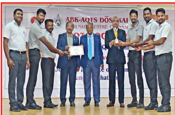
Photograph taken during the prize awarding ceremony of 4 th Innovative QC Competition