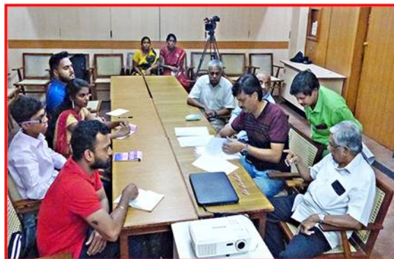
Pre departure meeting for the Talk Your Way to Japan – Speech Contest winners in Progress

We are proud to share that the 4 winners of Talk your way to Japan speech contest conducted by ABK AOTS DOSOKAI, Tamilnadu Centre Chennai in association with Hiyoshi Corporation travelled in the first direct flight!!