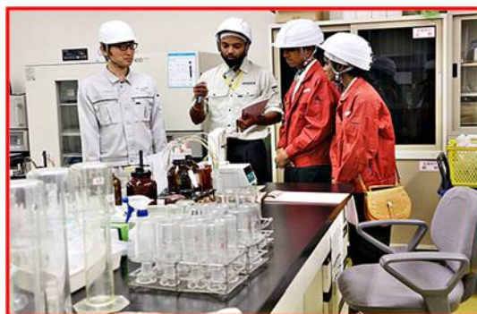
Talk your way to Japan – Speech Contest winners at Hiyoshi Corporation , Lab at Japan