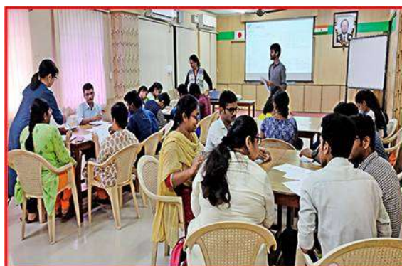
Basic Business Japanese workshop in Progress

Day 5 on 8 th November 2019:- Briefing about Translation and Interpretation with sample E-J and J-E Translation and live interpretation exposure. It was followed by cultural exposure session which gave a lot of insight to Japanese way of thinking.