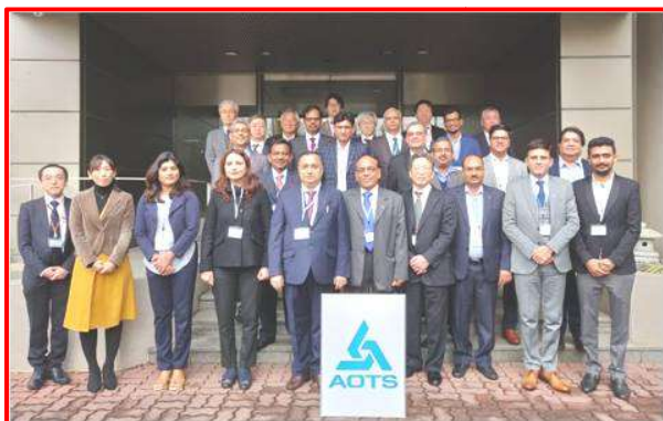
Group photo of The Training Program on the Establishment of Paper Recycling System in India

Seven delegates from various organisations were recommended by our centre to participate in the above program.