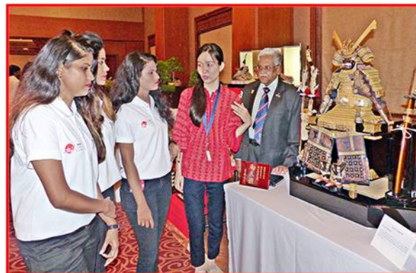
Chennai Japan Expo – section of audience