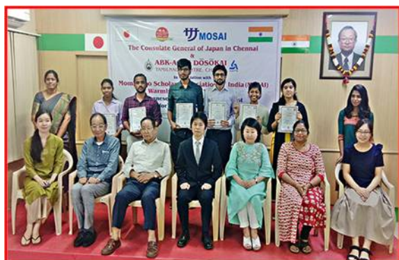
Group photo taken during the MOSAI – Japanese Language Speech Contest For Southern Region