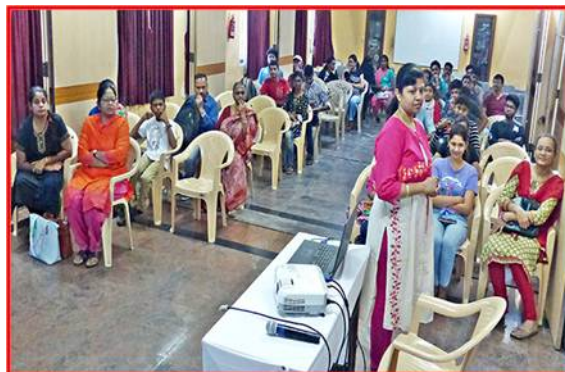
Photograph taken during the Japanese language orientation

Orientation for the new batch of N5,N4,N3 Students was held on 8 th December 2019. Details regarding the History of our school, our infrastructure, facilities, class room activities, extracurricular club activities, success stories were shared with the students.