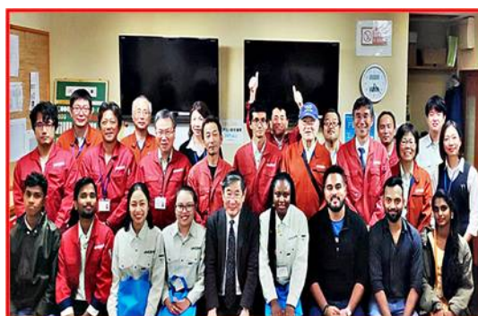
Group photo taken with Talk Your way to Japan – Speech contest winners and Hiyoshi Corporation members

First ANA direct flight from Chennai to Tokyo departed Chennai on 27 th October 2019.