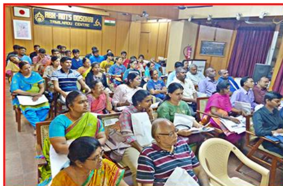
JLPT Proctors Meeting in progress

The Japanese Language Proficiency Test, (JLPT) is being held twice a year on the first Sunday of July & December Annually. Our centre has been identified by the Japan Foundation through the Consulate General of Japan in Chennai for conducting the Japanese Language Proficiency Test for N1 ~ N5 for entire South India on 1 st December 2019 at Vellammal Matriculation Hr. Sec.School, T. S. Krishnanagar, Chennai.