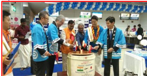
First ANA direct flight from Chennai to Tokyo departed Chennai on 27 th October 2019.