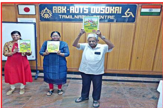
Release of new version of N5 Kana Workbook and N5 & N4 Kanji Books