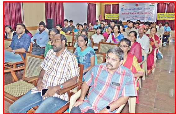
Section of audience of Talk Your Way to Japan – English Speech contest