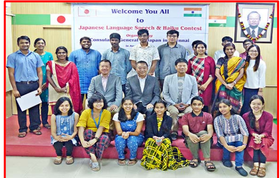
Winners of Japanese Language Speech & Haiku Contest, organized by The Consulate General of Japan in Chennai