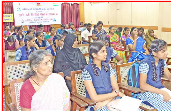
Section of audience of Talk Your Way to Japan – Tamil Speech contest