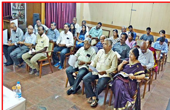
Annual General Body Meeting in progress