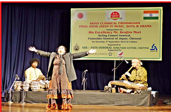
Asian Classical Crossroads - India Joins Japan In Music, Song & Drama in progress