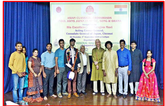
Group photo taken during Asian Classical Crossroads - India Joins Japan In Music