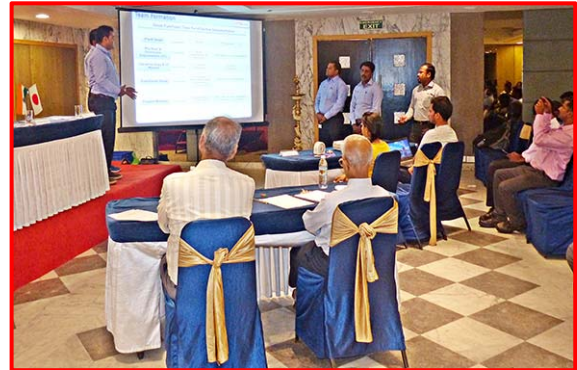
4 th Quality Improvement team Annual Competition in progress