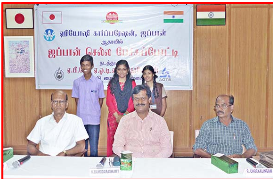
Winners of Tamil Speech Contest