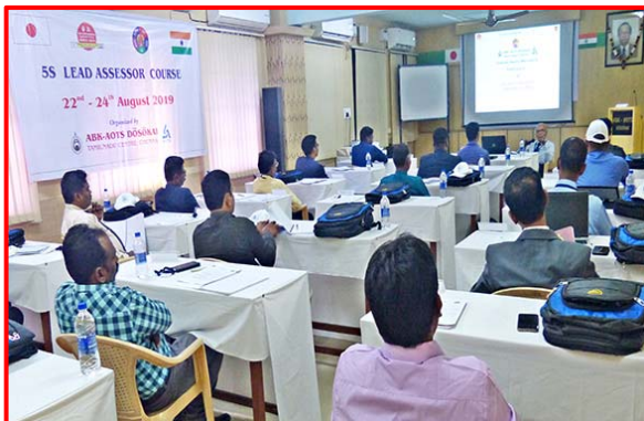
Photograph taken during the 5S Lead Assessor Course at our centre