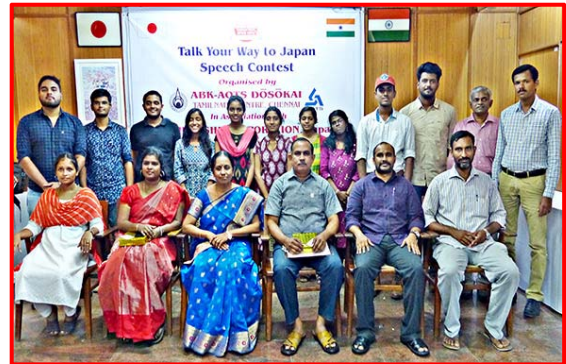
Preliminary Round Winners of English Speech Contest