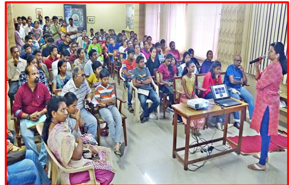
Photograph taken during the Japanese language orientation