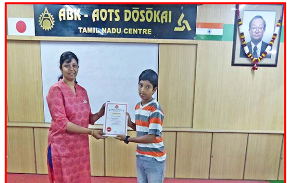
Photograph taken during handing over the course completion certificate in the Japanese language orientation

Orientation for the new batch of N5, N4, N3 Students was held on 14 th July 2019. Details regarding the History of our school, our infrastructure, facilities, class room activities, extracurricular club activities, success stories were shared with the students.