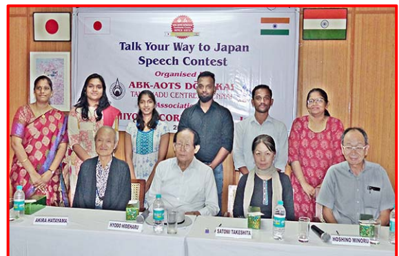
Winners of Japanese Language Speech Contest