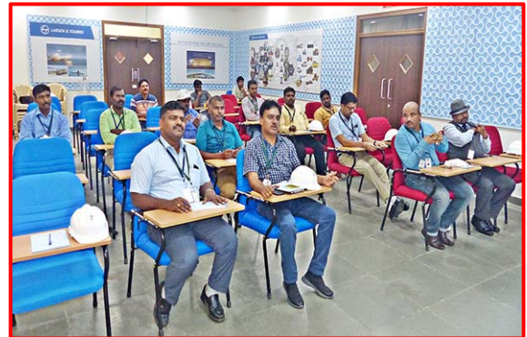
Photograph taken during the 5S Lead Assessor Course – factory visit

The training program will provide both technical knowledge and practical skills essential to become a competent LEAD ASSESSOR OF 5S PRACTICE by carrying out live audits in a few companies. 20 participants from 12 companies are participants in this program