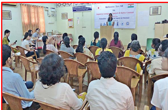
Japanese Language Speech & Haiku Contest in progress