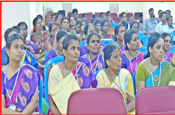
Japanese Language Proficiency Test – proctors meeting in progress