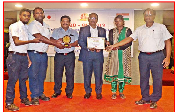
Photograph taken during the prize awarding ceremony of 4 th Quality Improvement team Annual Competition