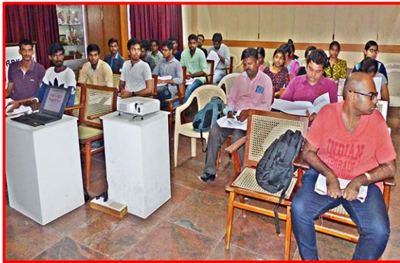
NAT TEST – Proctors Meeting at our centre

ABK – AOTS DOSOKAI, Tamilnadu Centre in association with Senmon Kyouiku Publishing Pvt. Ltd Japan have been conducted the NAT TEST in Chennai. On 25 th August 2019 the NAT TEST was conducted for 2Q to 5Q.