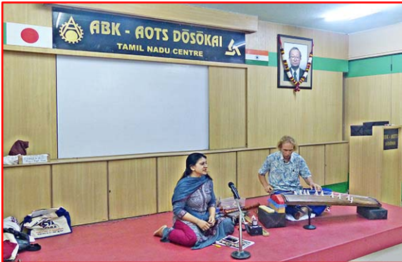
Asian Classical Crossroads - India Joins Japan In Music, Song & Drama in progress