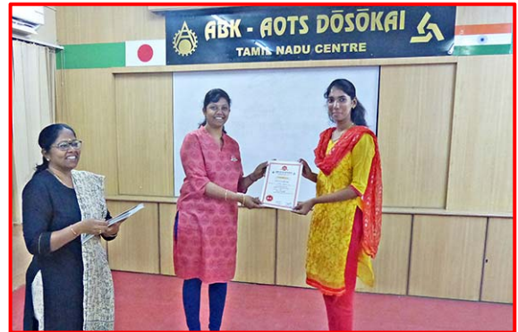
Photograph taken during handing over the course completion certificate in the Japanese language orientation