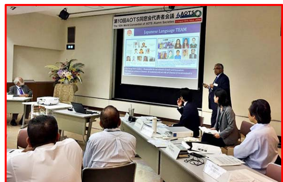
Photograph taken during the 60 th AOTS Anniversary events and the 10 th World Convention of AOTS Alumni Societies.