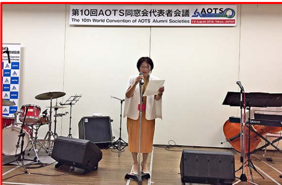
Photograph taken during the 60 th AOTS Anniversary events and the 10 th World Convention of AOTS Alumni Societies.