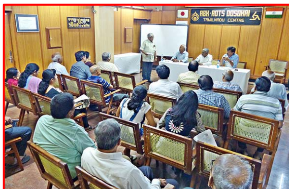
Annual General Body Meeting in progress