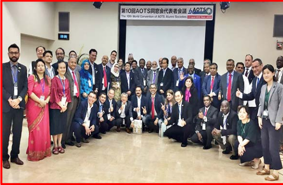
Photograph taken during the 60 th AOTS Anniversary events and the 10 th World Convention of AOTS Alumni Societies.