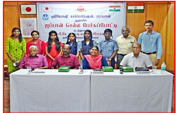
Winners of Tamil Speech Contest