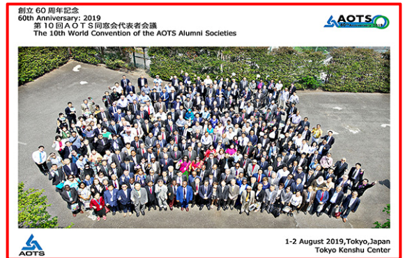
Photograph taken during the 60 th AOTS Anniversary events and the 10 th World Convention of AOTS Alumni Societies.