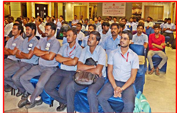
4 th Quality Improvement team Annual Competition section of participants