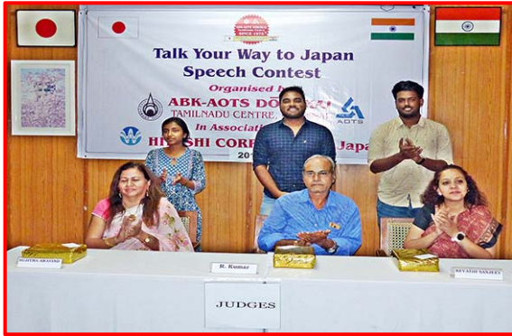
Winners of English Speech Contest