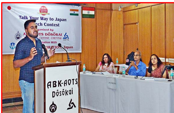
Talk Your Way to Japan – English Speech Contest in Progress