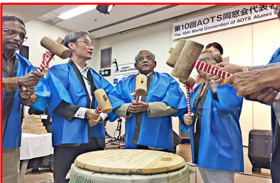
Photograph taken during the 60 th AOTS Anniversary events and the 10 th World Convention of AOTS Alumni Societies.