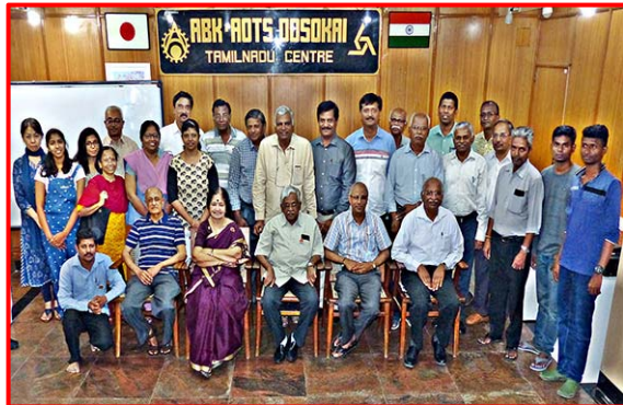
Group Photo of Annual General Body Meeting held on 29 September 2019 at our centre