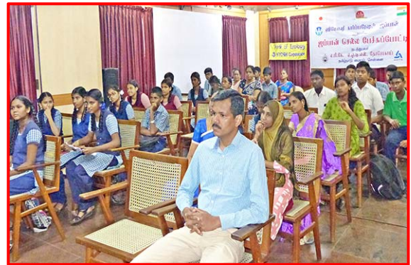
Section of audience of Talk Your Way to Japan – Tamil Speech contest