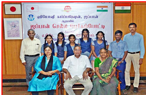
Preliminary Round Winners of Tamil Speech Contest