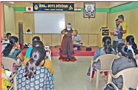
Asian Classical Crossroads - India Joins Japan In Music, Song & Drama in progress