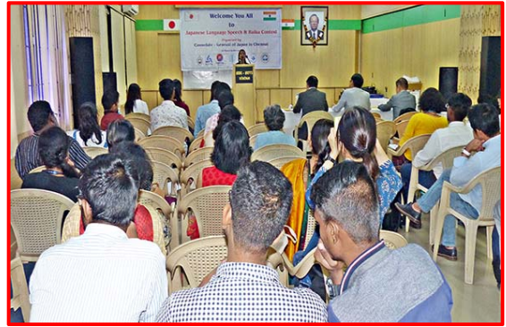
Japanese Language Speech & Haiku Contest in progress