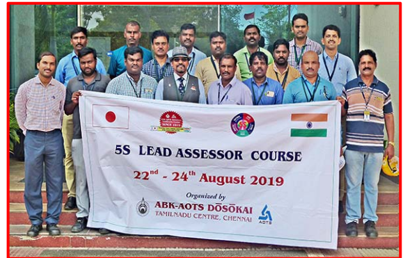
Photograph taken during the 5S Lead Assessor Course – factory visit