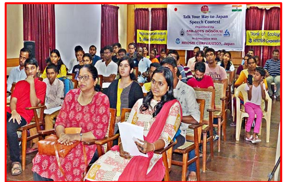
Section of audience of Talk Your Way to Japan – Japanese Speech contest