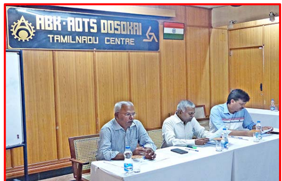
Annual General Body Meeting in progress