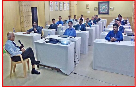
Photograph taken during the 5S Lead Assessor Course at our centre