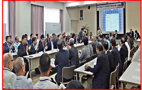
Photograph taken during the 60 th AOTS Anniversary events and the 10 th World Convention of AOTS Alumni Societies.