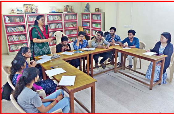
Photo taken during the Reading Club activity conducted at ABK AOTS DOSOKAI, Tamilnadu Centre on 24.09.2019