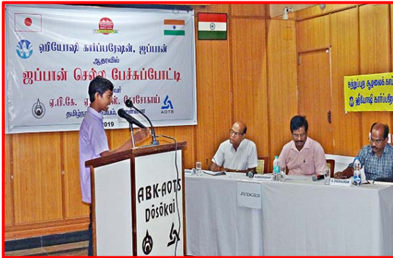
Talk Your Way to Japan – Tamil Speech Contest in Progress