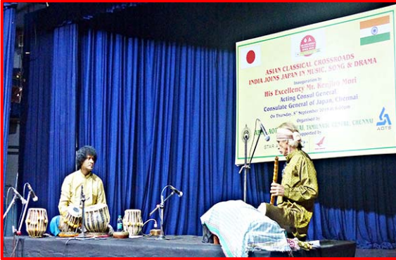
Asian Classical Crossroads - India Joins Japan In Music, Song & Drama in progress