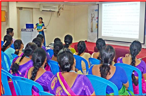
Japanese Language Proficiency Test – proctors meeting in progress