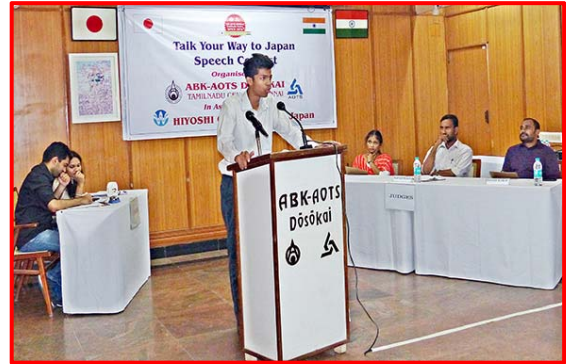
Talk Your Way to Japan – English Speech Contest in Progress