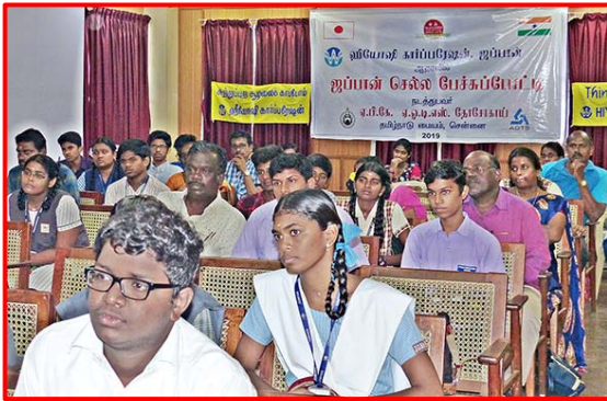
Section of audience of Talk Your Way to Japan – Tamil Speech contest