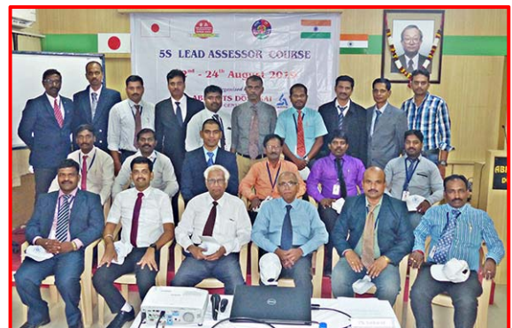
Group Photo taken during the 5S Lead Assessor Course