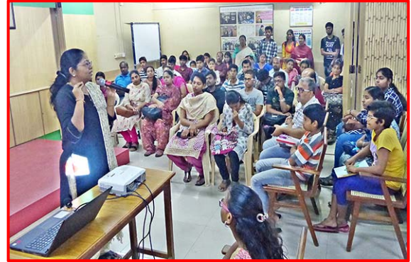
Photograph taken during the Japanese language orientation

The Japanese Language Proficiency Test, (JLPT) is being held twice a year on the first Sunday of July & December Annually. Our centre has been identified by the Japan Foundation through the Consulate General of Japan in Chennai for conducting the Japanese Language Proficiency Test for N1 ~ N5 for entire South India on 5 July 2019 at Vellammal Matriculation Hr. Sec.School, T. S. Krishnanagar, Chennai.