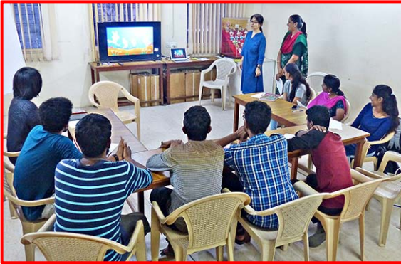
Photo taken during the Reading Club activity conducted at ABK AOTS DOSOKAI, Tamilnadu Centre on 24.09.2019