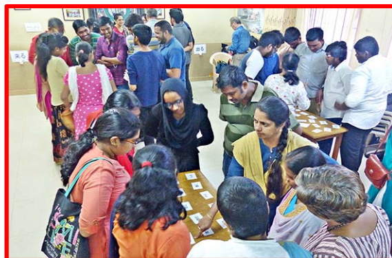
Waku waku club activity in progress