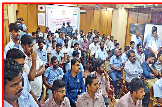
4 th Competition for The Maintenance Personnel in progress