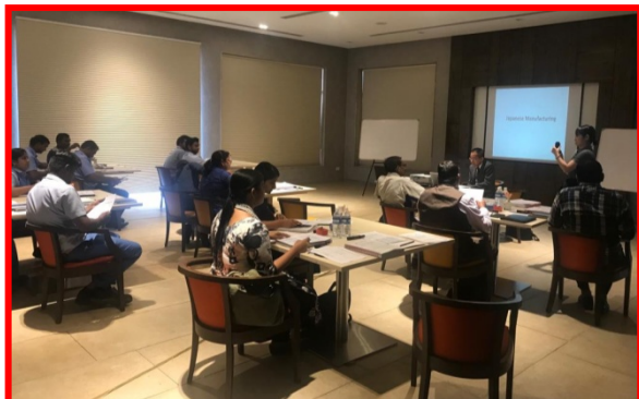
Train the Trainers program in progress

AOTS – Japan conducted the Training Program on Train the Trainers at Japan India Institute for Manufacturing, Sri City Tada, from 24 th to 28 th June 2019