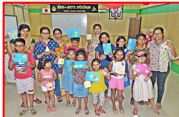
Origami camp in progress