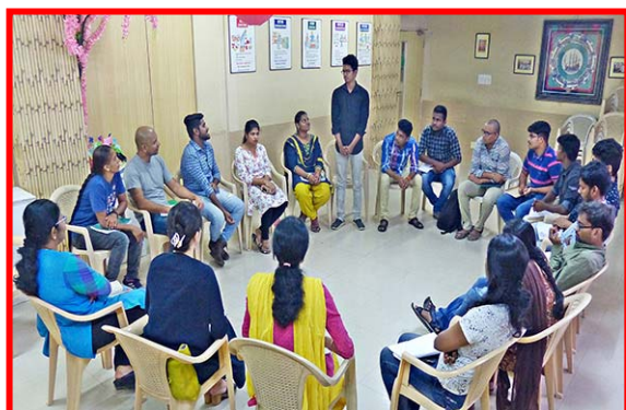
Speech Club activity in progress