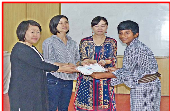
Feel Japan in Chennai – Summer Camp 2 in progress