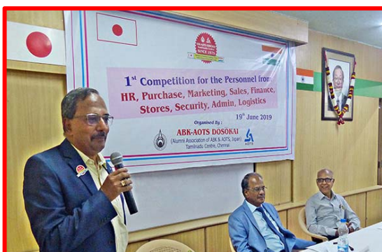
1 st Competition for the Personnel from Non - Manufacturing Departments in Progress