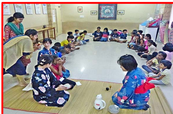
Feel Japan in Chennai – Summer Camp 2 in progress