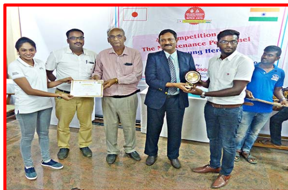
4 th Competition for The Maintenance Personnel in progress