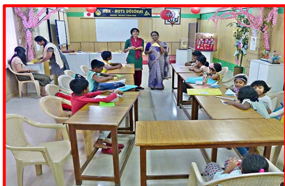
Origami camp in progress