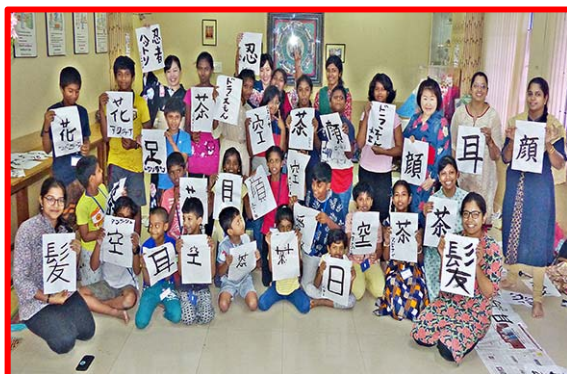
Feel Japan in Chennai – Summer Camp 2 in progress