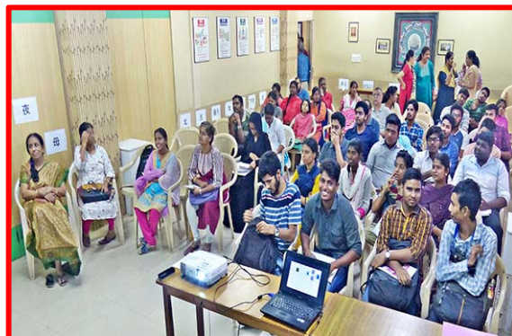
Waku waku club activity in progress

We successfully finished N5 Kanji workshop brushing up all the N5 kanjis and playing interesting games to remember them forever! There was enormous response from the Students who had so much fun and gave a feedback that it was very effective ! Thanks to all of our Japan Foundation trained teachers who volunteering helped to make this fun filled learning event a grand success! We will starting N4 Kanji workshop from June 2019.