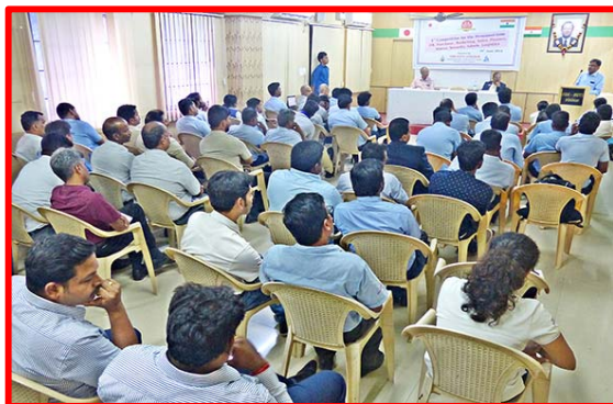
1 st Competition for the Personnel from Non - Manufacturing Departments in Progress