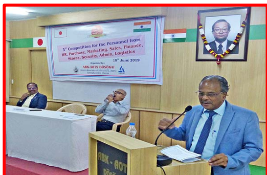
1 st Competition for the Personnel from Non - Manufacturing Departments in Progress