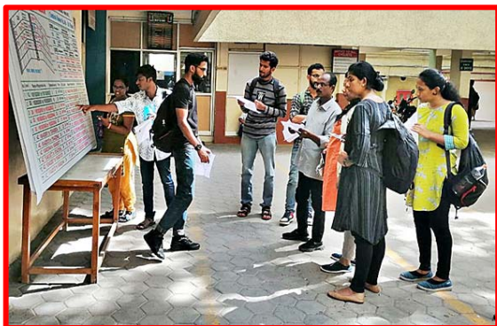
NAT TEST in Progress