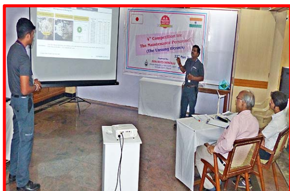
4 th Competition for The Maintenance Personnel in progress