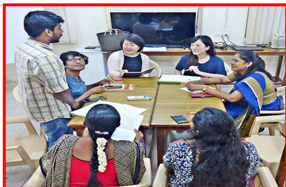
Speech Club activity in progress