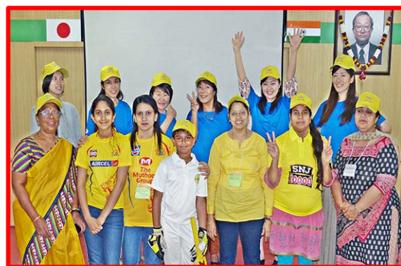
Coffee Meet activity in Progress

IPL cricket match and the craze for it impressed the Japanese ladies who come for coffee meet and created a thirst to know what is CRICKET... we took it seriously and made an attempt to explain them what cricket is, how it's played, what is World Cup, which countries participate in it, rules of cricket and showed them the cricket kit and demonstrated how to play. Finally, we also had a small match between Indians and Japanese ... It was a pride for us to explain about our legendary Indian players and how we breathe cricket in this season. Lots of learning combined with tonnes of enjoyment!!