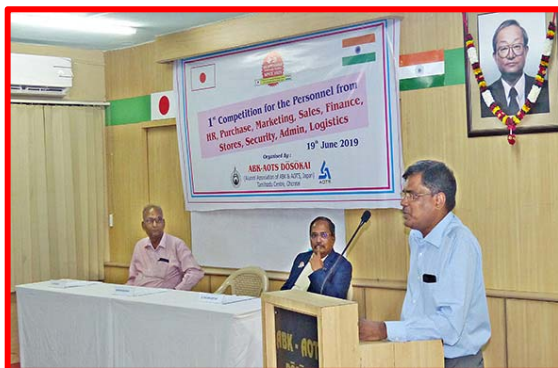
1 st Competition for the Personnel from Non - Manufacturing Departments in Progress