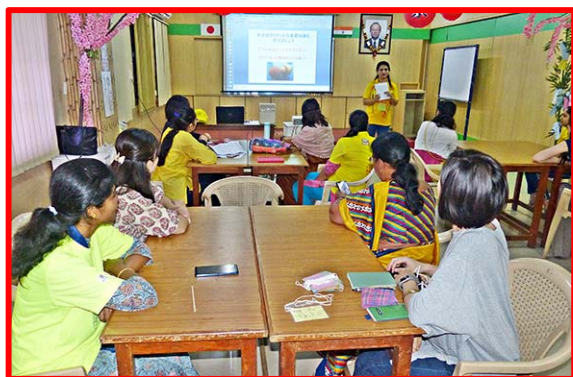
Coffee Meet activity in Progress

On 5 th June 2019 - The Japanese Sport on the theme Sumo & Yakyuu was conducted at our centre.