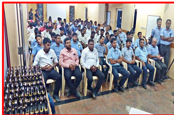
4 th Competition for The Maintenance Personnel in progress