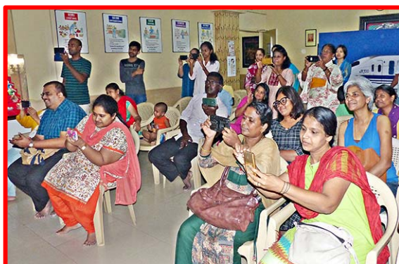
Feel Japan in Chennai – Summer Camp 2 in progress