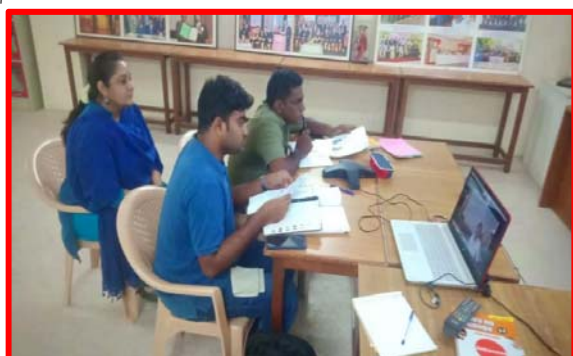
Trail online Japanese Lesson in progress