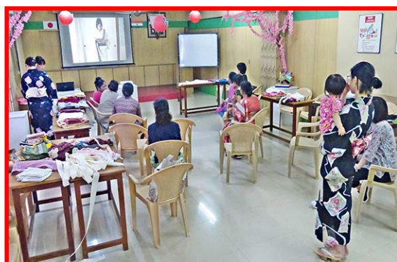
Coffee Meet activity in Progress