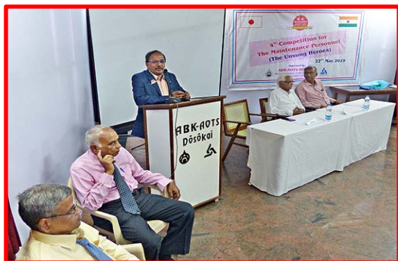
4 th Competition for The Maintenance Personnel in progress