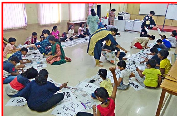
Feel Japan in Chennai – Summer Camp 2 in progress