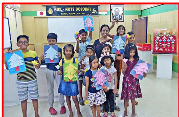
Origami camp in progress