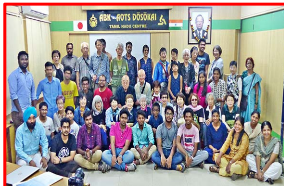
Japanese visitors from World Air – Sea Service Co., Ltd, Japan visited our centre