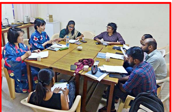
Speech Club activity in progress