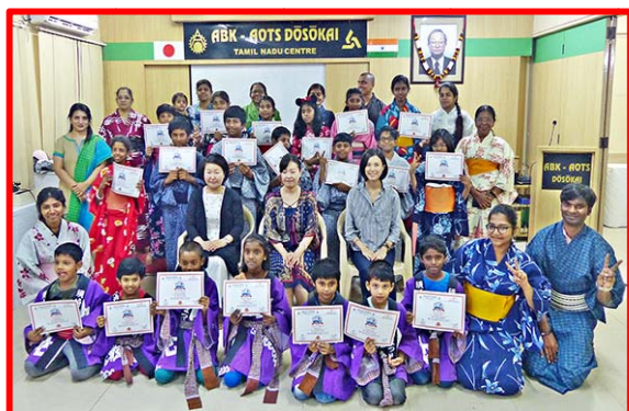
Feel Japan in Chennai – Summer Camp 2 in progress