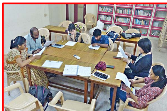
Reading Club activity in progress

The reading club is formed to train the students to read the Japanese books, comics, newspaper to know more about Japan and improve their reading skills was held on 16 th May 2019