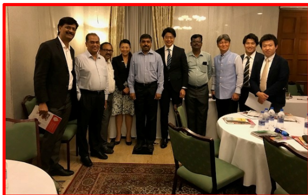
Group photo taken during the Japan Tourism Seminar" organized by Consulate General of Japan in Chennai and Japan National Tourism Organization