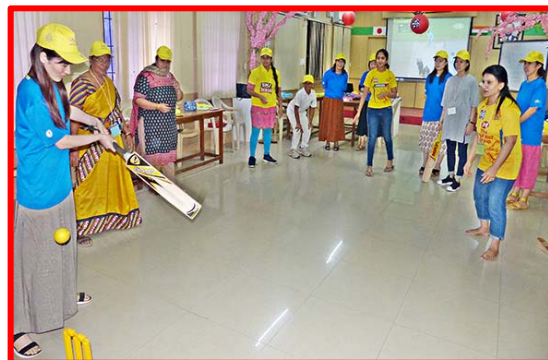
Coffee Meet activity in Progress