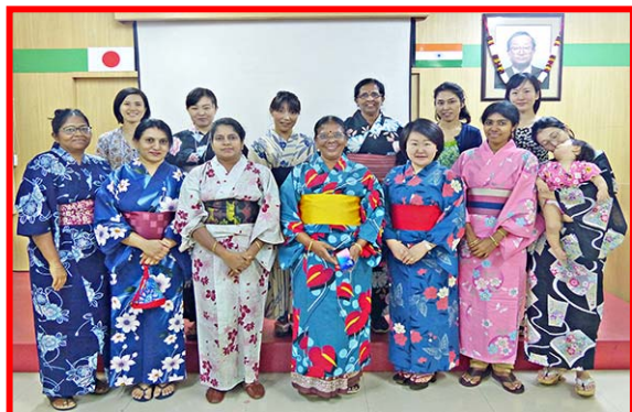
Coffee Meet activity in Progress