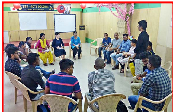
Speech Club activity in progress