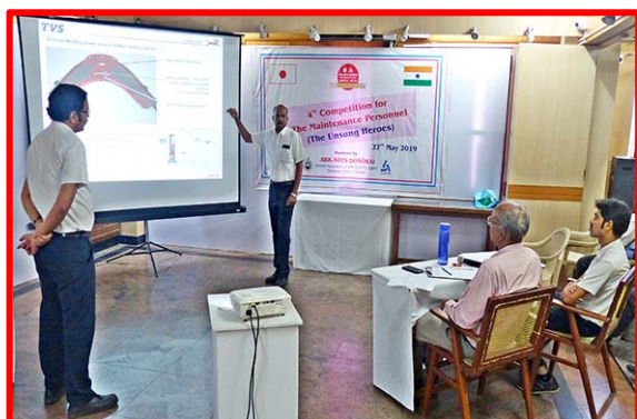
4 th Competition for The Maintenance Personnel in progress