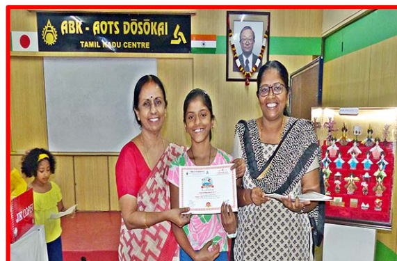
Origami camp in progress