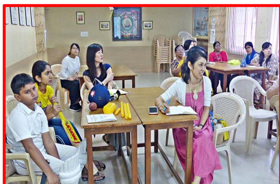
Coffee Meet activity in Progress