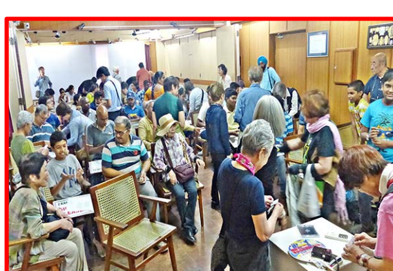
Japanese visitors from World Air – Sea Service Co., Ltd, Japan visited our centre