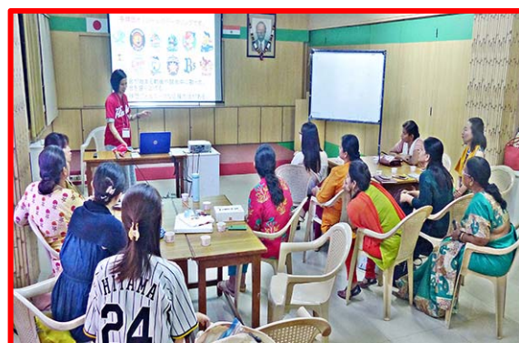
Coffee Meet activity in Progress