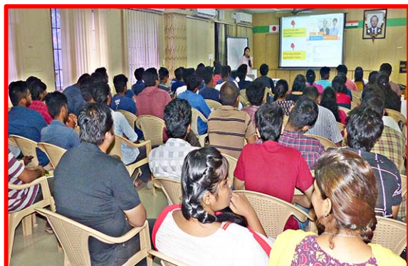
Information Session about the Japan Government's Internship Program -2019 in Progress