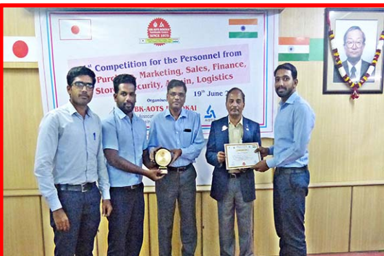
1 st Competition for the Personnel from Non - Manufacturing Departments in Progress