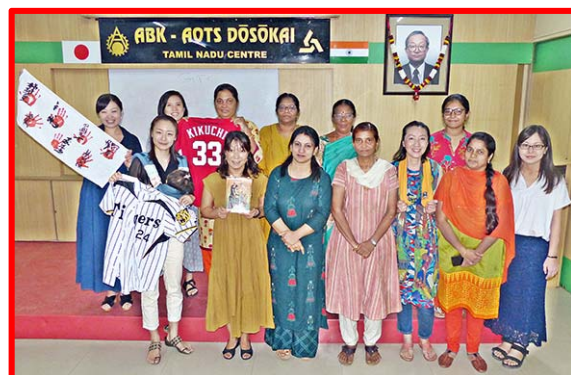
Coffee Meet activity in Progress