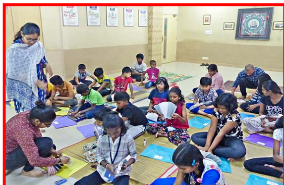
Feel Japan in Chennai – Summer Camp 2 in progress