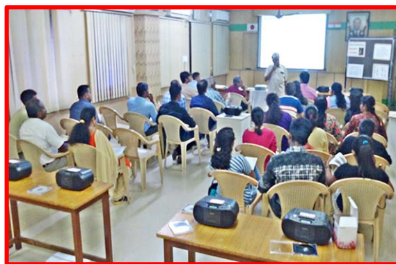
NAT TEST – Proctors Meeting in Progress

ABK – AOTS DOSOKAI, Tamilnadu Centre in association with Senmon Kyouiku Publishing Pvt. Ltd Japan conducted the NAT TEST in Chennai. On 16 th June 2019 the NAT TEST was conducted for 1Q to 5Q.