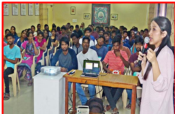
Information Session about the Japan Government's Internship Program -2019 in Progress