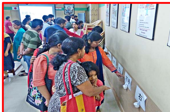
Waku waku club activity in progress