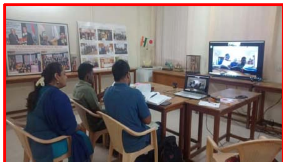
Trail online Japanese Lesson in progress