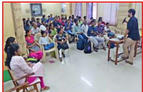
Waku Waku Club activity in progress