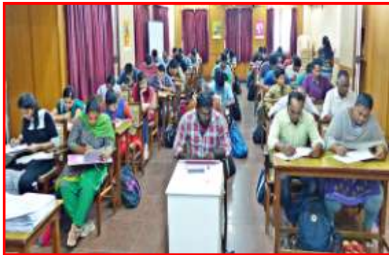
JLPT Mock Test in Progress

Conducted the Mock test of JLPT N5, N4 & N3 for our Japanese Language School students on 11 th , 18 th & 25 th November 2018