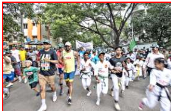
Section of participants of Mini Marathon

The caps were sponsored by Hiyoshi Corporation, Japan and Hiyoshi India Ecological Services Private Limited, Chennai & water bottles sponsored by JISD Academy Pvt. Ltd, Chennai