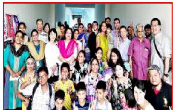
Group photo taken during the inaugural ceremony of Navalur Franchise