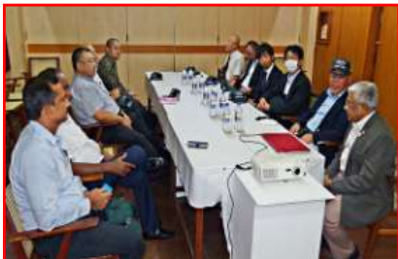
Hamamatsu Steel Manufacturers Association, Japan visited our centre