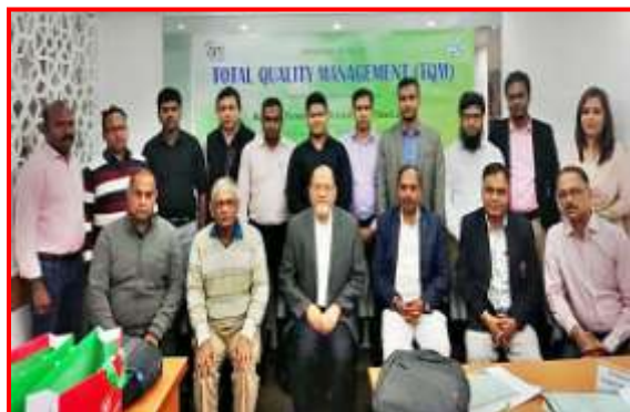
Group photo taken during the International Training on TQM