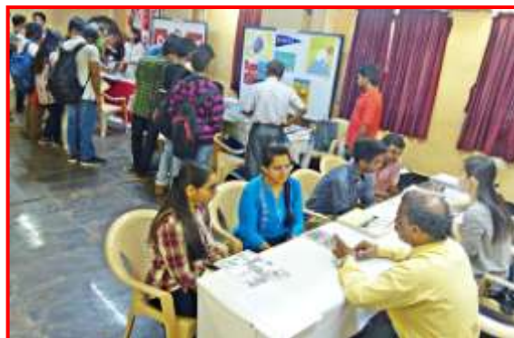
Japan Higher Education Fair in progress