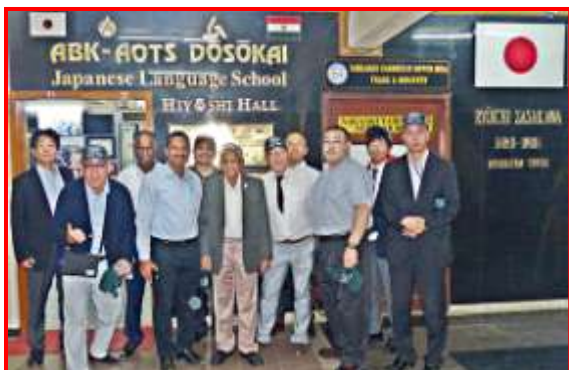
Group Photo taken during Hamamatsu Steel Manufacturers Association, Japan visited our centre