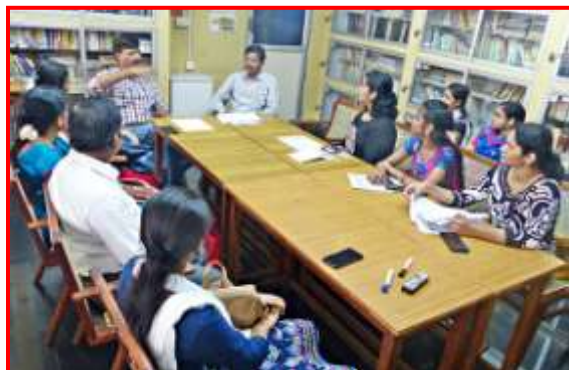
Pre Departure Meeting for the Four First Prize Winners of "Talk Your Way to Japan" Speech Contest" in progress