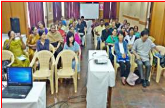
Japanese Language Teachers Meeting in progress