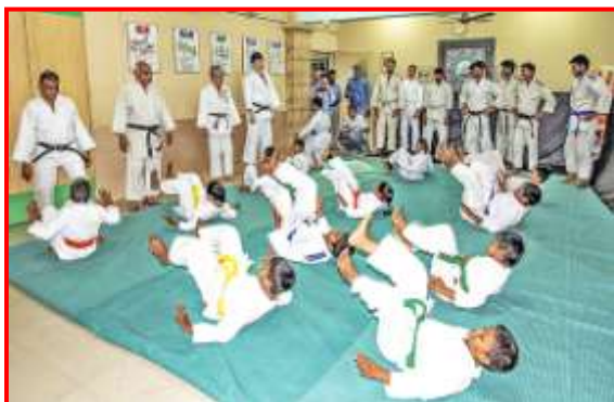
Judo Demonstration in progress