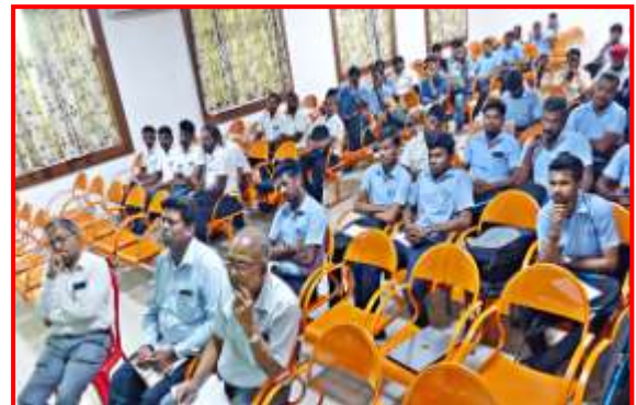
3 rd Innovative QC Competition in Progress