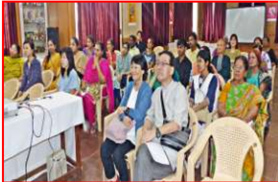
Japanese Language Teachers Meeting in progress