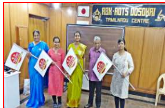
Photograph taken during the Release of ABK flag