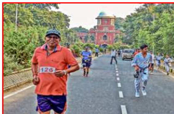
Section of participants of Mini Marathon