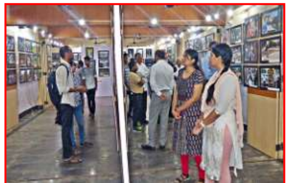
Photo Exhibition – section of audience