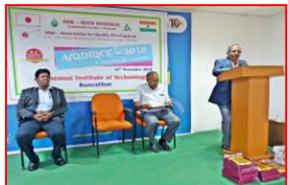
3 rd Innovative QC Competition in Progress