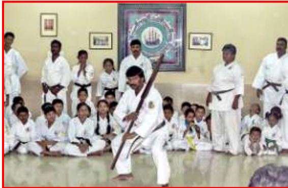
Kobudo demonstration in progress

Yukata (Japanese Traditional Dress) trial and screening of Japanese Video topics was held from 2:30 p.m. to 5:30 p.m. and