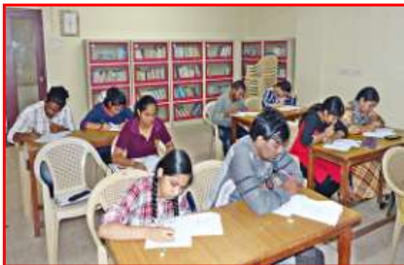
JLPT Mock Test in Progress