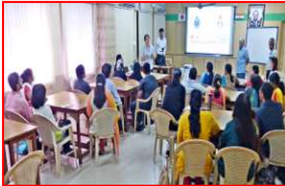
Japanese Language Teachers Training Program in Progress