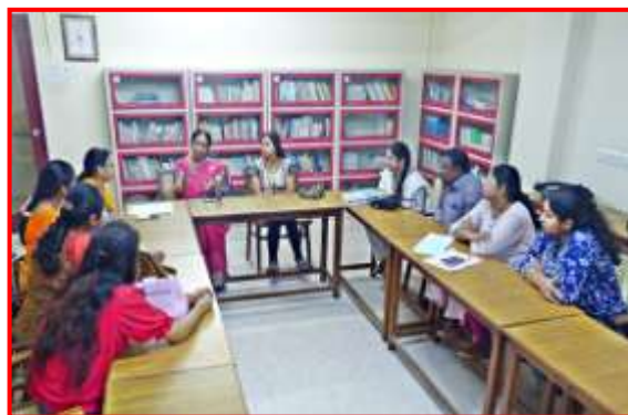
Esophageal Speech Workshop

The Esophageal Speech Workshop was conducted successfully by CRRT (Cancer Research & Relief Trust) in collaboration with AFLA (Asian Federation of Laryngectomees Association ) at Asha Nivas Centre, Nungambakkam from 3 rd to 7 th December 2018. Our teachers assisted the Japanese speech therapists and the participants in interpretation , during the workshop.