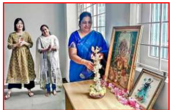
Lighting of kuthuvilakku during the inaugural ceremony of Navalur Franchise

On December 9th, 2018, the 11 th franchise of ABK AOTS DOSOKAI Tamilnadu Centre was opened at Navalur in OMR to serve the IT and huge residential community in OMR on the southern side as we have one center at Thiruvanniyur, start of OMR on the northern end of OMR.