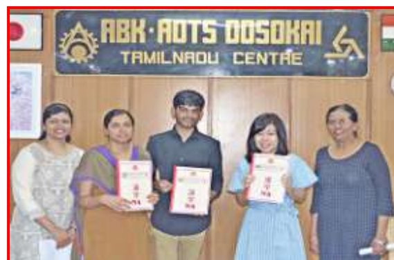
Photograph taken during the Release of N5 & N4 Kanji Book

Our teachers were honored with an appreciation letter, badge and bags. Group photo was taken at the end of the meeting.