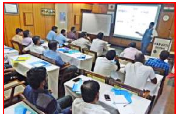
Japanese Management Training Program in progress

Training Program on Japanese Management Techniques