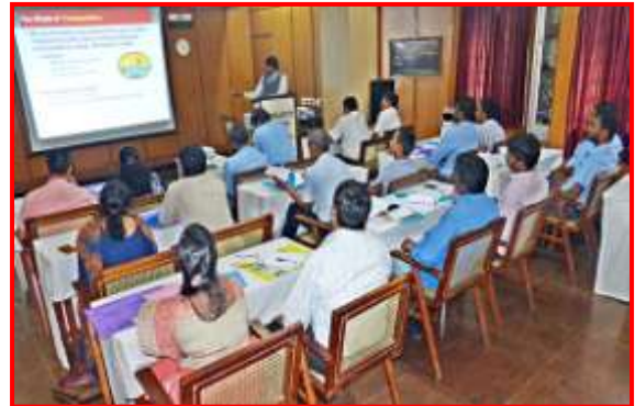
Japanese Management Training Program in progress

Training Program on ONE DAY TRAINING PROGRAM ON 7 STEPS to improve the OVERALL OFFICE EFFICIENCY held on 13 th October 2018 at our centre, 18 participants from 7 companies participated in the training program.