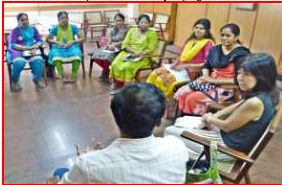
Speech Club activity in progress