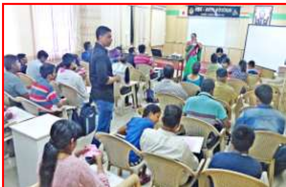
Origami demonstration during the Waku Waku Club activity in progress