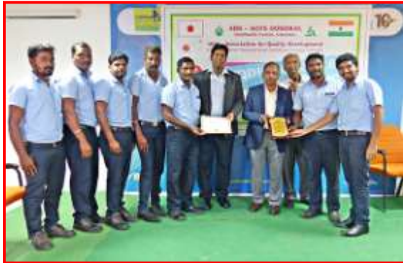
3 rd Innovative QC Competition in Progress