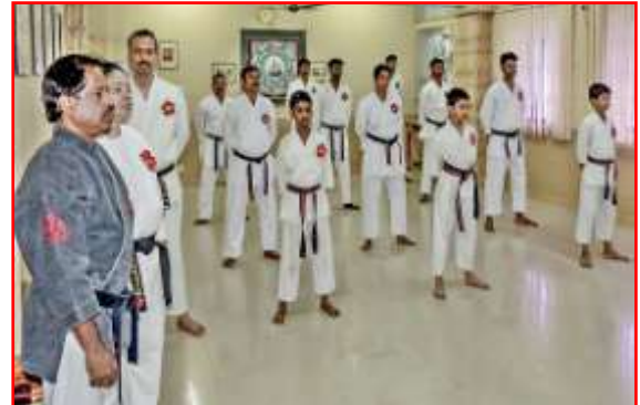
Karate Demonstration in progress