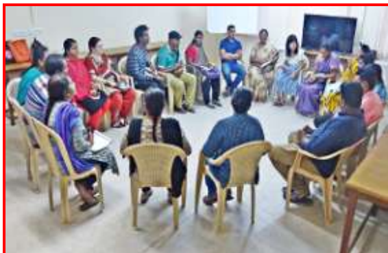
Speech Club activity in progress