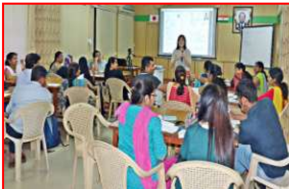
Japanese Language Teachers Training Program in Progress