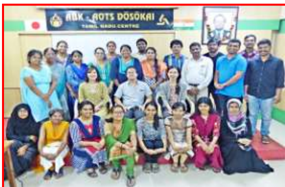
Group Photo taken during Japanese Language Teachers Training Program