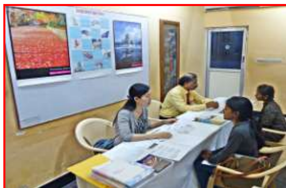
Japan Higher Education Fair in progress