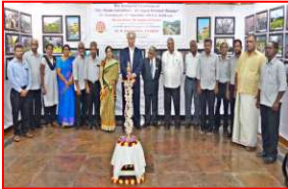
Group photo taken during the photo exhibition