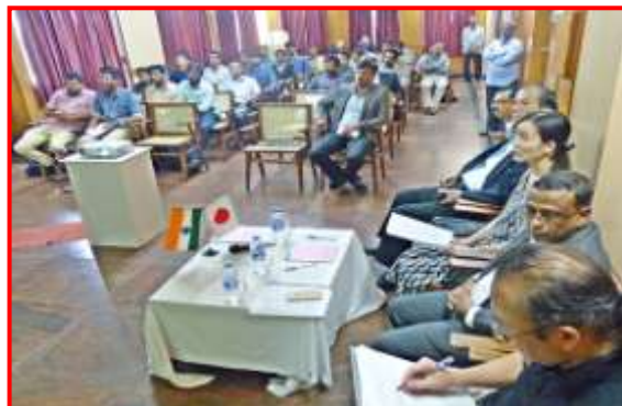
Japan Higher Education Fair section of participants