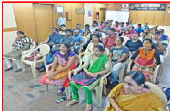
Photographs taken during the Japanese language orientation