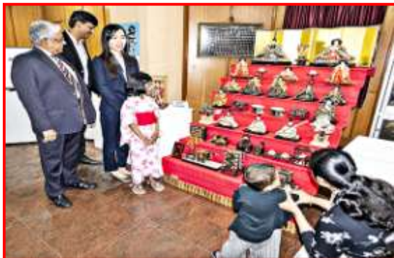
Section of the audience during the Japan Cultural Festival