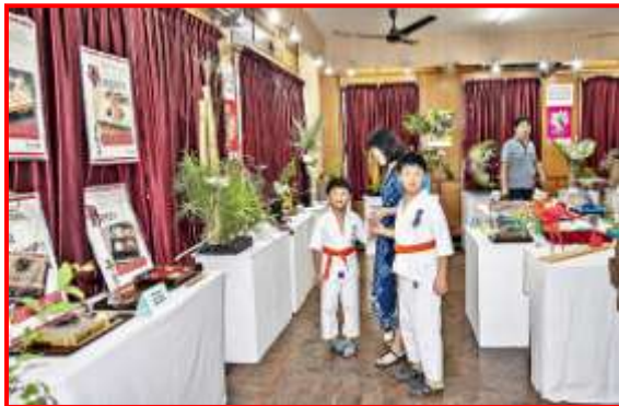
Section of the audience during the Japan Cultural Festival