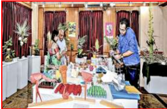
Section of the audience during the Japan Cultural Festival