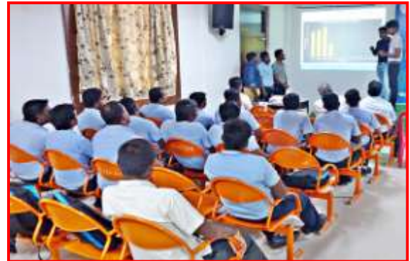
3 rd Innovative QC Competition in Progress

ABK - AOTS DOSOKAI, Tamilnadu Centre - Association for Quality Development - AfQD organized 3 rd AfQDIQCC (3 rd Innovative Quality Competition) on 18 th November 2018 at Chennai Institute of Technology (CIT), Chennai . Totally 14 teams from 9 companies presented their QC success stories.