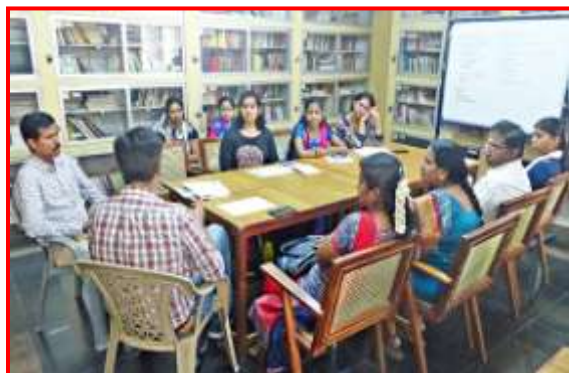
Pre Departure Meeting for the Four First Prize Winners of "Talk Your Way to Japan" Speech Contest" in progress