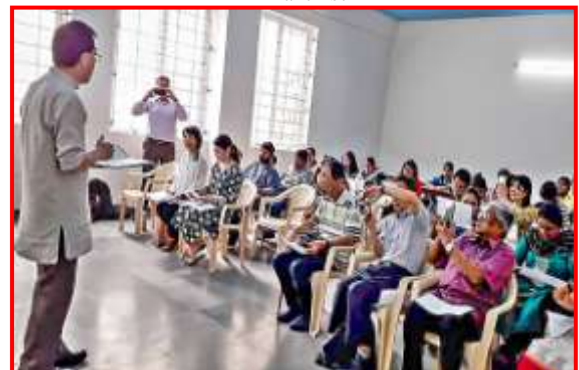
Inaugural ceremony of Navalur Franchise in progress