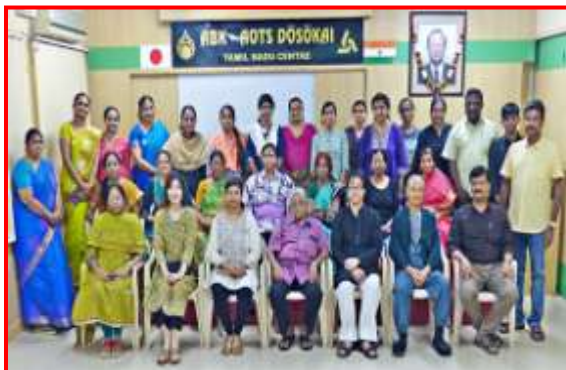
Group photo taken during the Japanese Language Teachers Meeting