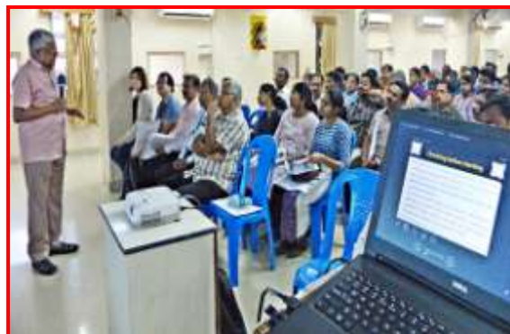
Japanese Language Proficiency Test – proctors meeting in progress