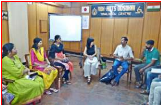
Speech Club activity in progress

The Speech Club formed to train the students to participate in the Japanese Language Speech Contest and Speak Japanese fluently meeting was held on 10 th , 14 th , & 24 th october 2018, 14 November 2018