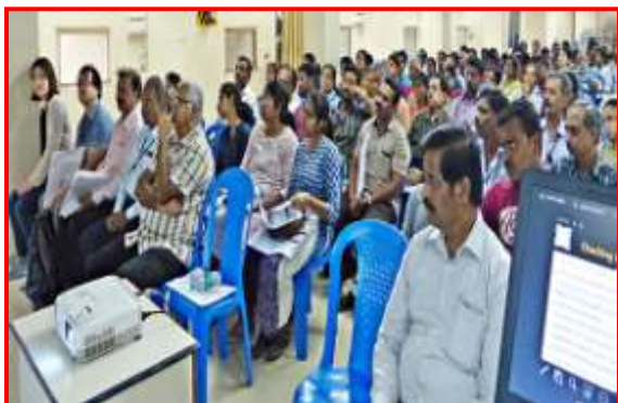
Japanese Language Proficiency Test – proctors meeting in progress

The Japanese Language Proficiency Test, (JLPT) is being held twice a year on the first Sunday of July & December Annually. Our centre has been identified by the Japan Foundation through the Consulate General of Japan in Chennai for conducting the Japanese Language Proficiency Test for N1 ~ N5 for entire South India on 2 nd December 2018 at Vellammal Matriculation Hr. Sec.School, T. S. Krishnanagar, Chennai.