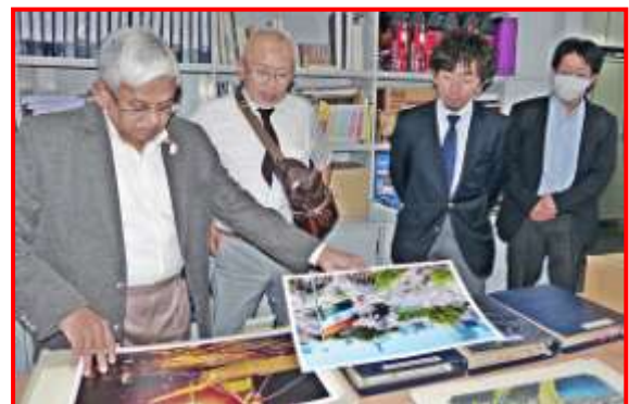
Hamamatsu Steel Manufacturers Association, Japan visited our centre

A team of Japanese delegates from Hamamatsu Steel Manufacturers Association visited our centre on 30 th November 2018