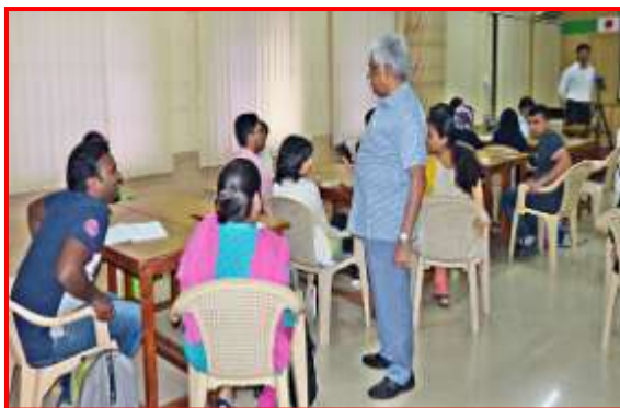
Japanese Language Teachers Training Program in Progress