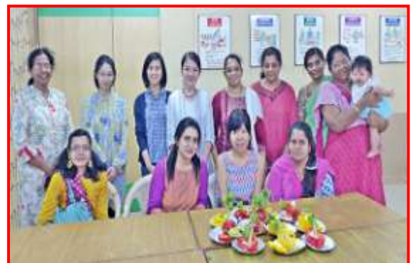
Coffee Meet activity in progress