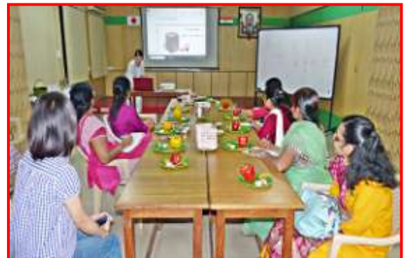
Coffee Meet activity in progress

On 15 th November the Coffee Meet was conducted on the Theme of Fruits.