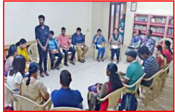
Speech Club activity in progress