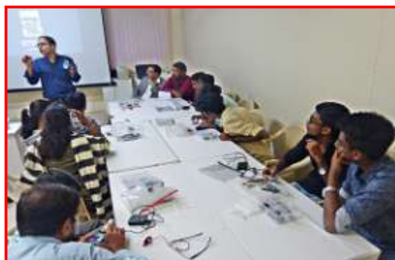
Section of audience in Robotics Workshop during Fair