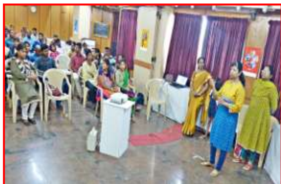
Photographs taken during the Japanese language orientation

Orientation for the new batch of N5,N4,N3 Students was held on 9 th December 2018. Details regarding the History of our school, our infrastructure, facilities, class room activities, extracurricular club activities, success stories were shared with the students.