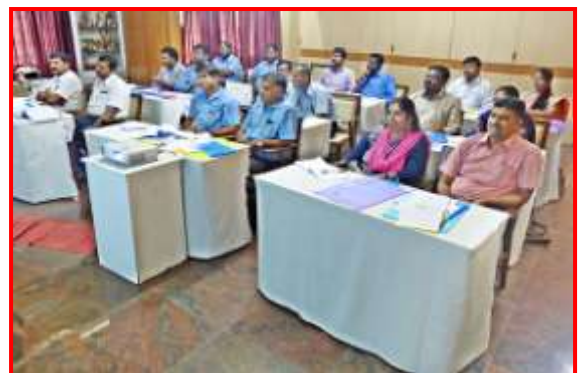
Japanese Management Training Program in progress