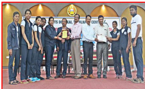
Photograph taken with the winners of 3 rd Innovative QC Competition