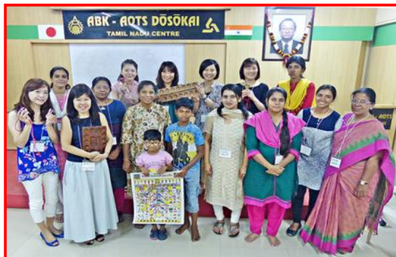
Group photo taken during the Coffee Meet On 20 th September 2018 – Autumn