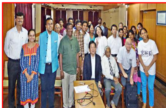
Group Photo taken during the Meeting with Metro Computers, Japan at our centre