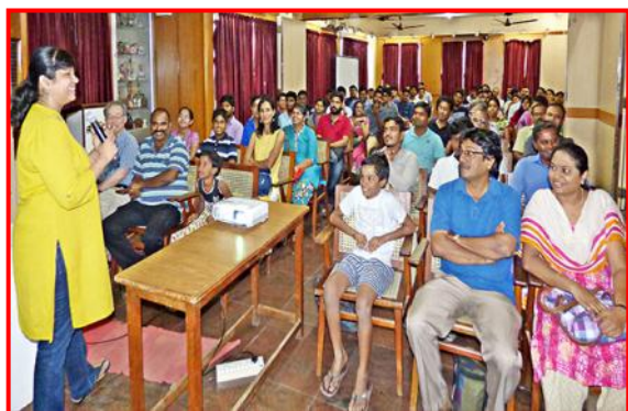
Japanese Language Orientation Session