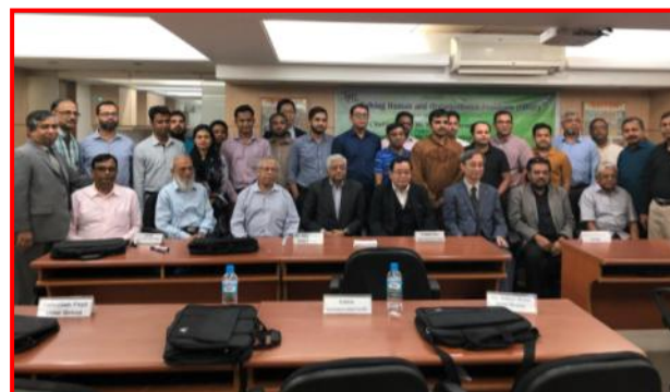
Group photo taken during the 2-Day-long Exclusive International Training on Solving Human and Organizational Problems (SHOP) Under the WNF Program of AOTS in Dhaka

After the training he has also participated in the Golden Jubilee Celebrations of Bangladesh AOTS Alumni Association (BAAS) held on 15 th September 2018 at Dhaka. It was a wonderful gathering and the event was conducted by BAAS in a grand memorable manner.