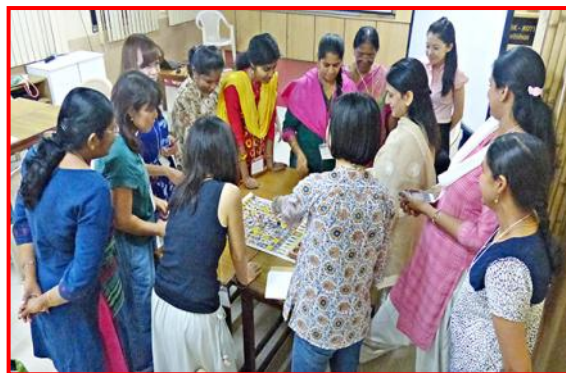
Coffee Meet activity in progress