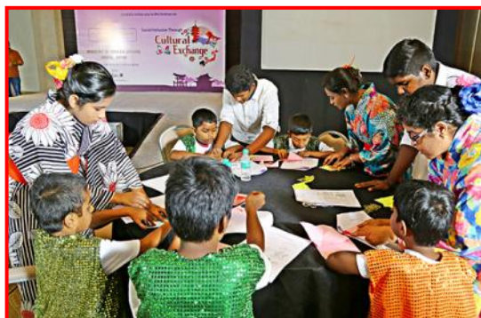
Social inclusion through cultural exchange' program in progress