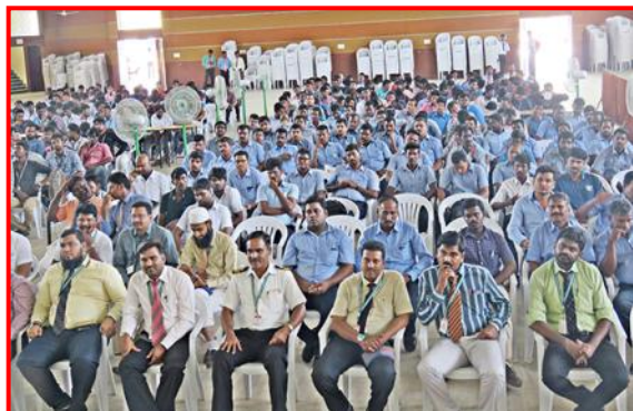
3 rd Innovative QC Competition – section of the participants