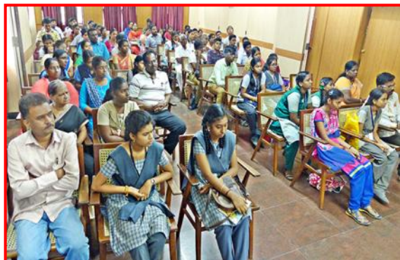
Section of audience of Talk Your Way to Japan – Tamil Speech Contest