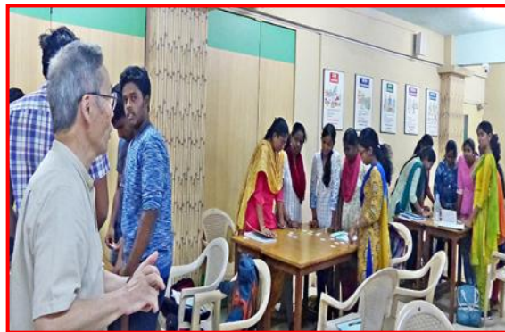
Japanese Language class in progress