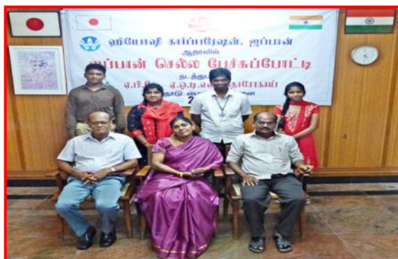
Group Photo with Winners of Talk Your Way to Japan – Tamil Speech Contest