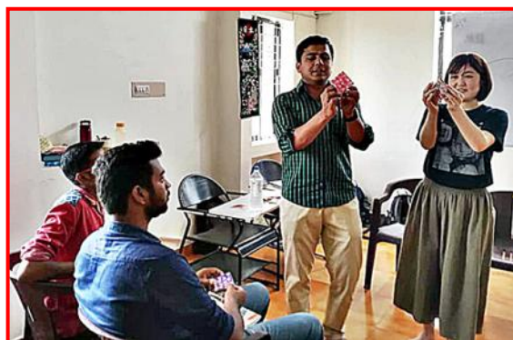
Japanese Language classes at our Erode Chapter in Progress