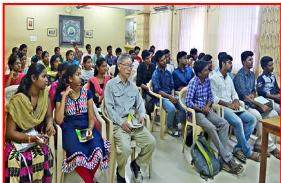
Japanese Language Orientation Session