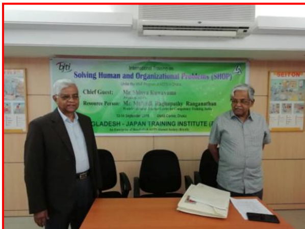
2-Day-long Exclusive International Training on Solving Human and Organizational Problems (SHOP) in Progress