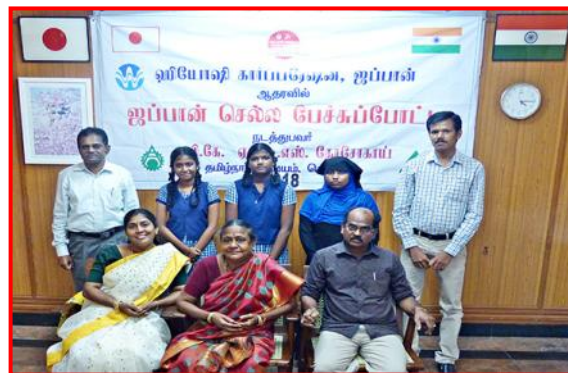
Group Photo with Winners of Talk Your Way to Japan – Tamil Speech Contest