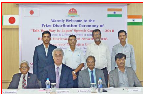
Group Photo with Hiyoshi Environmental awardees