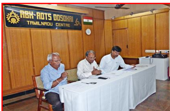
Annual General Body Meeting of ABK – AOTS DOSOKI, Tamilnadu Centre in progress