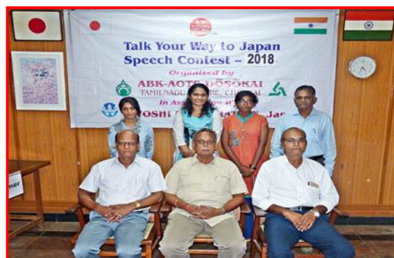
Group photo with Winners of Talk Your Way to Japan – English Speech Contest