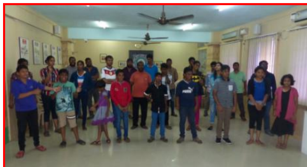
Karoko club activity in progress

In line with the theme, the song Tokyo Bon 東京盆踊り 2020 was chosen. This song was released to introduce tourist sites in Japan and traditional Japanese culture to foreigners who cannot understand Japanese! The song was taught and the students sang the song with a lot of interest and enthusiasm.. They also learned the famous steps of the song and tried to replicate it. It was indeed a very good learning experience along with all the fun.