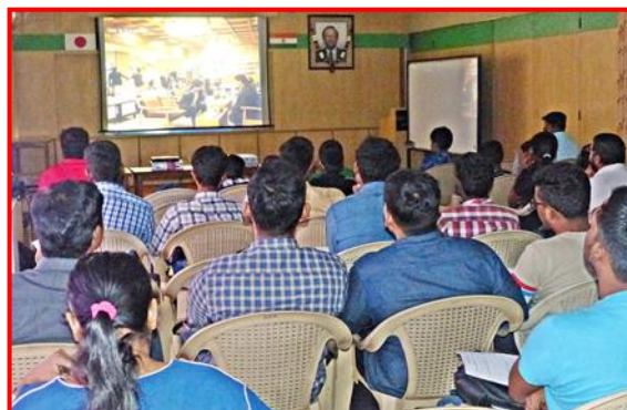
Screening Japanese NHK World Japan TV's in Progress

The Consulate General of Japan in Chennai in association with ABK – AOTS DOSOKAI, Tamilnadu Centre and Co-sponsored by NHK is Screening Japanese NHK World Japan TV on the second and fourth week of every month at Kumugai Auditorium, from 11 th August 2018 at our centre.