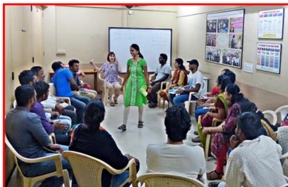
Speech Club activity in progress

The Speech Club is formed to train the students to participate in the Japanese Language Speech Contest and Speak Japanese fluently on 10, 17, 23, 26 Aug & 9, 12 Sep 2018