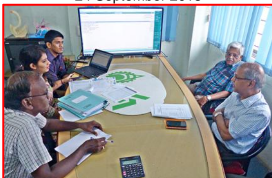
Pre meeting with our Audit Team on 10.09.2018 to finalize the accounts of our centre