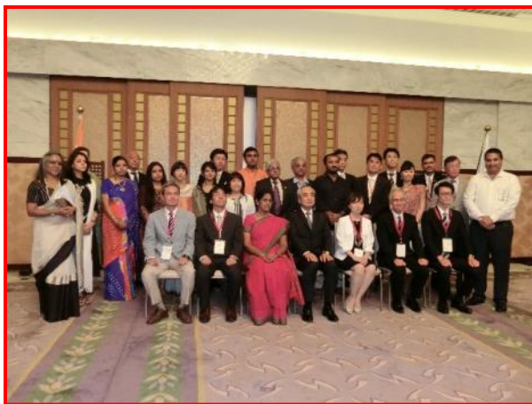
Photographs taken at the Reception Party for 5 Japanese Teachers visiting India, on 6 th August at His Excellency Ambassador of Japan's Residence.