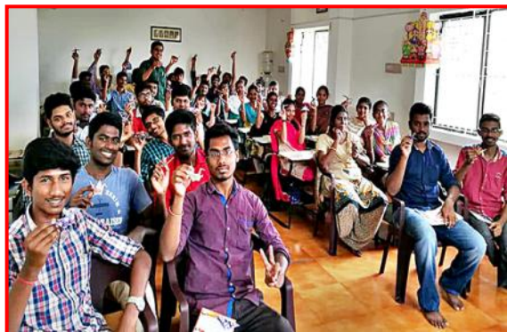
Japanese Language classes at our Erode Chapter - section of the students.