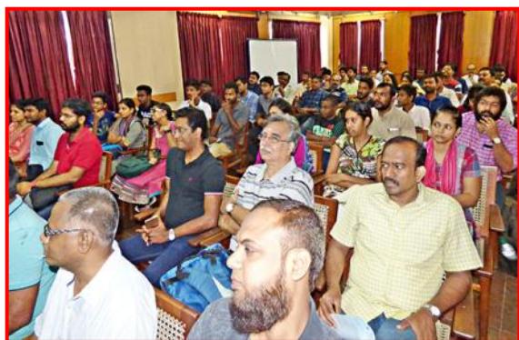
Japanese Language Orientation Session