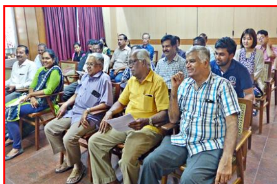
Annual General Body Meeting of ABK – AOTS DOSOKI, Tamilnadu Centre in progress