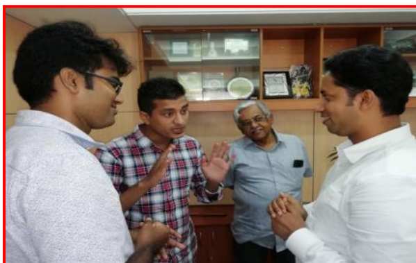
2-Day-long Exclusive International Training on Solving Human and Organizational Problems (SHOP) in Progress