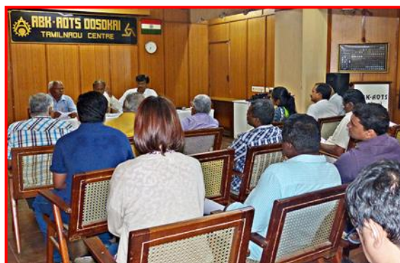
Annual General Body Meeting of ABK – AOTS DOSOKI, Tamilnadu Centre in progress