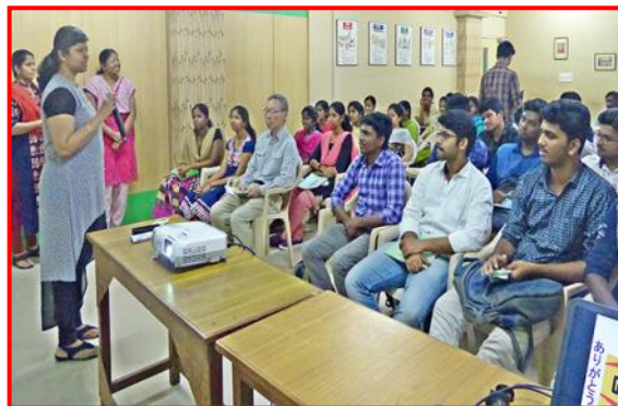
Japanese Language Orientation Session

The Language School of our centre started fresh batches of Japanese language courses for different levels of Proficiency of The Japan Foundation Examinations commenced on the 8 July 2018. Well trained staff, easy accessibility, affordable Pricing, excellent infrastructure and well equipped Library, with a number of Audio, Video materials make this educational institution different from others.