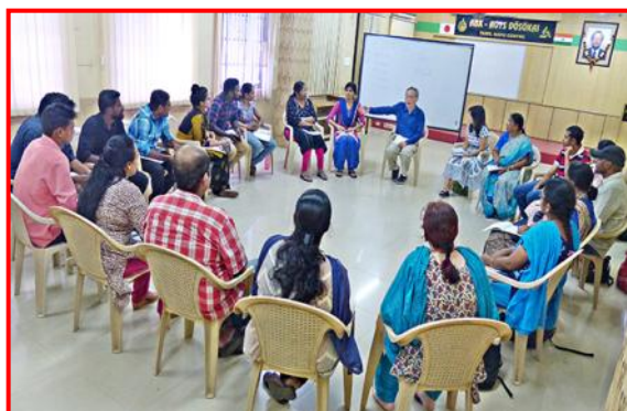
Speech Club activity in progress