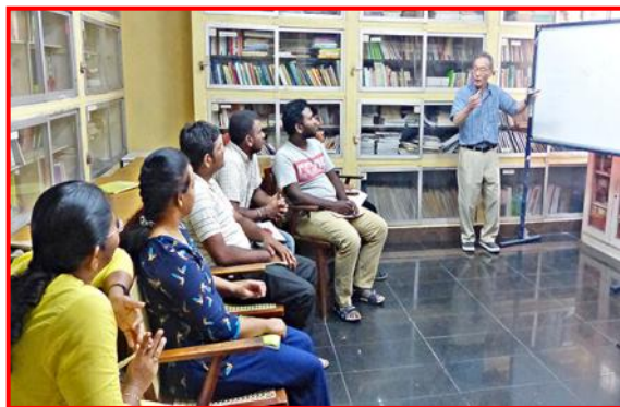
Speech Club activity in progress