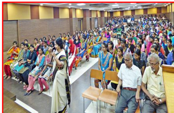
Photograph taken during the Meeting with Metro Computers, Japan held at Meenakshi Sundararajan Engineering College, Chennai.