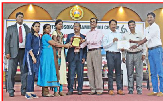
Photograph taken with the winners of 3 rd Innovative QC Competition