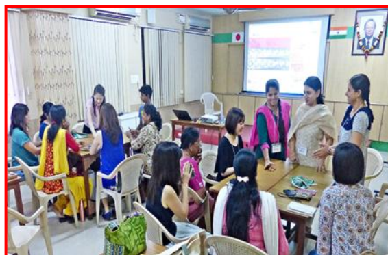
Coffee Meet activity in progress