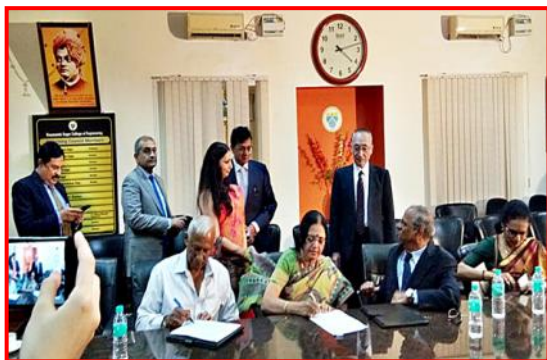
ABK – AOTS DOSOKAI, Bangalore Chapter signing an agreement with Dayanand Sagar University for teaching Japanese Language