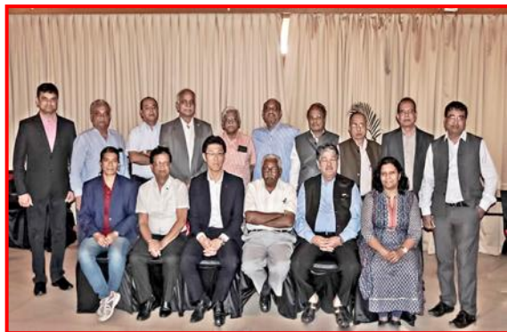
Group photo taken during the Annual General Meeting of “Federation of AOTS Alumni Association (FAAAI) on 4 September 2018 held at GOA