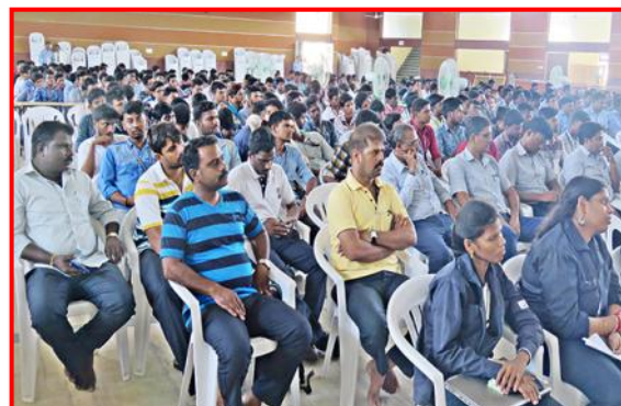
3 rd Innovative QC Competition – section of participants