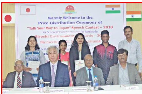
Group Photo with Talk Your way to Japan – Speech Contest winners