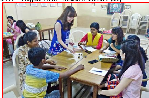
Coffee Meet activity in progress

On 22 nd August 2018 - Indian children's play