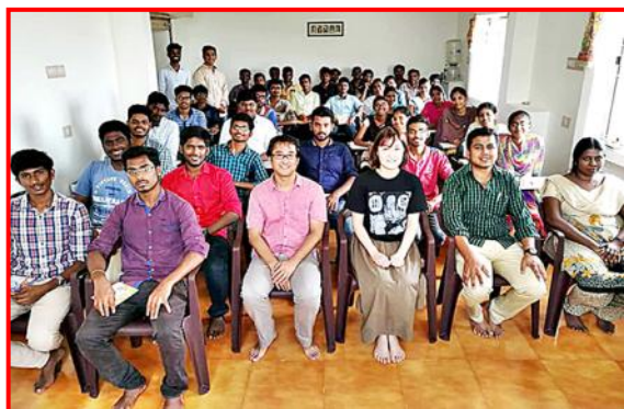
Japanese Language classes at our Erode Chapter in Progress