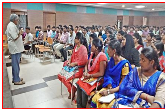
Japanese Language Orientation Session