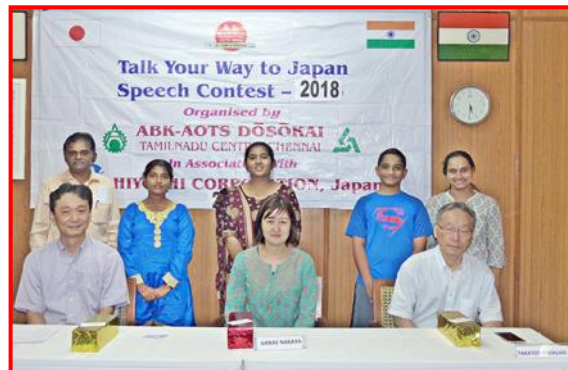
Group Photo with Winners of Talk Your Way to Japan - Japanese Speech Contest