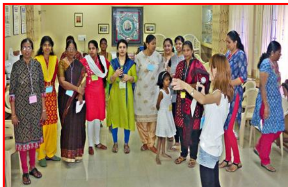
Coffee Meet activity in progress