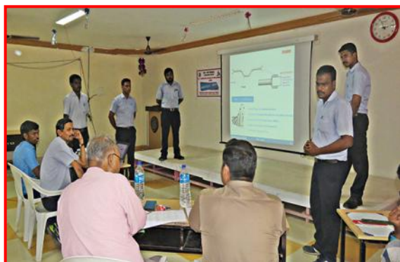
3 rd Innovative QC Competition – session in progress