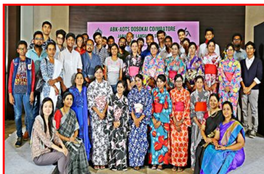
Group Photo taken during the Social inclusion through cultural exchange' program