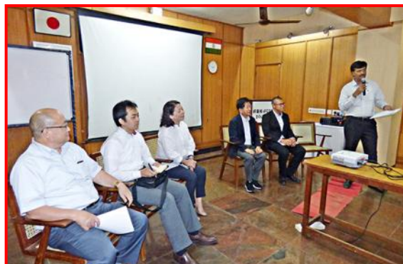
Photograph taken during the Meeting with Metro Computers, Japan at our centre