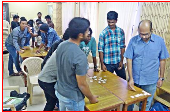
Japanese Language class in progress