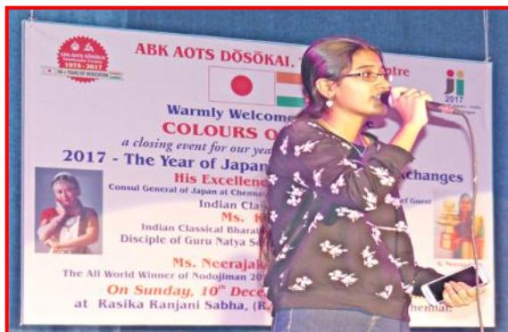
Japanese songs by our Japanese Language School students during Colours of Culture