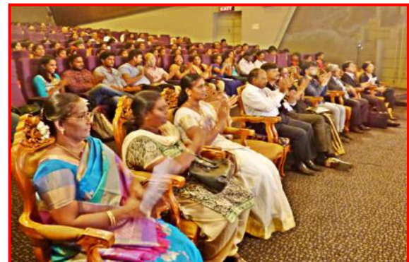
Section of the audience during the Japanese Night Vol 7