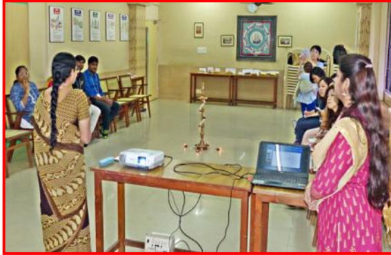
Coffee meet activity in progress