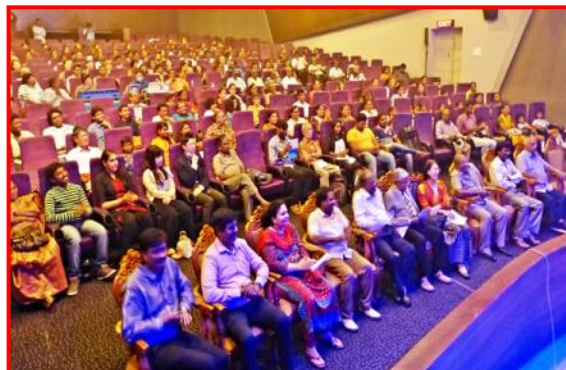
Section of the audience during Music Concert performed by “WASABI” Traditional Japanese Instrumental Group

The group after their performance at New Delhi came to Chennai and thereafter visited Madurai. Music lovers in Chennai thronged and enjoyed the musical sensation created by the dynamic live performance of the WASABI Traditional Japanese Instrumental Group .