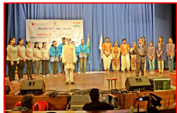
Performance of the students of our Nihongo Gakko