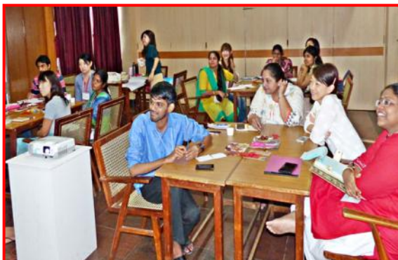
Coffee meet activity in progress