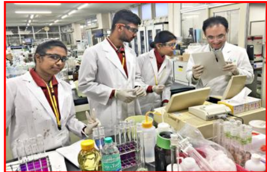
First Prize Winners of the Talk Your Way to Japan Speech Contest - 2017 hands on experience at Hiyoshi Corporation, Japan in progress