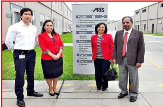
Group photo taken with the members of AOTS – Peru during the Presentation on Human Behavior in the 5S implementation in India Success stories