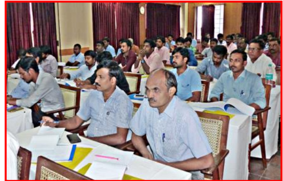
Japanese Management Training program - section of participants