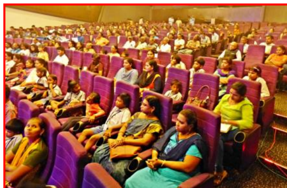
Section of the audience during Music Concert performed by “WASABI” Traditional Japanese Instrumental Group