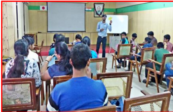
Waku Waku club activity in progress