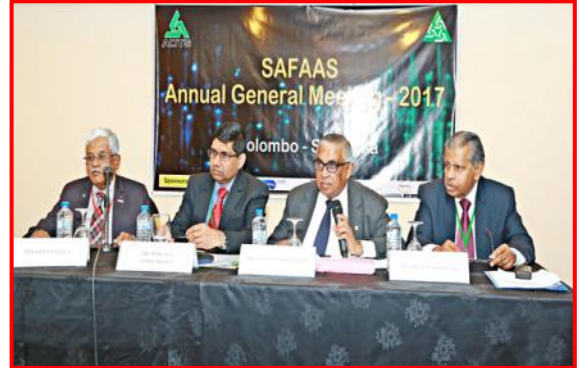
Dignitaries on the Dias of SAFAAS Annual General Body Meeting during 12 th Convention of South Asian Federation of AOTS Alumni Societies