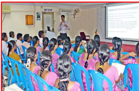
JLPT 2017 December Proctors meetings in progress

The Japanese Language Proficiency Test, (JLPT) is being held twice a year on the first Sunday of July & December Annually. Our centre has been identified for conducting the Japanese Language Proficiency Test for N1 ~ N5 for entire South India on 3 rd December 2017 at Vellammal Matriculation Hr. Sec.School, T. S. Krishnanagar, Mogappair, Chennai.