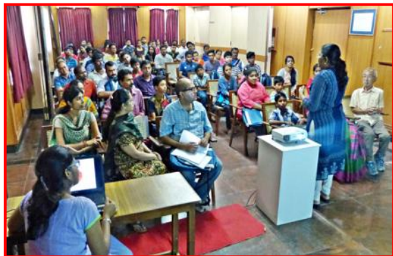
Japanese Language Class in progress