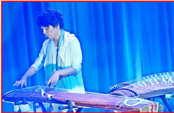
Music Concert performed by "WASABI" Traditional Japanese Instrumental Group in progress