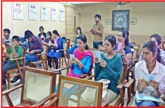
Waku Waku club activity in progress