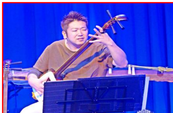
Music Concert performed by “WASABI” Traditional Japanese Instrumental Group in progress