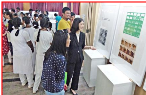
Section of the audience Exhibition “Photographic Images and Matter: Japanese Prints of the 1970s”