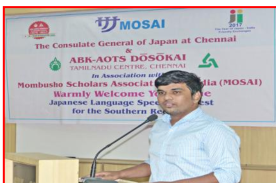
MOSAI – Japanese Language Speech Contest for Southern Region in progress

The Prizes for the Winners were sponsored by The Consulate General of Japan in Chennai & ABK-AOTS DOSOKAI, Tamilnadu Centre. The above prize winners are eligible to participate in 30 th ALL INDIA JAPANESE SPEECH CONTEST to be conducted at Newdelhi on Mid February 2018.