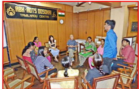
Speech Club activity on 4 th October 2017 in progress