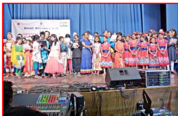
Performance of the students – Japanese Night Vol 7