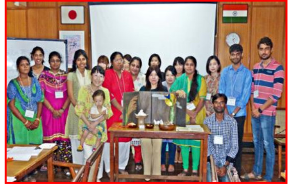
Coffee meet activity in progress