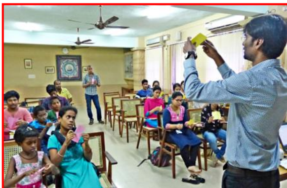
Waku Waku club activity in progress