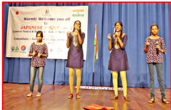
Performance of the students of our Nihongo Gakko