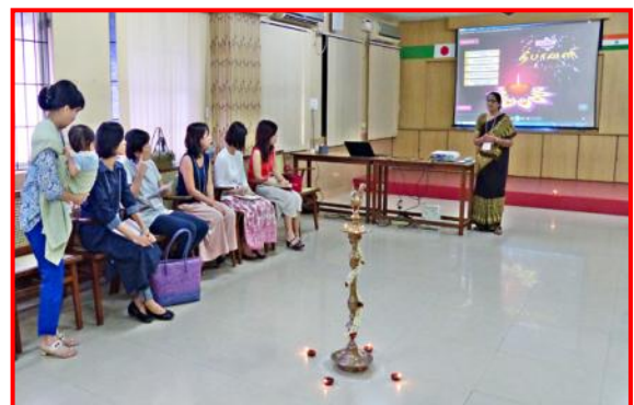
Coffee meet activity in progress