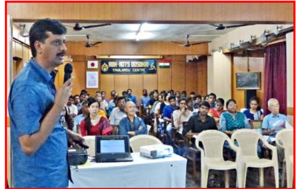
JLPT 2017 December Proctors meetings in progress