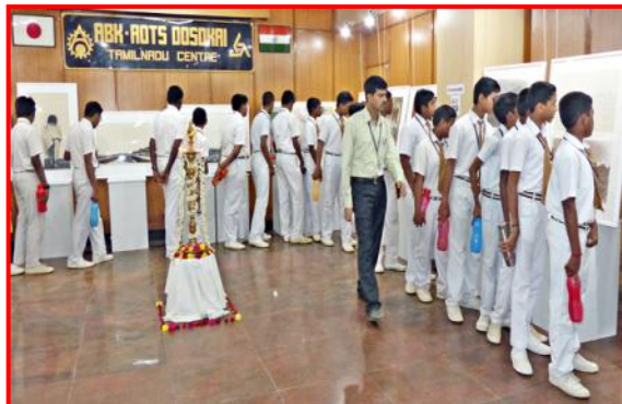
Section of the audience of Exhibition on Photographic Images and Matter: Japanese Prints of the 1970s”