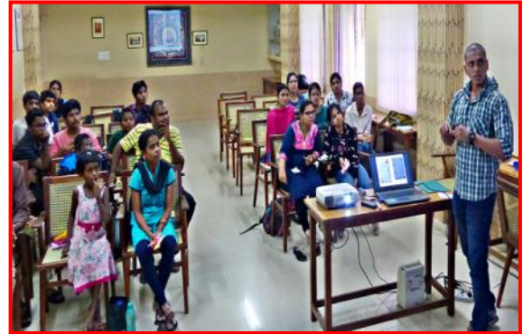
Waku Waku club activity in progress