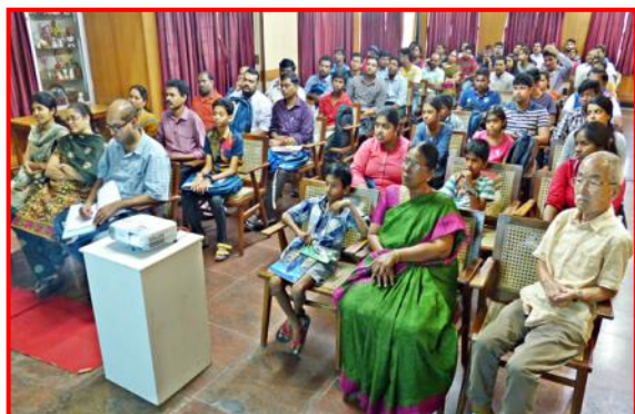
Japanese Language Class in progress