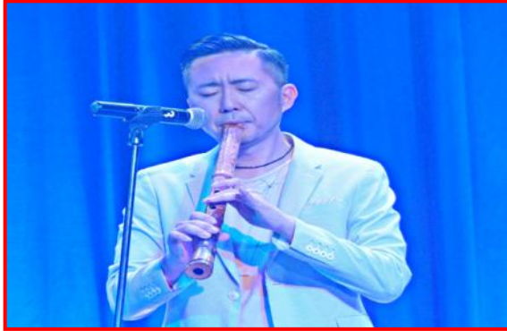
Music Concert performed by "WASABI" Traditional Japanese Instrumental Group in progress