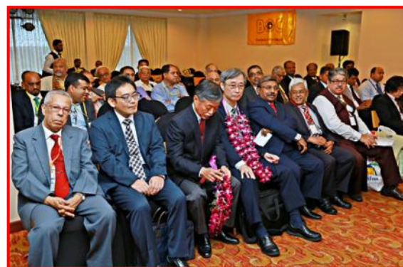
12 th Convention of South Asian Federation of AOTS Alumni Societies – section of participants