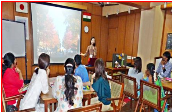
Coffee meet activity in progress