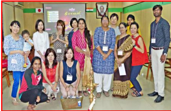
Coffee meet activity in progress