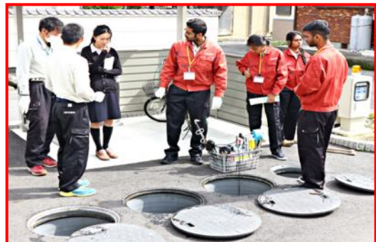
First Prize Winners of the Talk Your Way to Japan Speech Contest - 2017 hands on experience at Hiyoshi Corporation, Japan in progress