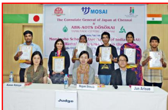
Group photo taken during the MOSAI – Japanese Language Speech Contest for Southern Region