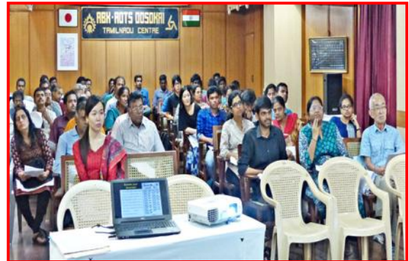
JLPT 2017 December Proctors meetings in progress