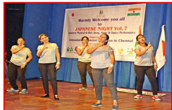
Performance of the students of our Nihongo Gakko