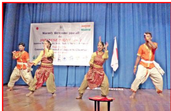
Performance of the students of our Nihongo Gakko