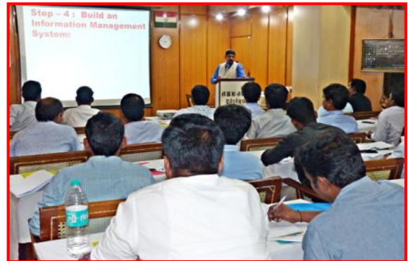
Japanese Management Training program - section of participants