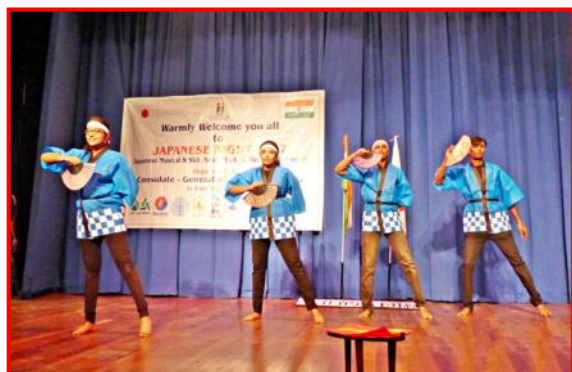
Performance of the students of our Nihongo Gakko