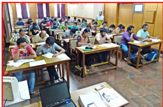
Japanese Language Class in progress

The Language School of our centre started fresh batches of Japanese language courses for different levels of Proficiency of The Japan Foundation Examinations commenced on the 10 th December 2017. Well trained staff, easy accessibility, affordable Pricing, excellent infrastructure and well equipped Library, with a number of Audio, Video materials make this educational institution different from others.