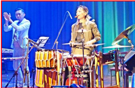
Music Concert performed by "WASABI" Traditional Japanese Instrumental Group in progress