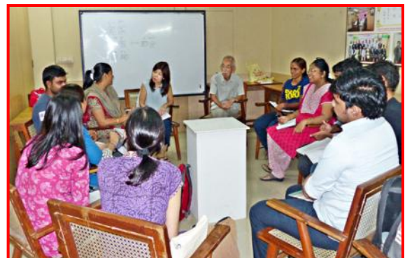
Speech Club activity on 25 th October 2017 in progress