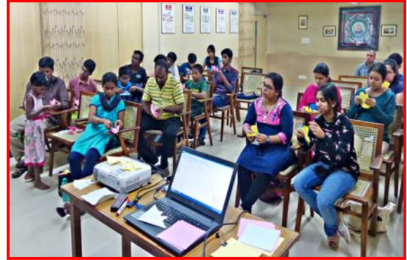
Waku Waku club activity in progress