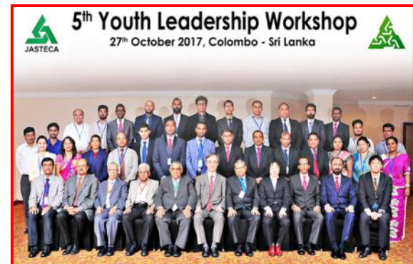
Group photo taken during the 5 th Youth Leadership Workshop