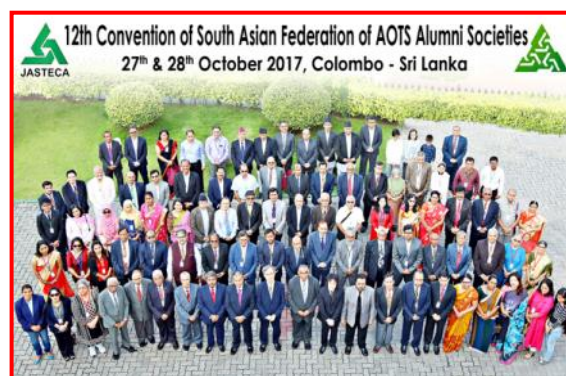
Group photo taken during the 12 th Convention of South Asian Federation of AOTS Alumni Societies