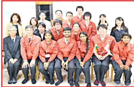
Group photo taken with the staff of Hiyoshi Corporation with First Prize Winners of the Talk Your Way to Japan Speech Contest – 2017