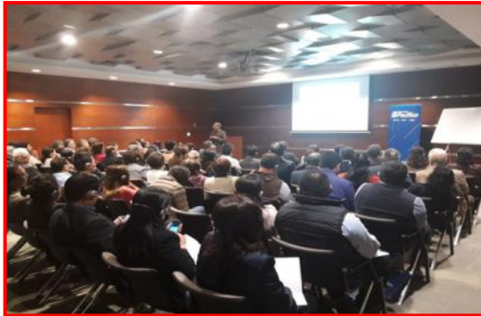
Human Behavior in the 5S implementation in India – Success stories – in progress

delivery were very well received and appreciated by one and all.