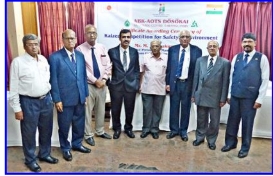
Group Photos taken with Chief Guest and Juries of the Kaizen Competition for Safety & Environment