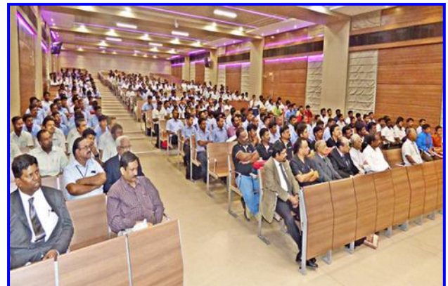
2 nd Innovative QC Competition – section of participants