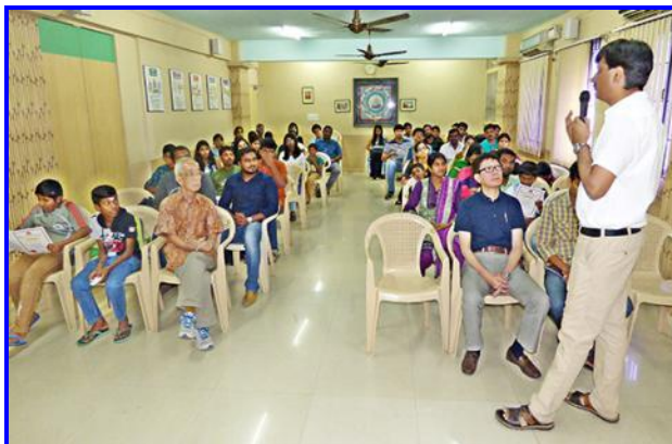
Certificate Awarding Ceremony of Japanese Language School of our centre in progress