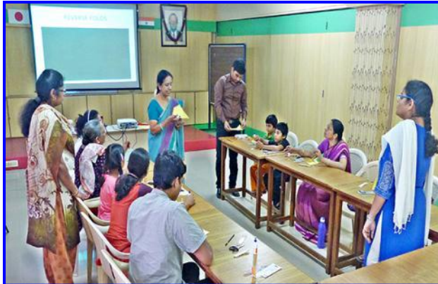
Origami Workshop - session in progress

ABK – AOTS DOSOKAI, Tamilnadu Centre organized the “ ORIGAMI WORKSHOP ” comprising of basic folding techniques, Boxes, Baskets, Balls, Greeting Cards, Birds, Animals, Flowers, & Bouquet, on 19 th May 2017 between 10.00 am to 04.00pm