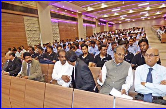
2 nd Innovative QC Competition – session of participants