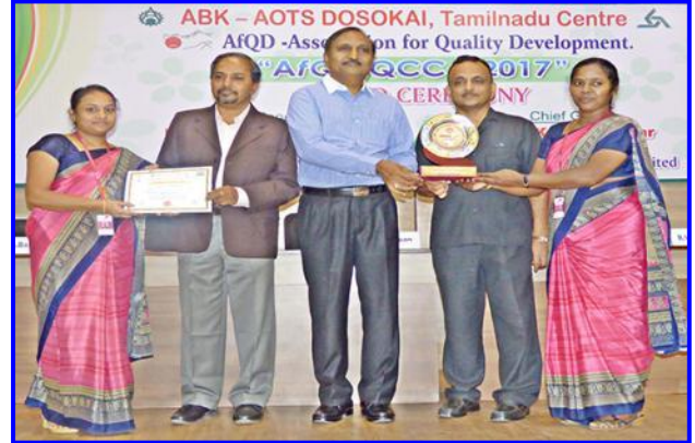
Photograph taken with the winners of 2 nd Innovative QC Competition