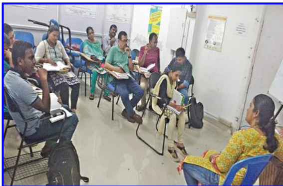
Japanese Language classes conducted at Thiruvanmiyur Chapter – section of participants