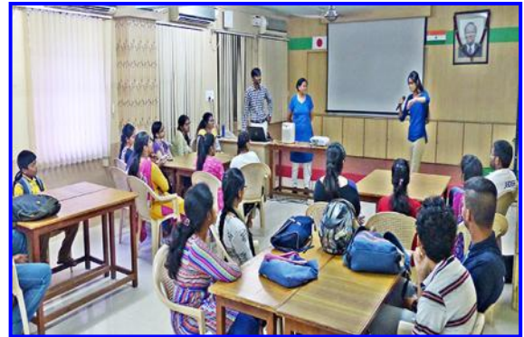
Waku Waku Club activity in progress