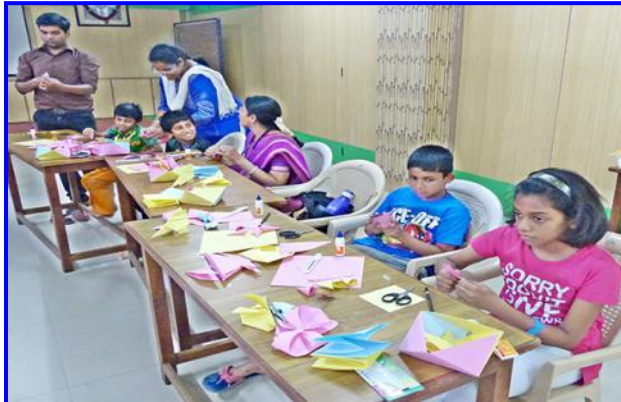
Origami Workshop - session in progress