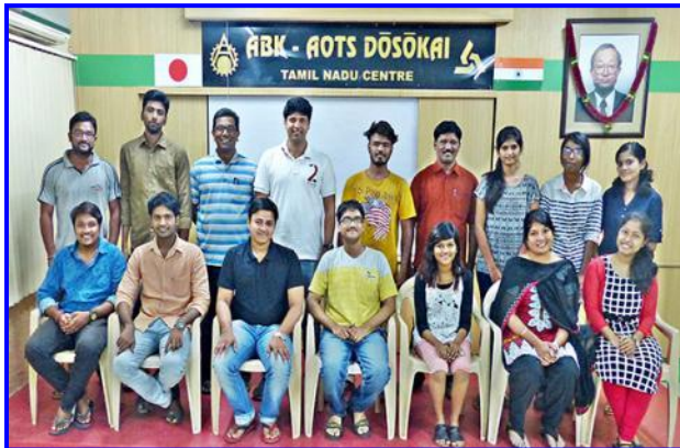
Group photo taken during Certificate Awarding Ceremony of Japanese Language School of our centre