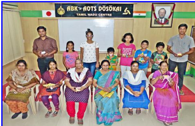
Group Photo taken during the Origami Workshop