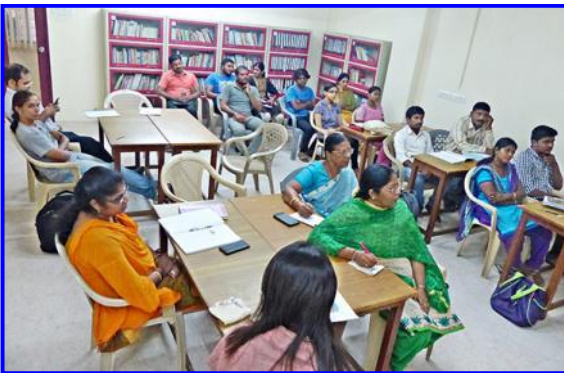
Waku – Waku Club speech contest in progress

It was held on 5 th April 2017, 12 th April 2017, 10 th May 2017.