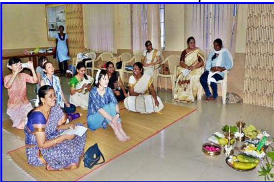
Waku – Waku Club coffee meet in progress