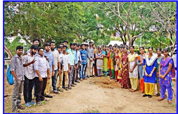
Group photo taken at Knowledge of Institute of Technology, Salem