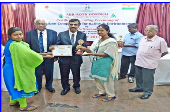
Photos taken with winners of the Kaizen Competition for Safety & Environment