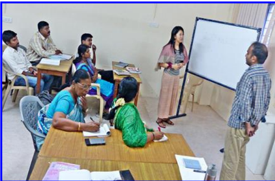
Waku – Waku Club speech contest in progress