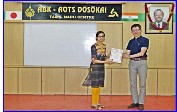
Certificate Awarding Ceremony of Japanese Language School of our centre in progress