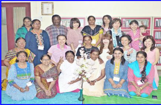
Waku – Waku Club coffee meet in progress