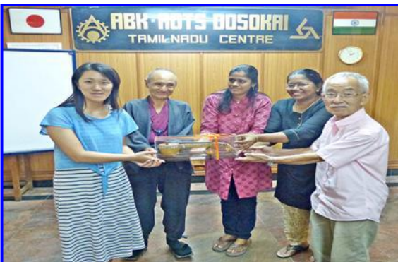
Waku – Waku Club memento to the trainer