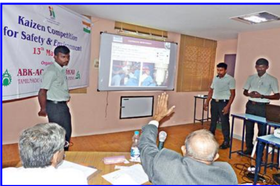
Kaizen Competition for Safety & Environment – session in progress