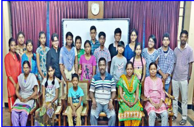
Group photo taken during Certificate Awarding Ceremony of Japanese Language School of our centre