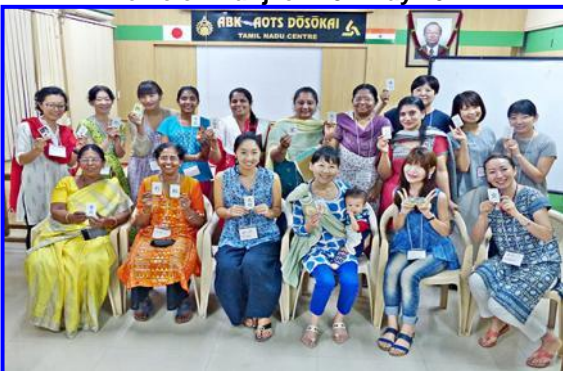
Waku – Waku Club coffee meet in progress