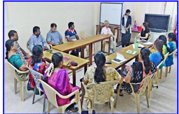
Waku – Waku Club speech contest in progress