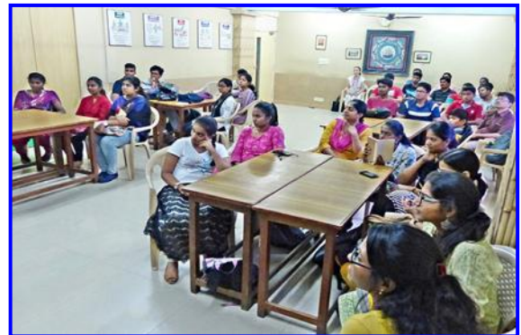
Waku Waku Club activity in progress