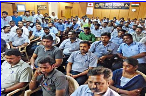
Kaizen Competition for Safety & Environment – section of participants