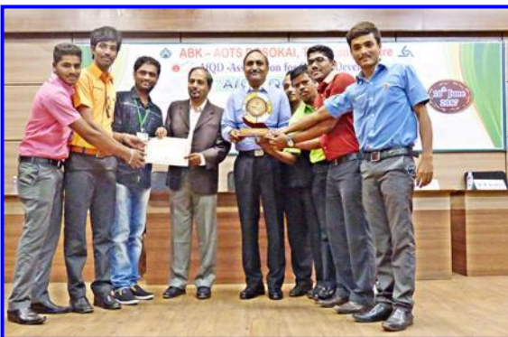
Photograph taken with the winners of 2 nd Innovative QC Competition