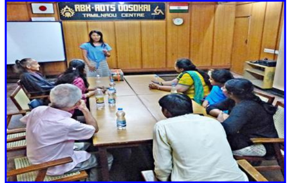
Waku – Waku Club speech contest in progress