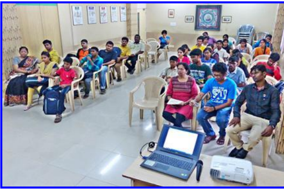
Waku Waku club activity in Progress