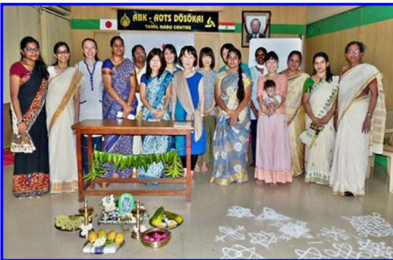
Waku – Waku Club coffee meet in progress