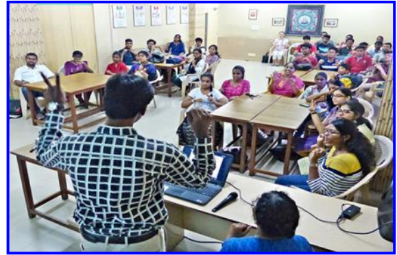
Waku Waku Club activity in progress