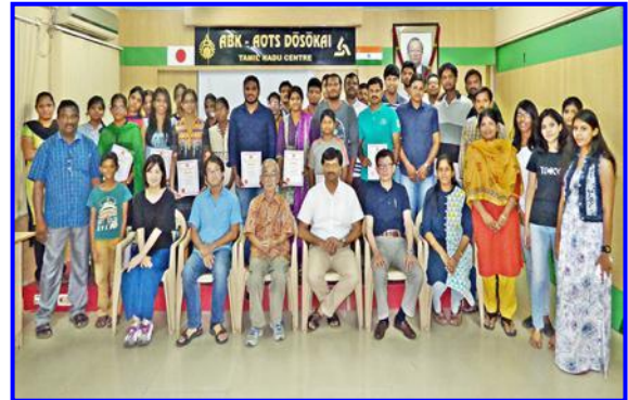
Group photo taken during Certificate Awarding Ceremony of Japanese Language School of our centre