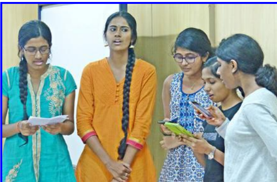
Singing Japanese songs during the Waku Waku Club