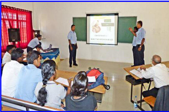
2 nd Innovative QC Competition – session in progress