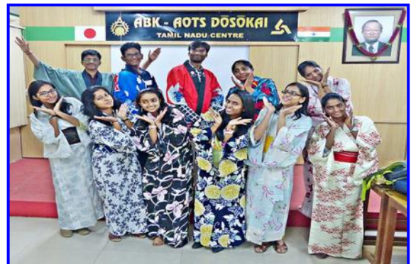
Kimono wearing during the Waku Waku club