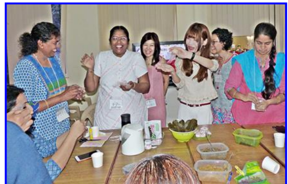
Waku – Waku Club coffee meet in progress