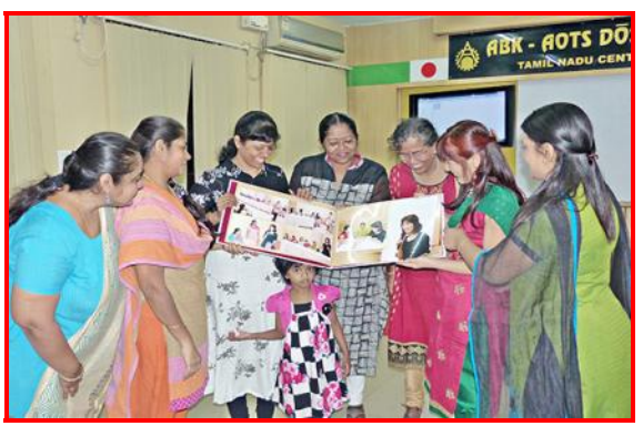
Group photo taken during the coffee meet