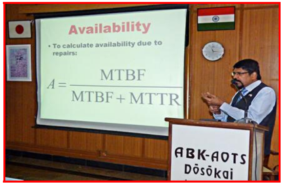
Japanese Management Training program in progress

Training with Group Discussion Improving competency level By using "KAIZEN CASE STUDIES" for office & service personal was held on 22<sup>nd</sup> November 2016 at our centre. 10 participants from 4 companies participated in the training program.