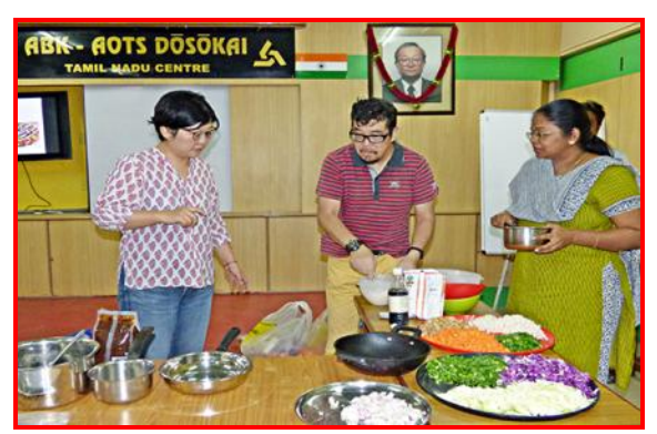
Japanese Cooking Demonstration in progress