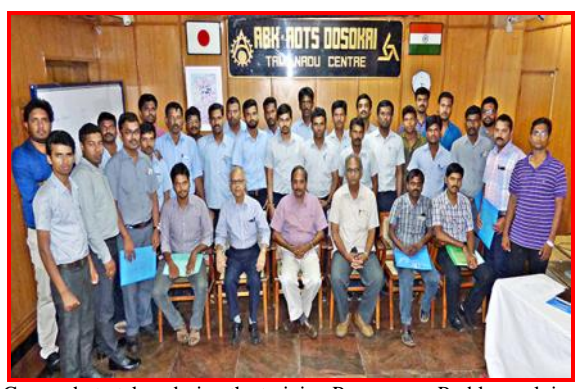
Group photo taken during the training Program on Problem solving Process (PSP) The Toyota Way on 15<sup>th</sup> November 2016