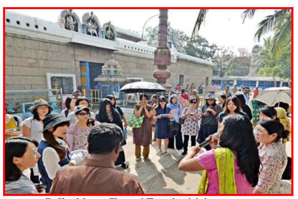
Coffee Meet - Chennai Temple visit in progress