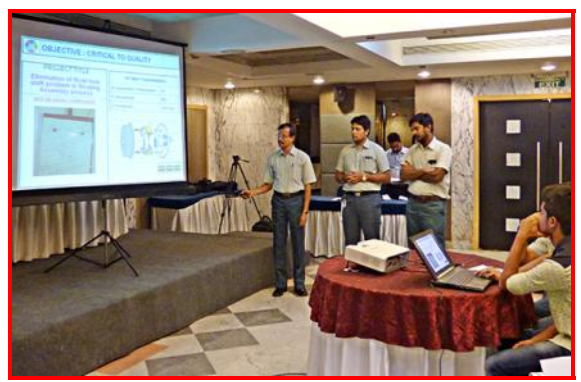
1st Quality Improvement Team competition – session in progress