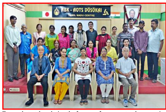
Group photo taken during the Japanese Language teachers meeting