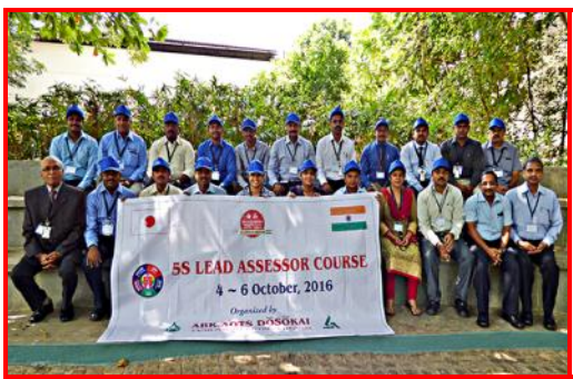
Group photo taken during the 5S Lead Assessor Course