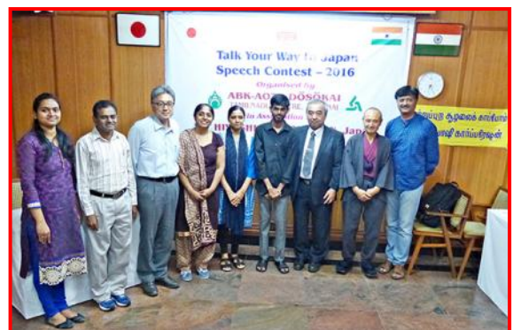
Winners of Japanese Language Speech Contest