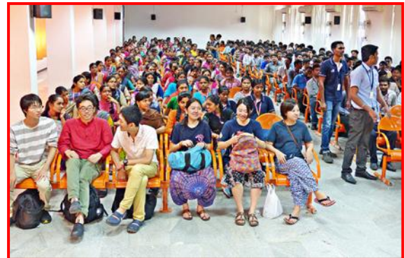
20 th JISC Team had discussion with students of Chennai Institute of Technology (CIT)