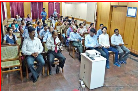
Section of audience of Hiyoshi Green Campus Award

During the award giving ceremony the winners gave a presentation on their project.