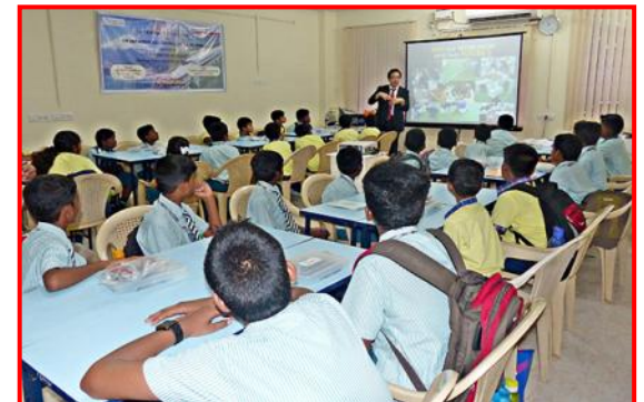
Section of audience in Robotics Workshop during Japan Education Fair