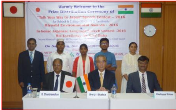
First Prize winners of Talk Your Way to Japan

The first prize winners of the competition are being sent to Japan on a Two Week totally free Study cum Cultural Exchange Trip