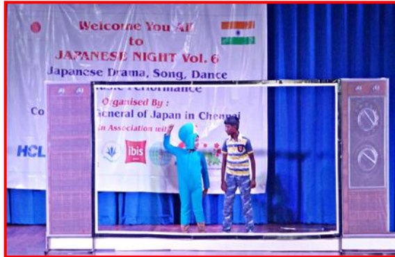
Performance of the students of our Nihongo Gakko