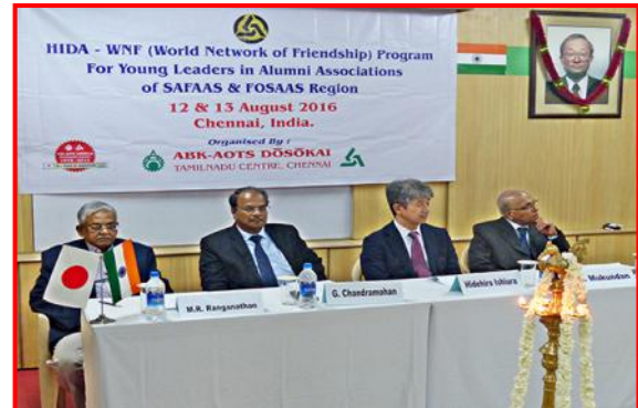
Dignitaries on dais during the WNF Program for Young Leaders in Alumni Associations of SAFAAS & FOSAAS Region