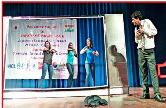
Performance of the students of our Nihongo Gakko