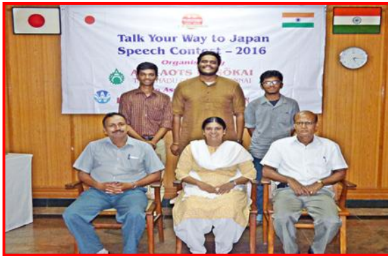
Winners of English Speech Contest

“JAPANESE NIGHT VOL.6” on Friday September 16, 2016 with various cultural events performed by the students learning Japanese in Chennai.