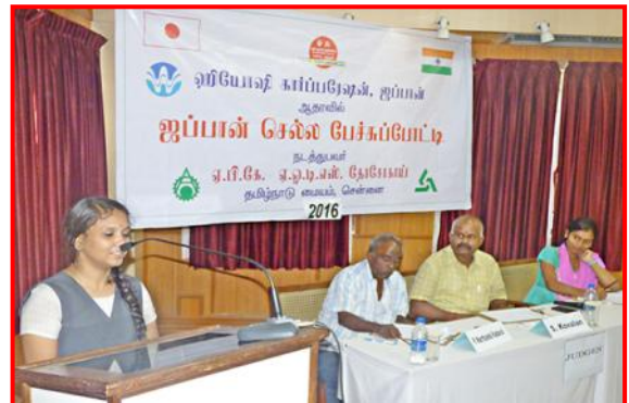
Talk Your Way to Japan – Tamil Speech Contest in Progress