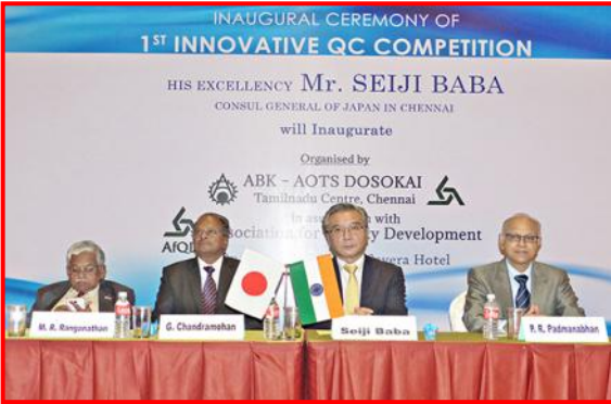
Dignitaries on Dias during the Inaugural ceremony of QC competition