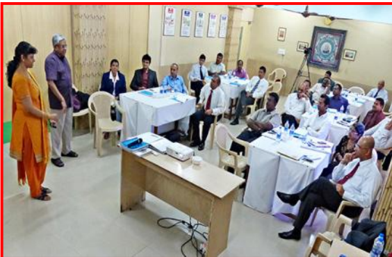
WNF Program for Young Leaders in Alumni Associations of SAFAAS & FOSAAS Region – session in progress