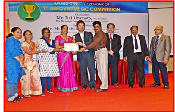
Winners of QC competition