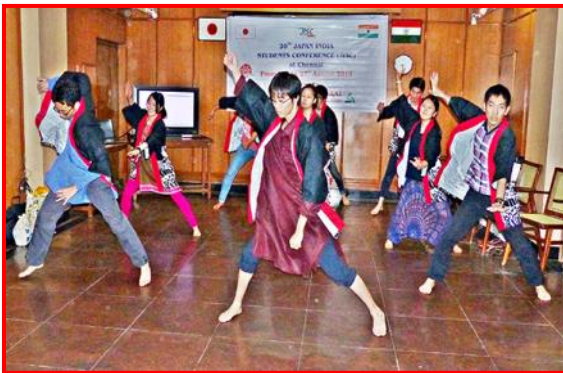
Performance of 20 th JISC Team during the welcome dinner