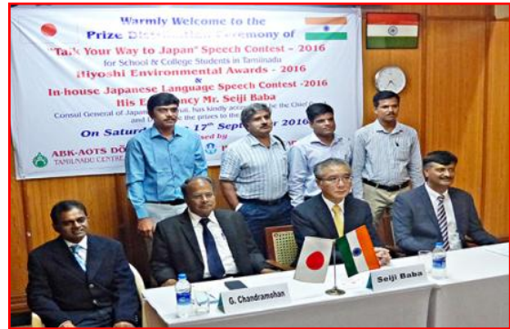
Hiyoshi Environmental awardees – 2016