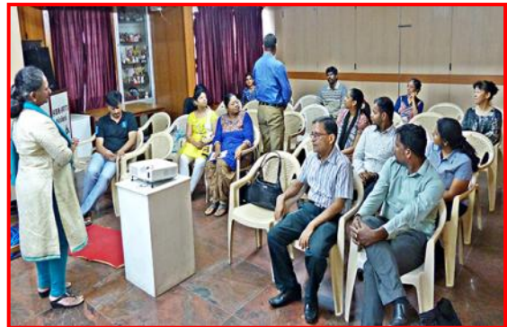
Toast Master International Club Demo Session in progress