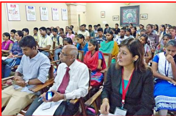
Section of audience during the Seminar on Japan Education Fair