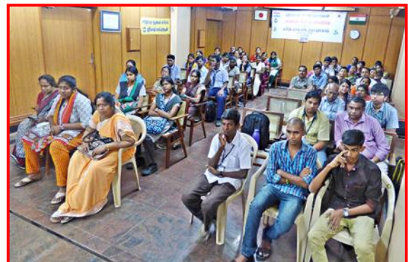
Section of audience of Talk Your Way to Japan – Tamil Speech contest held on 27 August 2016