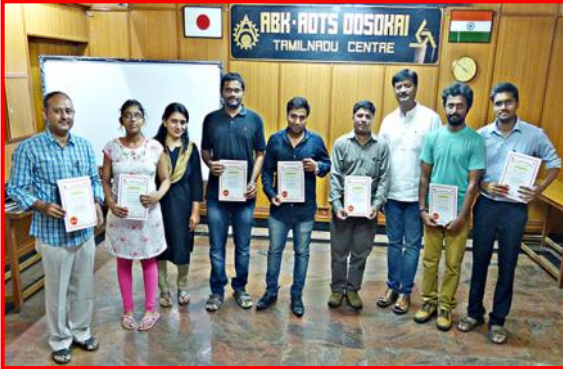
Group photo taken during the Basic Conversation (Spoke Japanese) course completion certificate awarding ceremony.