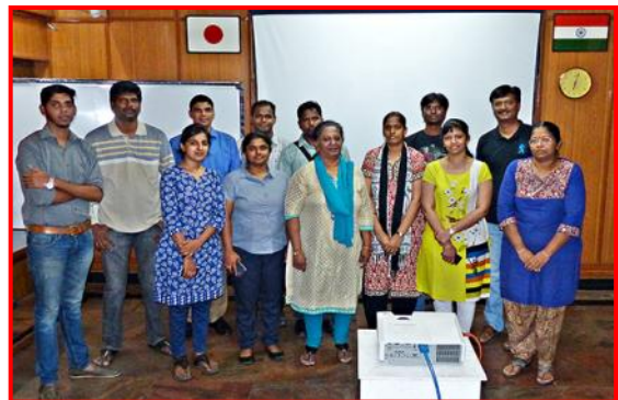
Group photo taken during the Toast Master International Club Demo Session.