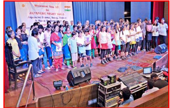
Performance of the students – Japanese Night Vol 6