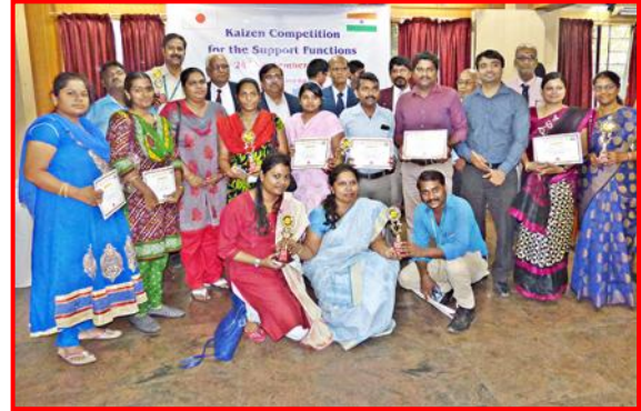
Group photo taken during the Kaizen Competition