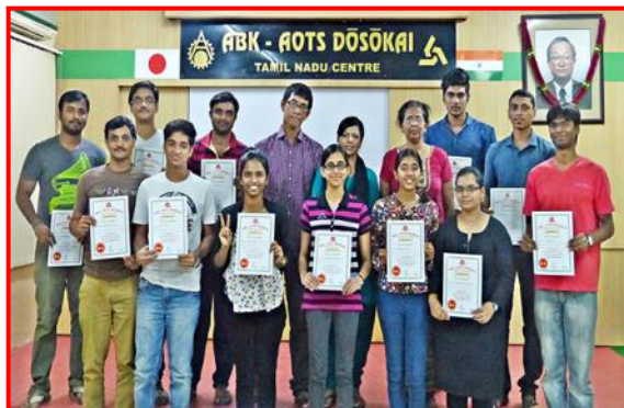
Group photo of Inhouse Japanese Language Speech contest participants

Held in Japanese for Nihongo Gakko – Japanese Language School of our centre on Sunday 21.08.2016 Out of 7 participants the following are the winners of the above Speech Contest.