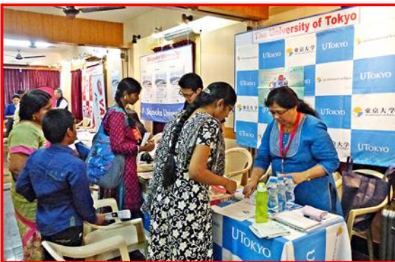
Japan Education Fair in progress