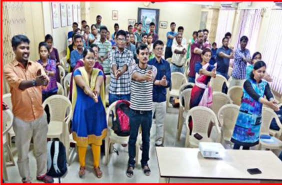
Japanese Rhymes during Waku Waku Club in Progress