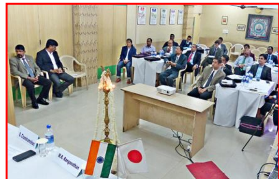
WNF Program for Young Leaders in Alumni Associations of SAFAAS & FOSAAS Region – session in progress