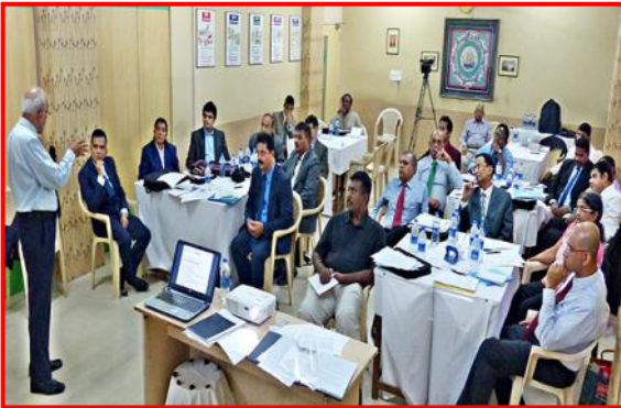
WNF Program for Young Leaders in Alumni Associations of SAFAAS & FOSAAS Region – session in progress