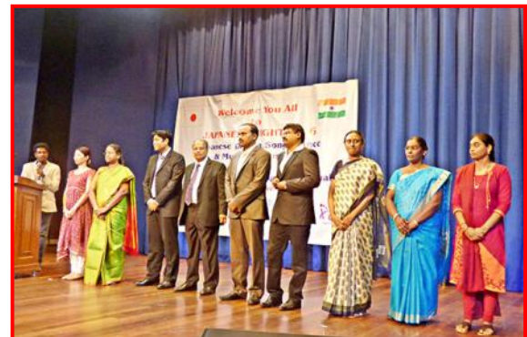
Introduction of the coordinators of Japanese Night – Vol 6

The Consulate-General of Japan in Chennai in association with HCL Technologies, ABK-AOTS Dosokai Tamilnadu Centre, Sethu Bhaskara Japanese Language Academy, Soka Ikeda College of Arts and Science for Women, ibis Hotel, Indo-Japan Chamber of Commerce and Industry, Hayakawa Japanese Language School and Cultural Centre, Surya Nihongo Gakko and KC Consulting Services organized