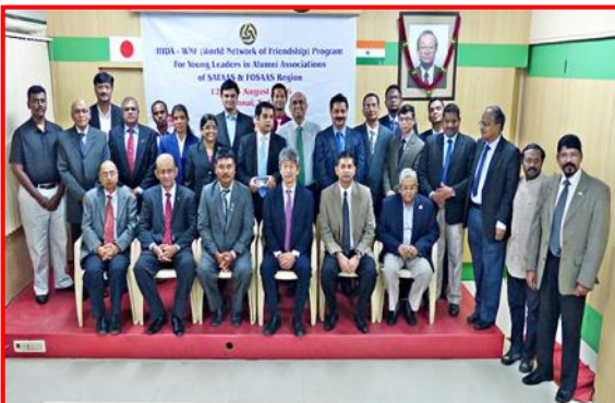
Group Photo taken during the WNF Program for Young Leaders in Alumni Associations of SAFAAS & FOSAAS Region