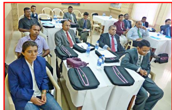
WNF Program for Young Leaders in Alumni Associations of SAFAAS & FOSAAS Region – session in progress