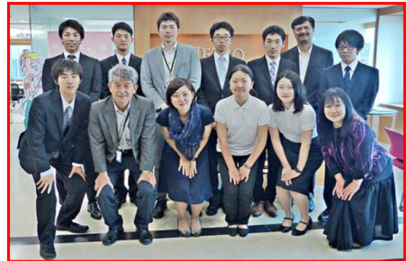
20 th JISC Team had group photo with JETRO, Chennai