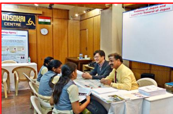
Japan Education Fair in progress