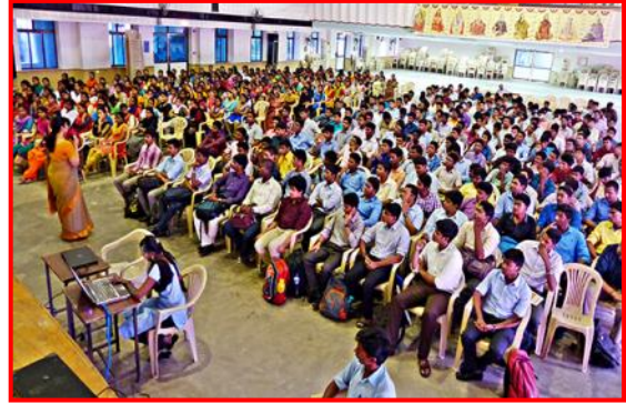
Japanese Language Class introduction session at Meenakshi Sunderarajan Engineering College in progress