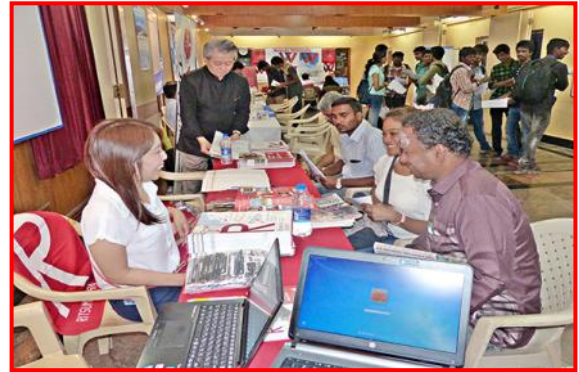
Japan Education Fair in progress