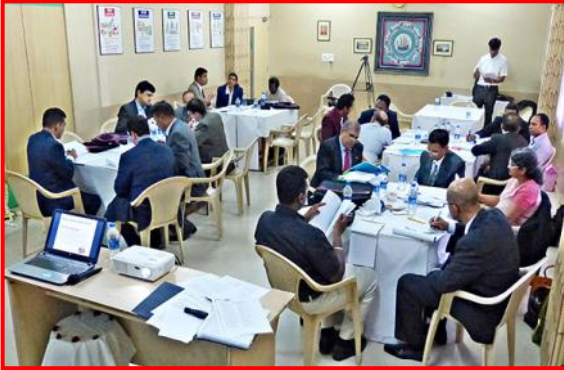
WNF Program for Young Leaders in Alumni Associations of SAFAAS & FOSAAS Region – session in progress