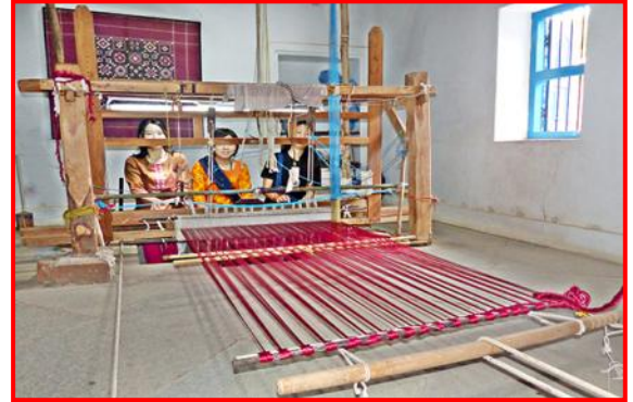
Our students guiding the 20 th Jisc students to Dakshinchitra