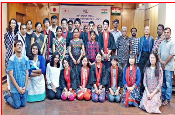
Group photo taken during the Welcome ceremony of 20 th JISC Team