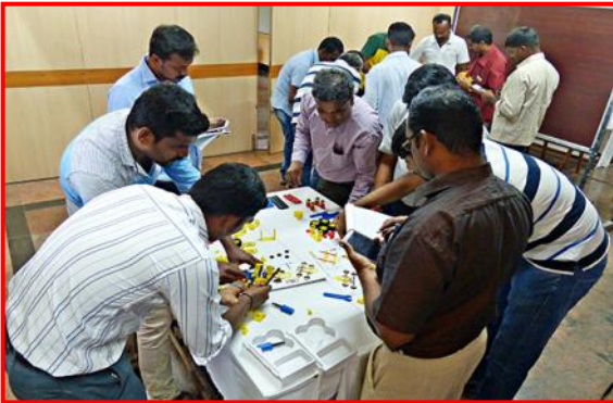
Training Program on “ INDIAN WAY KAIZEN ” with Case Studies and Simulation Games in progress

For any needs please contact us. rangaots@gmail.com / abkaots@gmail.com Tel. +91-44-2374 0318 / 2374 3575