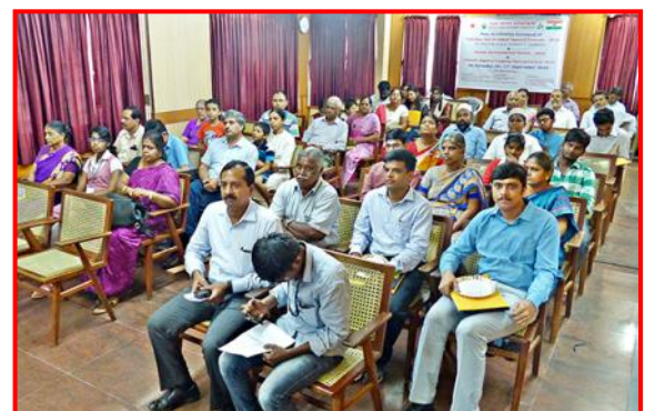
Section of audience during the prize awarding ceremony