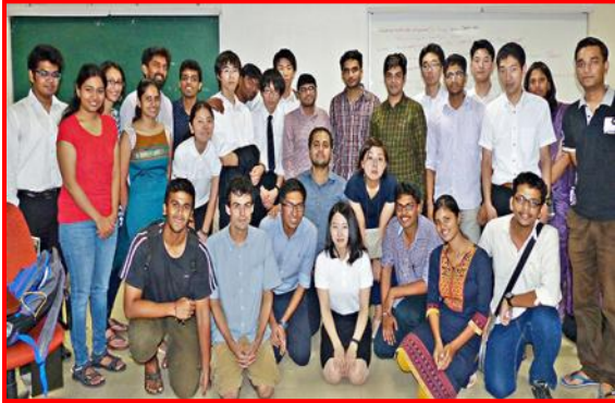
20 th JISC Team had discussion with Indian Institute of Technology (IIT, Chennai)