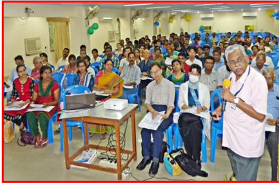
JLPT 2016 (July) – Proctors Meeting in Progress

The Japanese Language Proficiency Test, (JLPT) is being held twice a year on the first Sunday of July & December annually. Our centre has been identified for conducting the Japanese Language Proficiency Test for N1-N5 for entire South India on 3 rd July 2016.