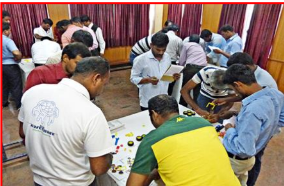
Training Program on “ INDIAN WAY KAIZEN ” with Case Studies and Simulation Games in progress