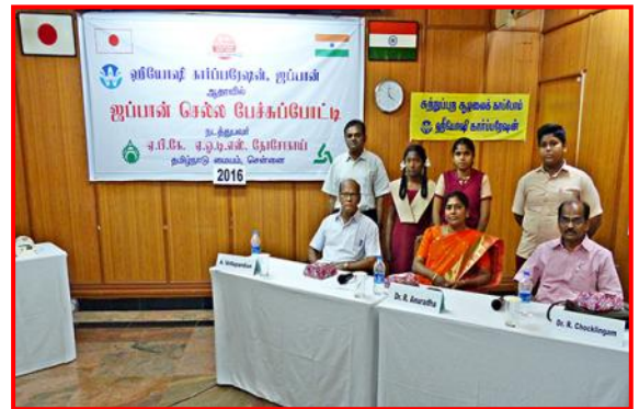
Winners of Tamil Speech Contest