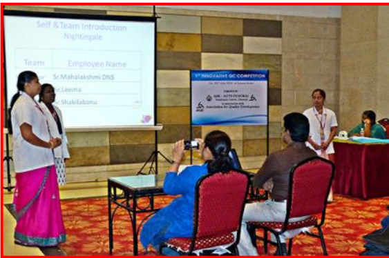
QC competition in progress