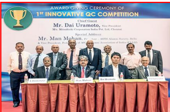
Dignitaries on Dias during the valedictory ceremony of QC competition