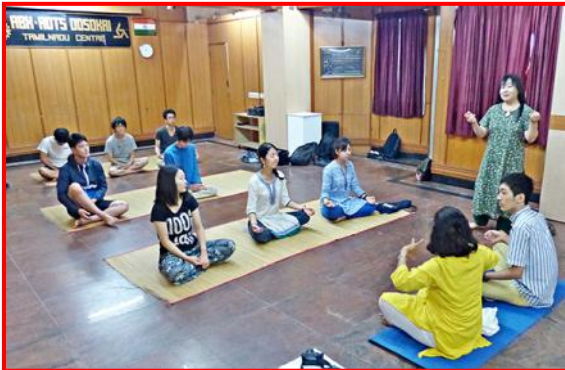
20 th JISC Team has practice Yoga