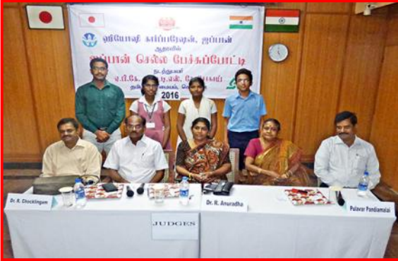
Winners of Tamil Speech Contest