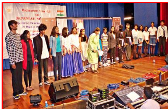
Performance of the students of our Nihongo Gakko