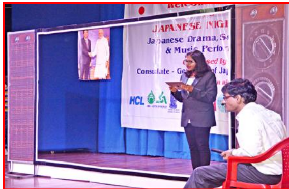
Performance of the students of our Nihongo Gakko