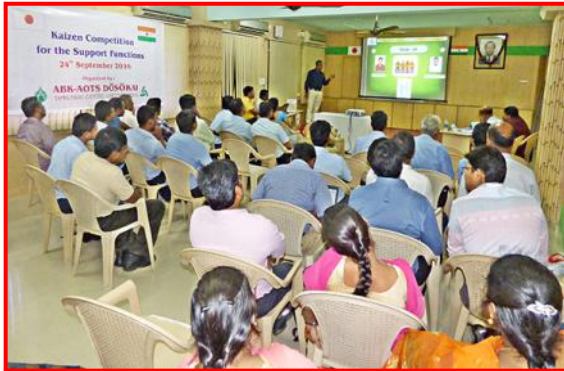
Kaizen Competition in Progress