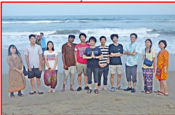
Our students guiding the 20 th JISC students to Marina beach