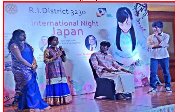
Performance of our Nihongo Gakko Students the R. I. District 3230 International Night Japan