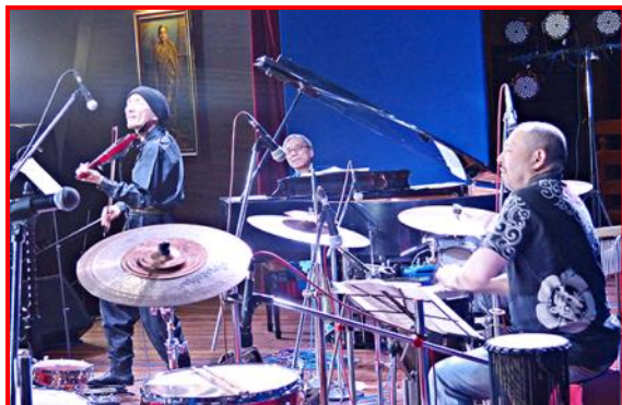
Jazz Concert is in progress