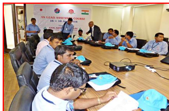
5S Lead Assessor Course in progress

The training program will provide both technical knowledge and practical skills essential to become a competent LEAD ASSESSOR OF 5S PRACTICE by carrying out live audits in a few companies. 20 participants from 6 companies participated in this program.