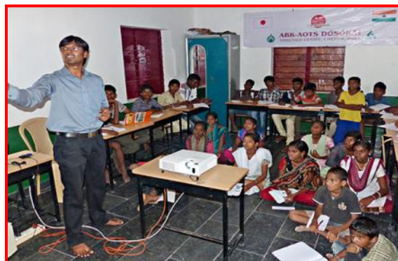
Summer Camp in progress