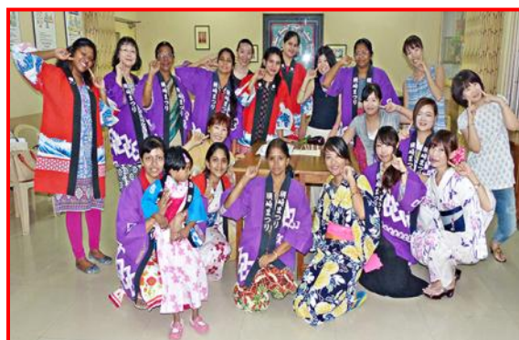
Obon demonstration in Progress

The theme of Japanese vegetables on 7 April 2016