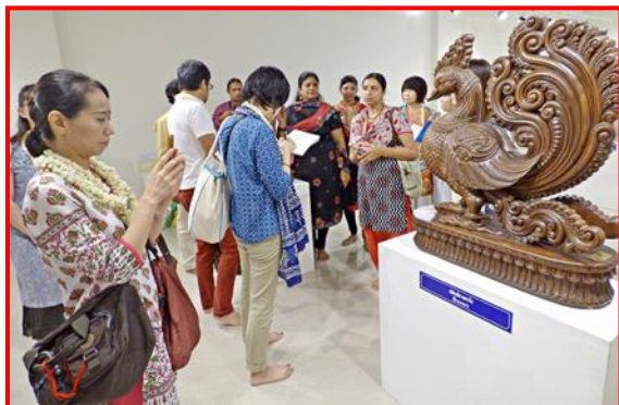
Visit to Ulaga Tamil Mayyam, Taramani