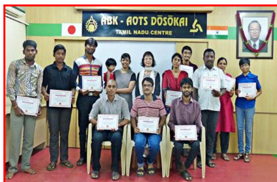
Group photo taken during the Kana Contest