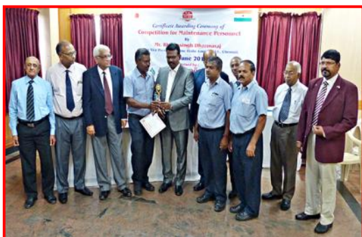
Photos taken with winners of the Competition on Maintenance Personnel