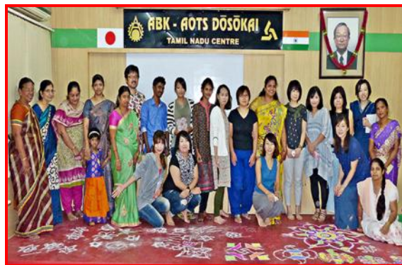
Demonstration of Rangoli in Progress