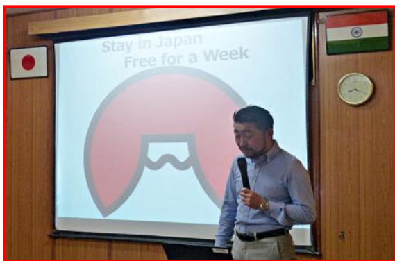
Nikkei Asia Recruiting Forum addressed the audience

The Nikkei Asia Recruiting Forum addressed us informing us about Universities wanting to accept students from Indian Universities organised by Nikkei Human Resources , Inc & Sponsor by The Japan Foundation , Nikkei Inc., Global Business Bureau.