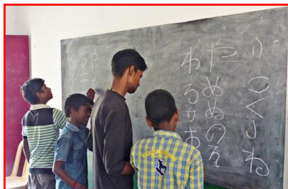
Summer Camp in progress

As part of the year long activities "Waku Waku Club" conducted the a Special Summer Camp for Suyam Charitable Trust, Chennai about Japan for the students to get more experience about Japan in Chennai via culture, language, song, dance, games and origami by our Students of Nihongo Gakko, (Japanese Language School) on 9 to 14 May 2016