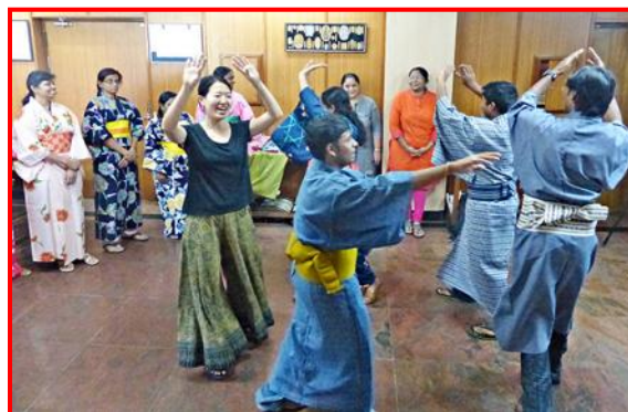
Yukata Wearing & Demonstration Obon Dance in Progress