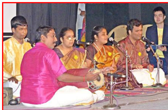
Visually impaired Artists trained by NGO Freedom Trust performed during the Chennai charity concert