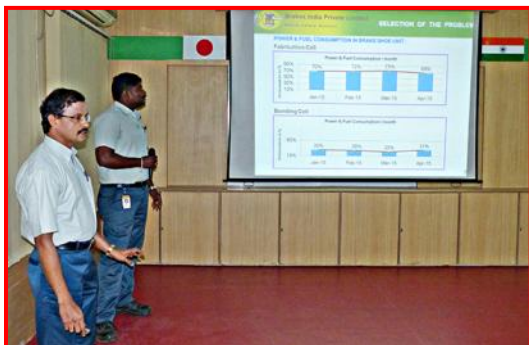
Competition on Maintenance Personnel – Session in Progress