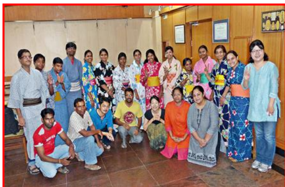
Group Photo taken during the Yukata Wearing & Demonstration Obon Dance