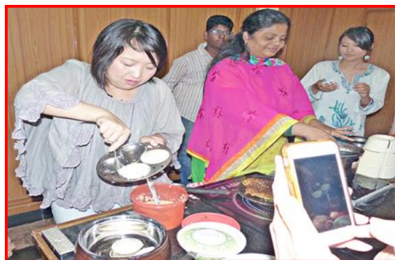
Cooking demonstration in progress