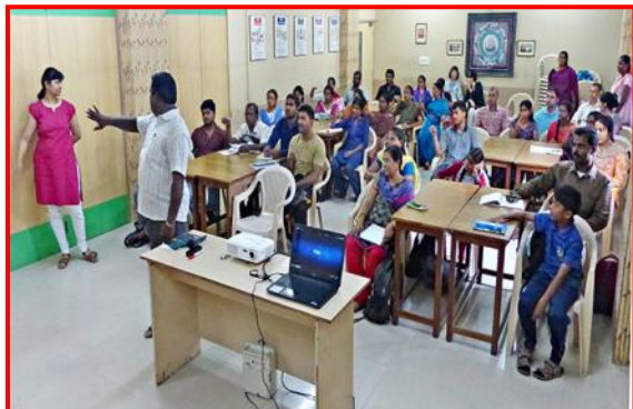
Section of the Hiragana Games in progress