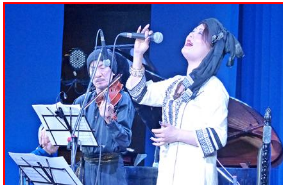
Jazz Concert is in progress