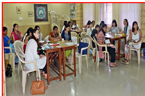
Coffee meet in progress