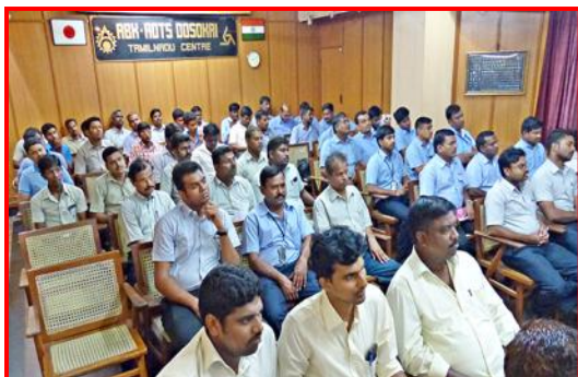
Section of participants of “Competition on Maintenance Personnel”