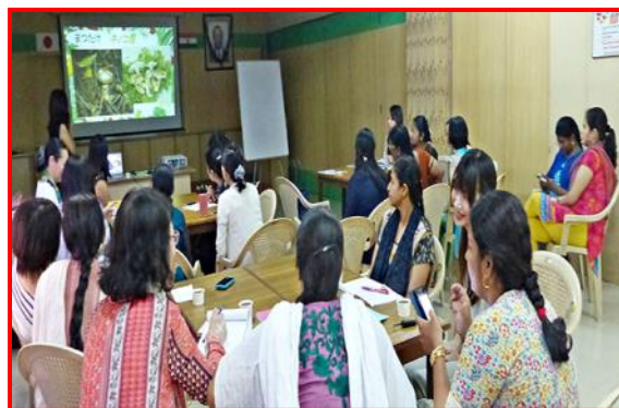
Coffee meet in progress