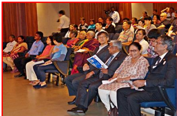
Chennai Charity Concert – Section of the audience