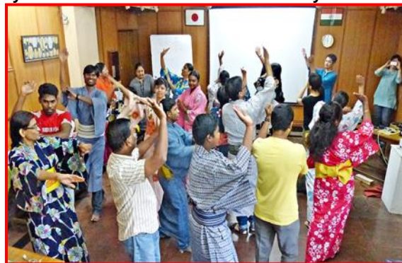
Yukata Wearing & Demonstration Obon Dance in Progress