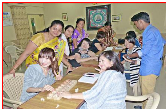
Demonstration of Tamil Pronunciation in Progress