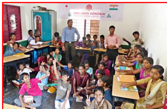
Summer Camp in progress