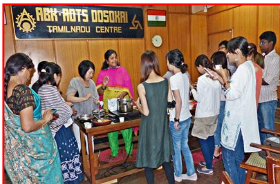
Cooking demonstration in progress