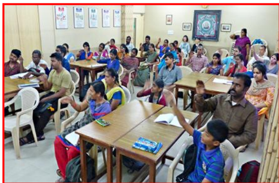
Section of the Hiragana Games in progress