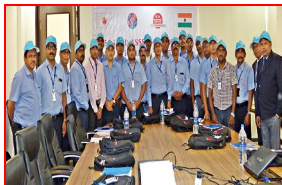
Group photo taken during the 5S Lead Assessor Course