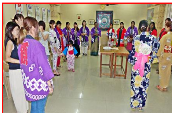
Obon demonstration in Progress