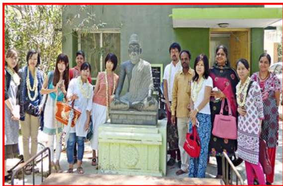
Visit to Ulaga Tamil Mayyam, Taramani