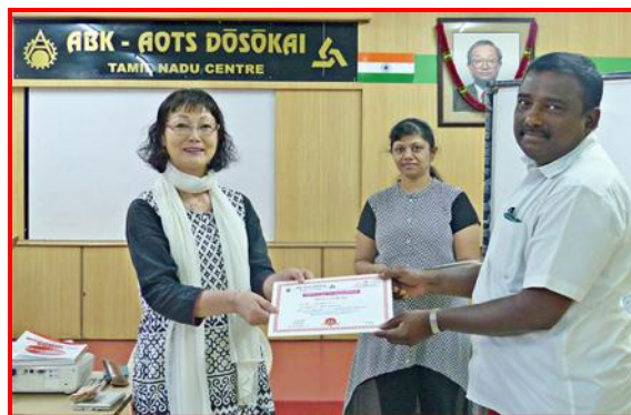
Certificate awarding ceremony of Kana Contest

A contest was conducted with three levels and students with best handwriting were selected as winners.