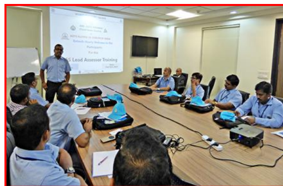
5S Lead Assessor Course in progress