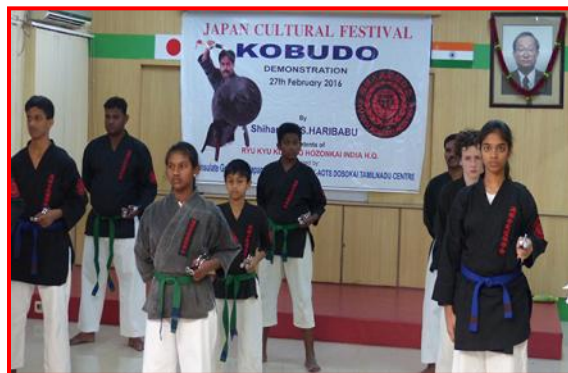
Kobudo demonstration in progress