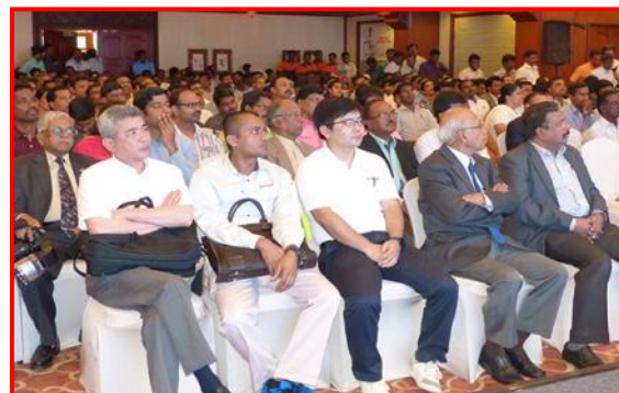
Section of delegates during the One Day Seminar on 5S Practices