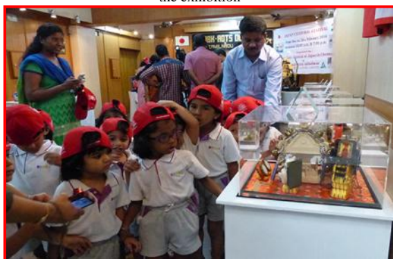
Section of the audience during the Japan Cultural Festival