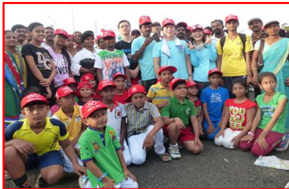
Section of participants of Mini Marathon