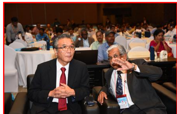
Section of the audience during the Monozukuri Conference