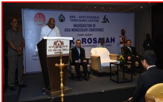
His Excellency Dr. K. Rosaiah, Honourable Governor of Tamilnadu delivering the inaugural address during the Monozukuri Conference