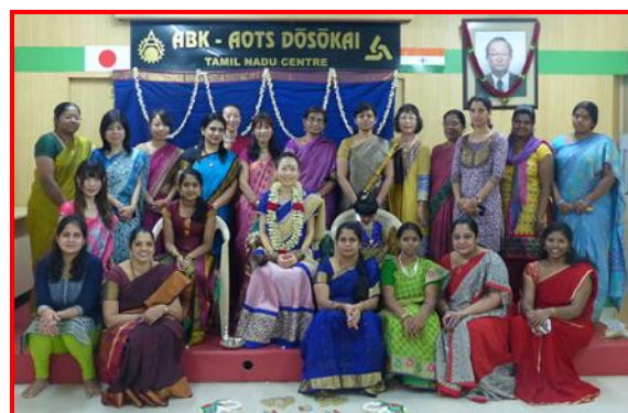
Group photo taken during the Coffee meet with Japanese