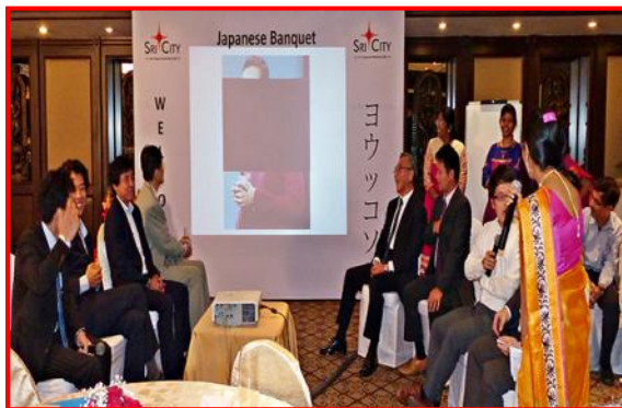
Japan Cultural Program by our Japanese Language School Students in progress