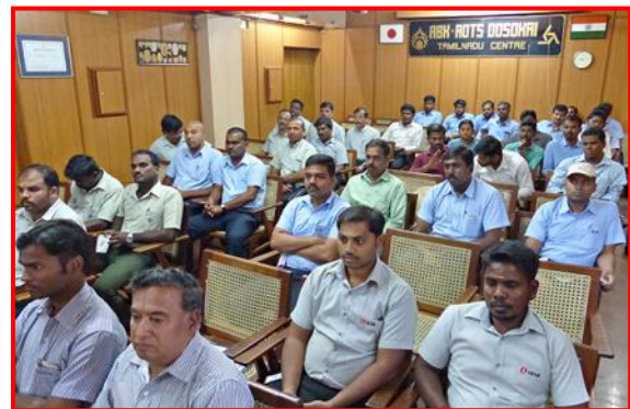
Section of participants during the SMED Competition