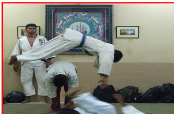
Judo demonstration in progress

All these events aim at providing an opportunity for the people in Chennai to know more about Japanese cultures and thus to strengthen the mutual understanding and friendly relationship between Japan and India.