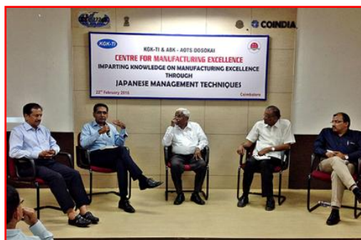
Panel Discussion in Progress

The First program along with KGK – TI , on "The Daily Work Management", (DWM) was conducted on 12 March 2016 at Coimbatore.