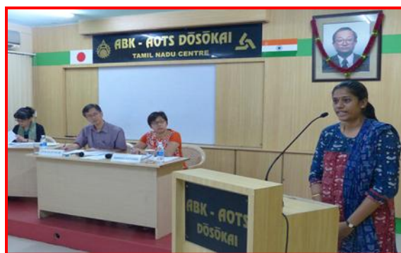
Preliminary Round Japanese Language Speech contest in progress