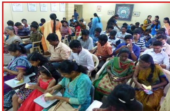
Origami demonstration in progress