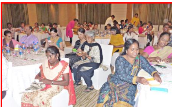
Section of the participants during the seminar