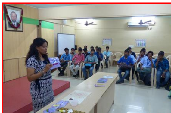
Nendo No Tetsukuri demonstration in progress