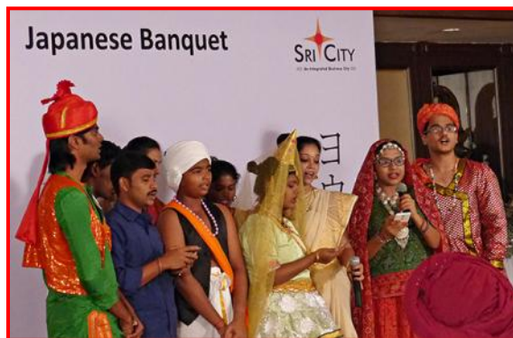
Japan Cultural Program by our Japanese Language School Students in progress

On special request from Sricity - Tada, we organised the a Japan Cultural Program at Taj Coromandal, Chennai on 12 February 2016. Our Japanese Language School students performed the various cultural events during the program.