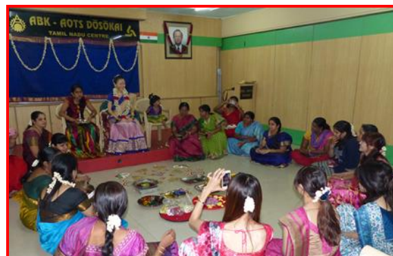
Coffee meet with Japanese – session in progress