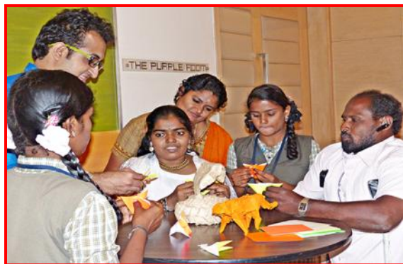
Section of the participants during the seminar