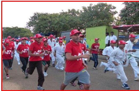
Section of participants of Mini Marathon