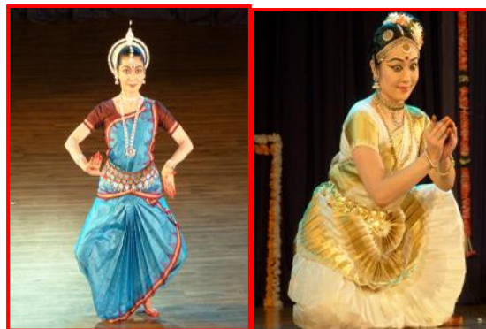
Dance Festival “A Night of Jasmine” by Japanese Dancers of Indian Classical Dances in progress