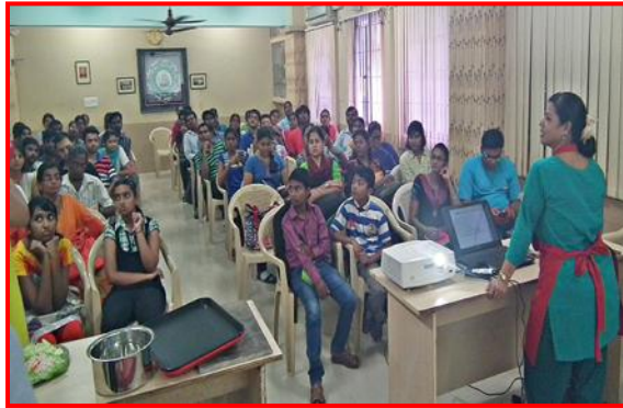
Live Cooking Demonstration of Japanese Food in progress