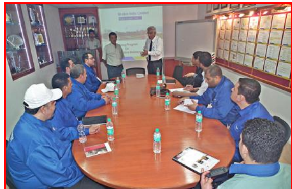
WNF Program in Progress at Brakes India Ltd