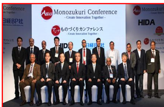
Group Photo taken during the Monozukuri Conference