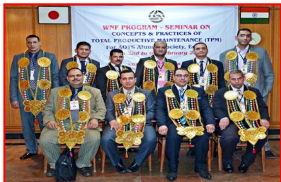
Group Photo taken during the WNF Program