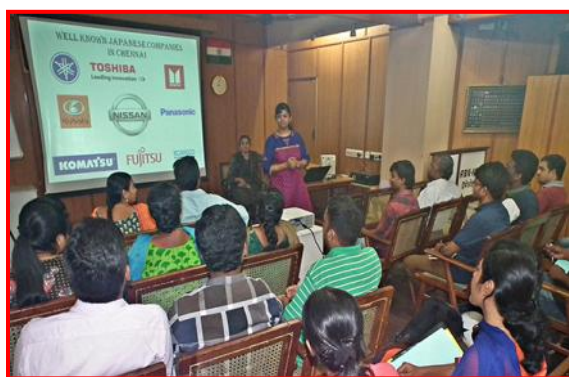
Section of the participants attending the Japanese Language Introduction Classes

The Language School of our centre started fresh batches of Japanese language courses for different levels of Proficiency of The Japan Foundation Examinations commenced on the 3 rd January 2016. Script Course N5 ~ N1 & Spoken Japanese are offered this year. Well trained staff, easy accessibility, affordable Pricing, excellent infrastructure and well equipped Library, with a number of Audio, Video materials make this educational institution different from others.