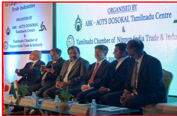
Dignitaries on the Dias during the Award Giving Ceremony