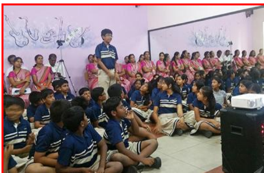
Group Photo taken during the visit of KPR College