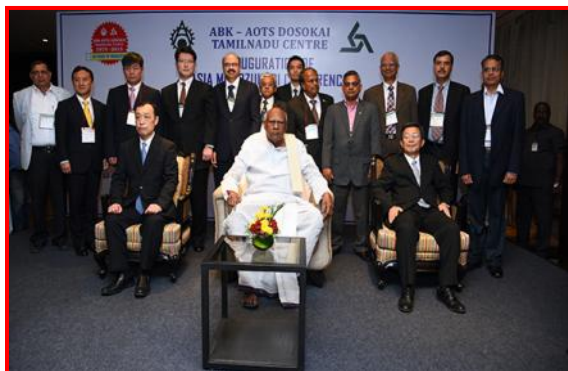
Group Photo taken during the inaugural ceremony of Monozukuri Conference