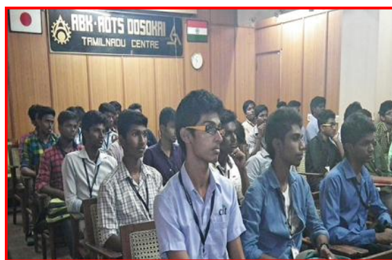
CIT Classes at our centre in progress