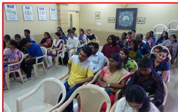
Preliminary Round Japanese Language Speech contest section of audience