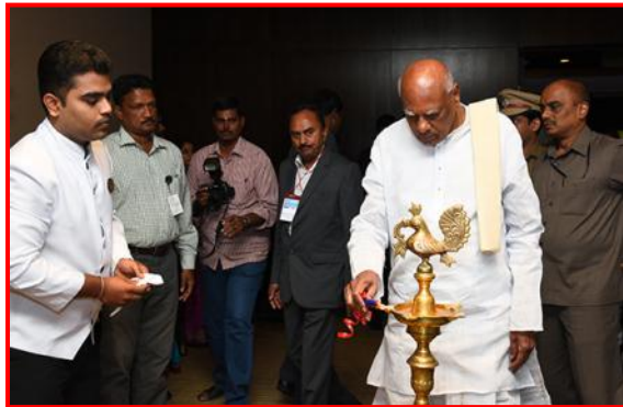
His Excellency Dr. K. Rosaiah, Honourable Governor of Tamilnadu lighting the kuthuvilaku during the Monozukuri Conference

It was a grand success in which the participants were mutually benefited by interacting with one & another and also by dissemination of knowledge by the eminent speakers.