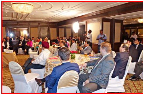
Japan Cultural Program by our Japanese Language School Students session of the delegate