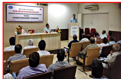
Panel Discussion in Progress