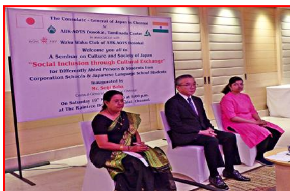
Dignitaries on the Dias during the Seminar