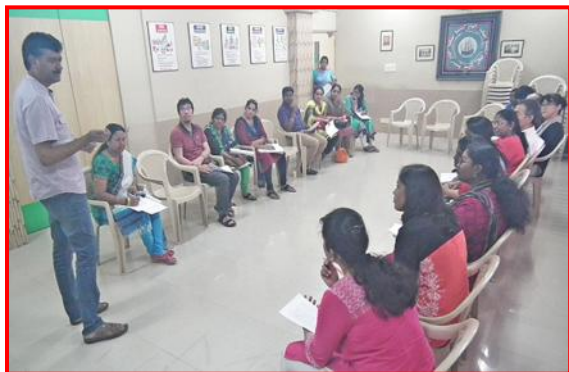
Japanese Language Teachers Meeting in Progress

The Japanese Language Teachers Meeting of our centre was held on 7 th February 2016 at 12.00 noon at our centre to discuss about the Fresh Classes for Level N5 ~ N1. More than 25 teachers were present and they expressed their suggestions and ideas for improving the teaching methodology to make the classes more informative, interesting & enthusiastic.