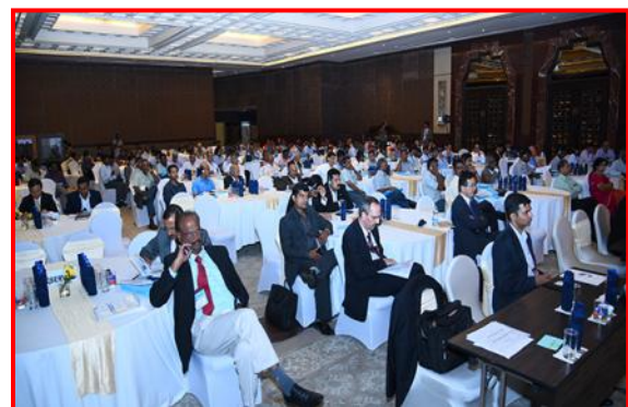
Section of the audience during the Monozukuri Conference