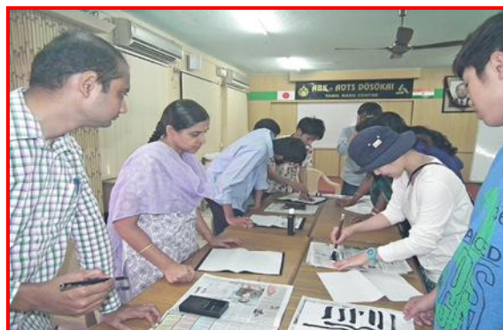
Calligraphy demonstration in progress

The Calligraphy Demonstration was organised on 24 th Feb 2016 at 10.00 am during their visit to our centre. We also organised the home stay during their stay in Chennai