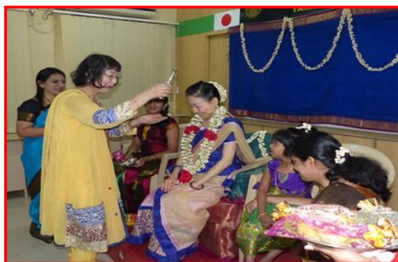
Coffee meet with Japanese – session in progress

Waku Waku Club takes this opportunity to arrange an interaction with the Japanese women along with a cup of coffee twice a month. Each of these coffee meets will be for 2 hours and topic of discussion can be anything of interest to both the sides. The Coffee meet was conducted on 17 March 2016 on the theme of Valakkappu