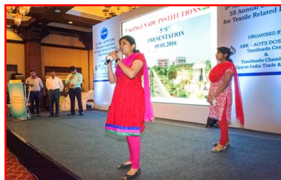
Case study Presentation on Best 5S Practices in progress