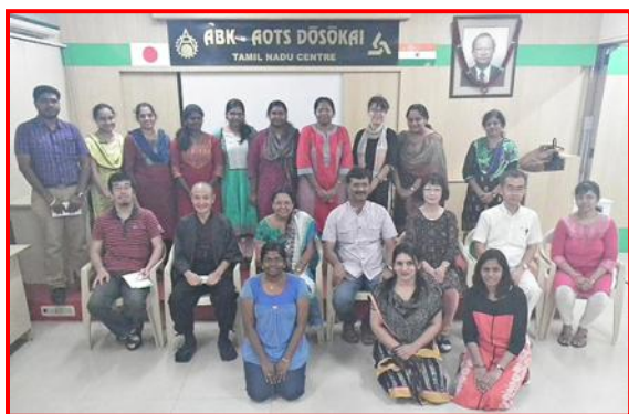
Group Photo taken during the Japanese Language Teachers Meeting