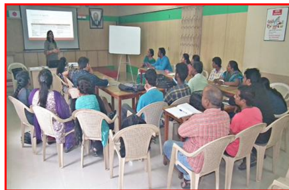
Speech club session in progress

The Speech Club is formed to train the students to participate in the Japanese Language Speech Contest and speak Japanese fluently.