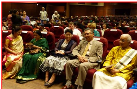
Section of the audience during the Dance festival “A Night of Jasmine” by Japanese Dancers of Indian Classical Dances