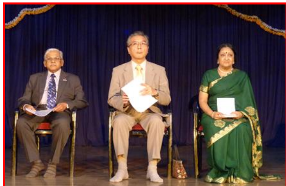
Dignitaries on the Dias during the Dance festival “A Night of Jasmine” by Japanese Dancers of Indian Classical Dances