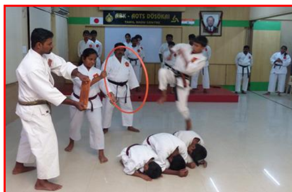
Karate demonstration in progress