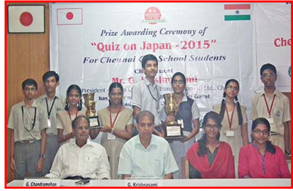
Prize winners of `Quiz on Japan – 2015