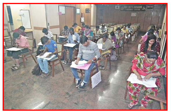
One Section of the students taking Final Exam