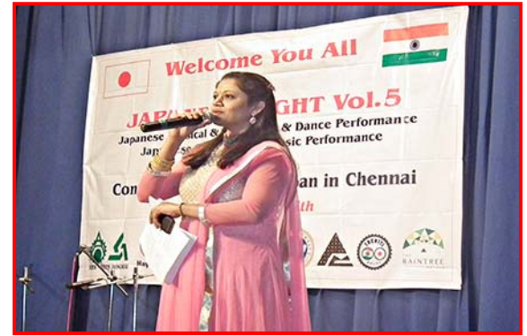
Performance of the students of our Nihongo Gakko