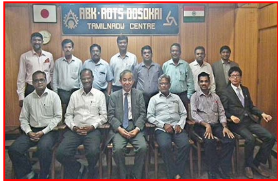
Group photo taken during the pre orientation program conducted at our centre