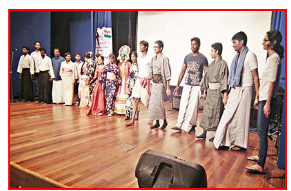
Performance of the students of our Nihongo Gakko