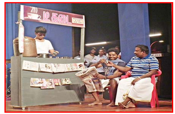
Performance of the students of our Nihongo Gakko