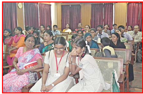
Section of audience during the Quiz on Japan – 2014