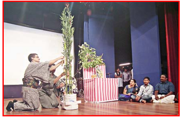
Performance of the students of our Nihongo Gakko