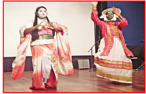
Performance of the students of our Nihongo Gakko