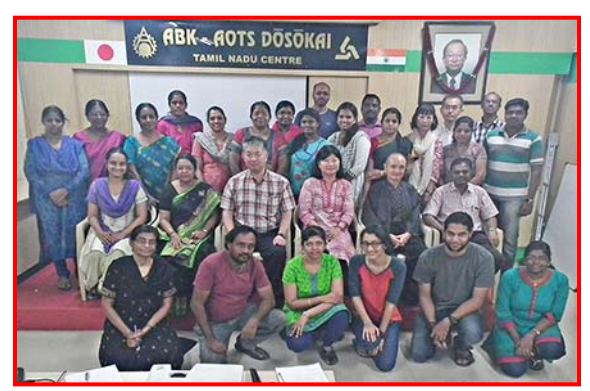
Group photo taken during the Interpreter workshop