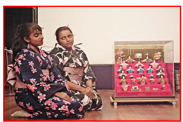
Performance of the students of our Nihongo Gakko