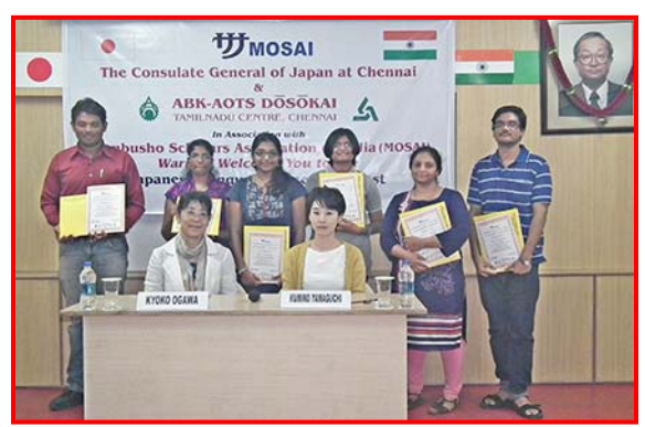
Winner of Mosai Japanese Language Speech Contest – Southern Region