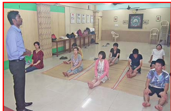
19 th JISC Team has practice Yoga