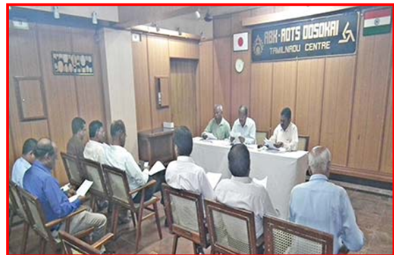
Annual General Body Meeting in Progress