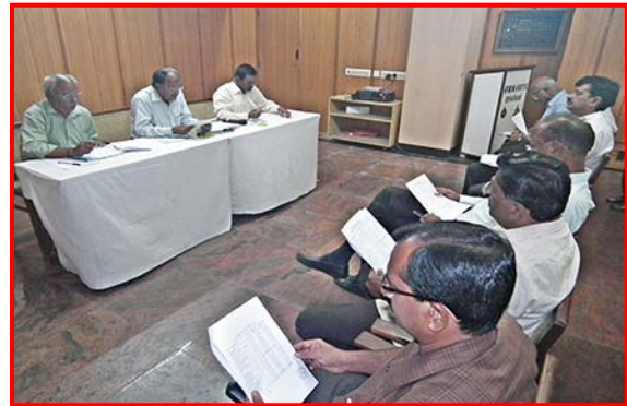
Annual General Body Meeting in Progress