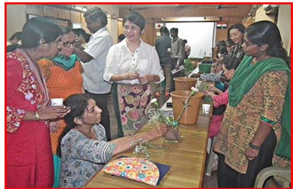
Ikebana demonstration in progress