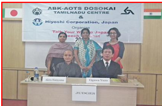
Winners of Japanese Speech Contest