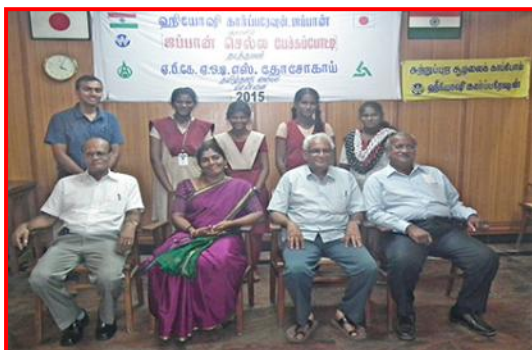
Winners of Tamil Speech Contest