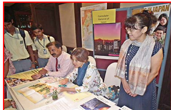
Japan Study Fair in Chennai is in Progress