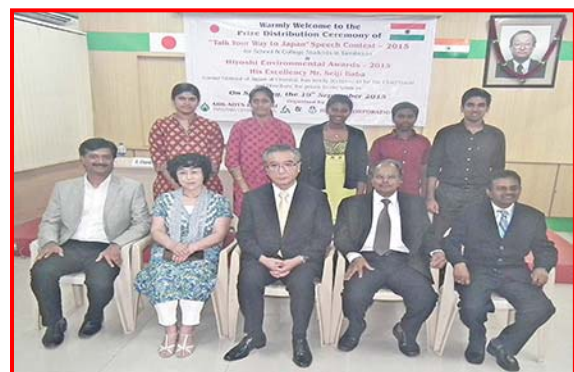
First Prize winners of Talk Your Way to Japan