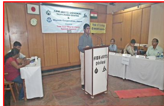
Talk Your Way to Japan –English Speech Contest in Progress