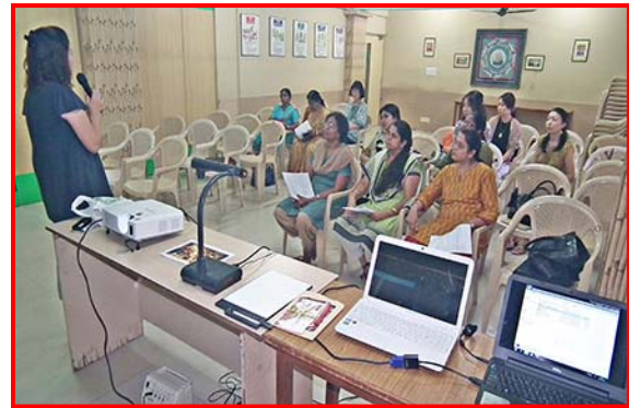
Waku Waku club activity in progress