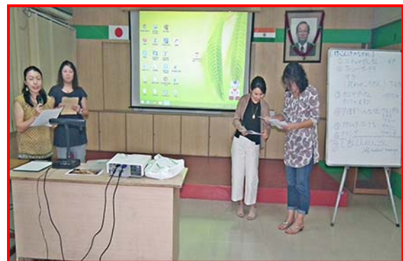
Waku Waku club activity in progress