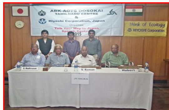
Winners of English Speech Contest