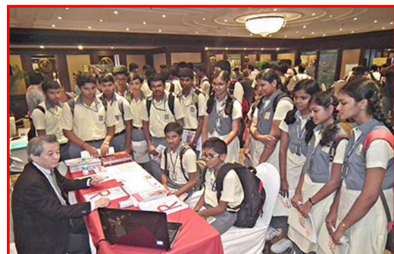
Japan Study Fair in Chennai is in Progress