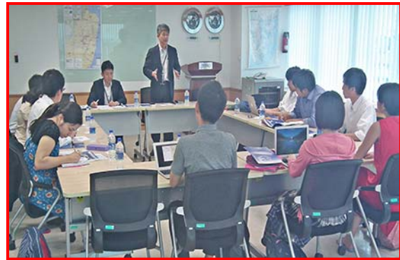
19 th JISC Team had discussion with JETRO, Chennai