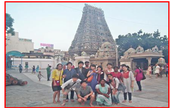
19 th JISC Team visited Kapaleeshwar Temple