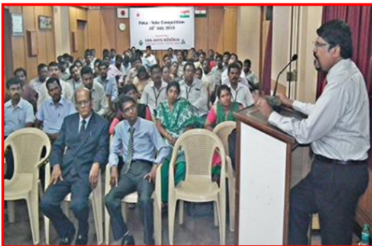
Section of delegates during the Poko - Yoke Competition