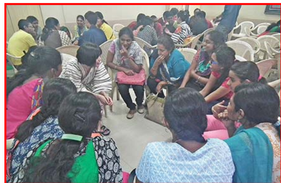
19 th JISC Team had discussion with our Japanese Language Students