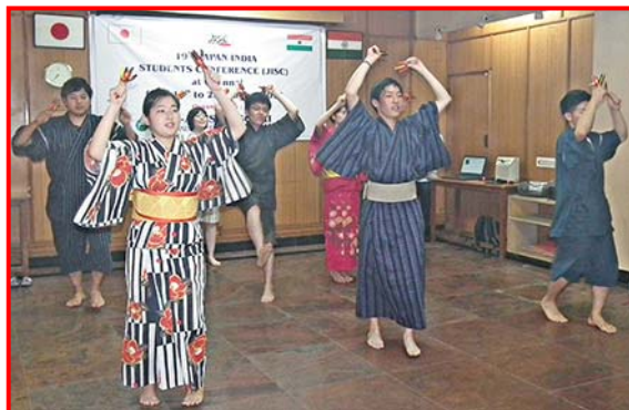
Performance of 19 th JISC Team during the welcome dinner