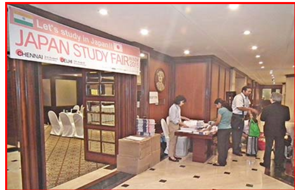
Japan Study Fair in Chennai is in Progress

License Academy, Japan and ABK-AOTS DOSOKAI, Tamilnadu Centre supported by The Embassy of Japan in India & The Consulate –General of Japan in Chennai organized a JAPAN STUDY FAIR IN INDIA on Monday, 3 rd August 2015 between 10:30 a.m. to 4:30 p.m. at Taj Coromandel, Mahatma Gandhi Road, Chennai.