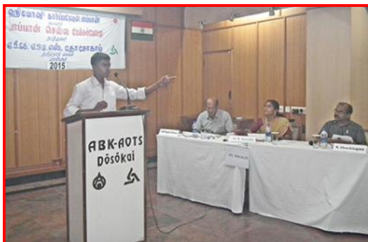
Talk Your Way to Japan – Tamil Speech Contest in Progress