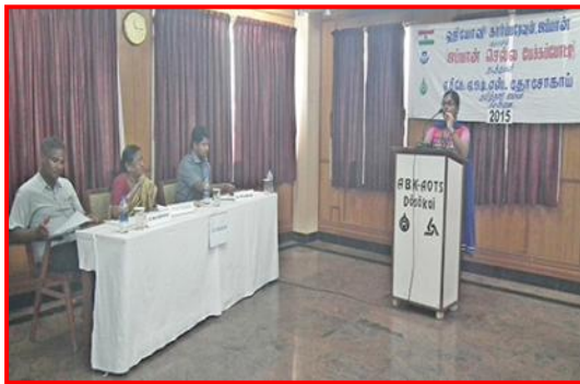
Talk Your Way to Japan – Tamil Speech Contest in Progress