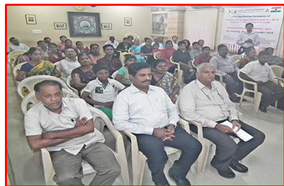
Section of audience during the prize awarding ceremony