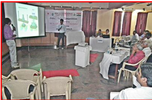
Poko - Yoke Competition in Progress