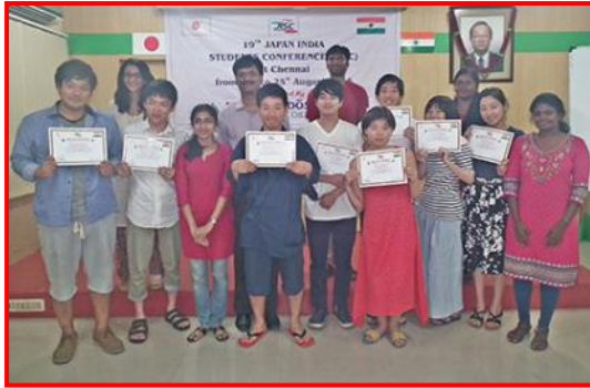
Group photo taken during the valedictory ceremony of 19 th JISC Team