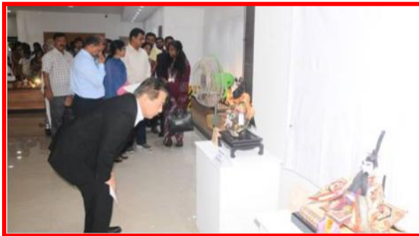
Origami Demonstration --- 12 & 21 September 2024 ---